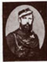
4 CHARLES XIV NORWAY