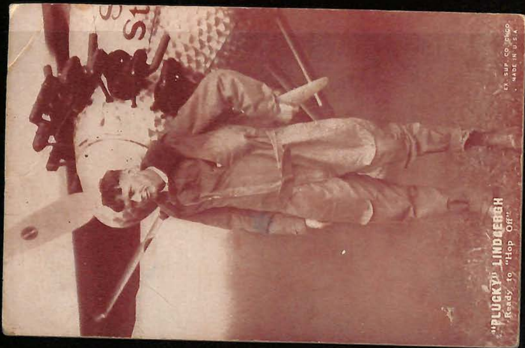
"PLUCKY" LINDBERGH Ready to "Hop Off"