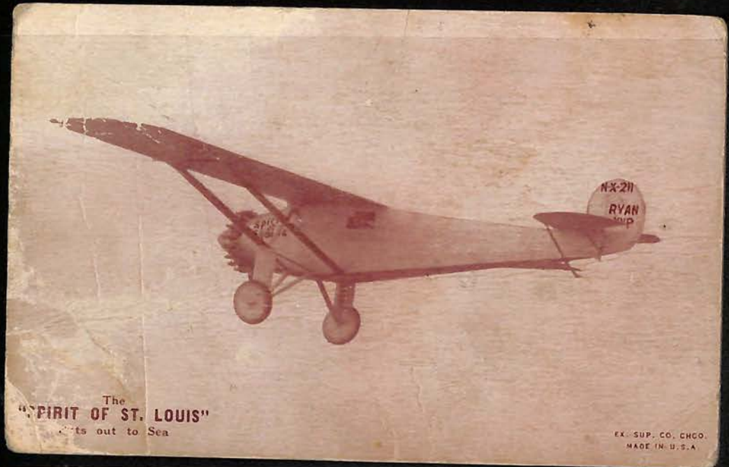
The "SPIRIT OF ST. LOUIS" Sets out to Sea