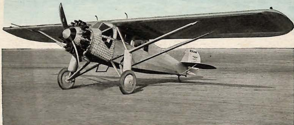
FLYING DAILY OVER WASHINGTON FROM THE WASHINGTON AIRPORT

FLY IN THE NEW RYAN BROUGHAM, SISTER-SHIP OF LINDY'S "SPIRIT OF ST. LOUIS"