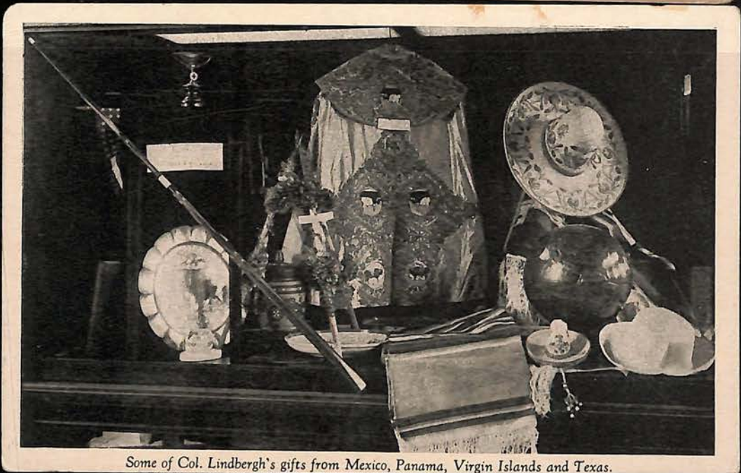
Some of Col. Lindbergh's gifts from Mexico, Panama, Virgin Islands and Texas.