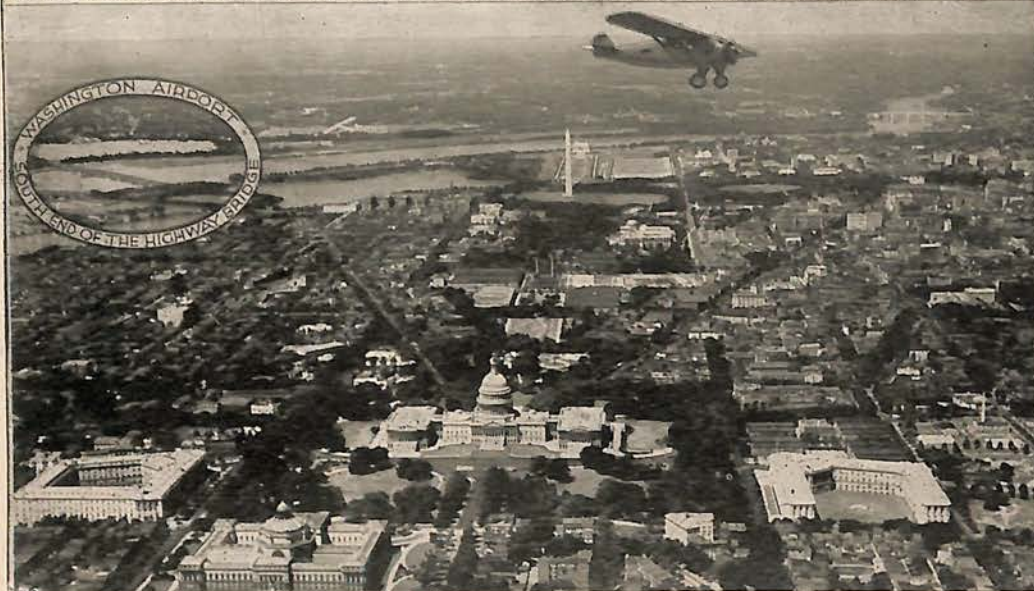
THE MOST SCENIC RIDE IN AMERICA

SISTERSHIP OF THE "SPIRIT OF ST LOUIS" FLYING OVER WASHINGTON FROM WASHINGTON AIRPORT