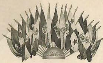
HOMENAJE DE HONDURAS