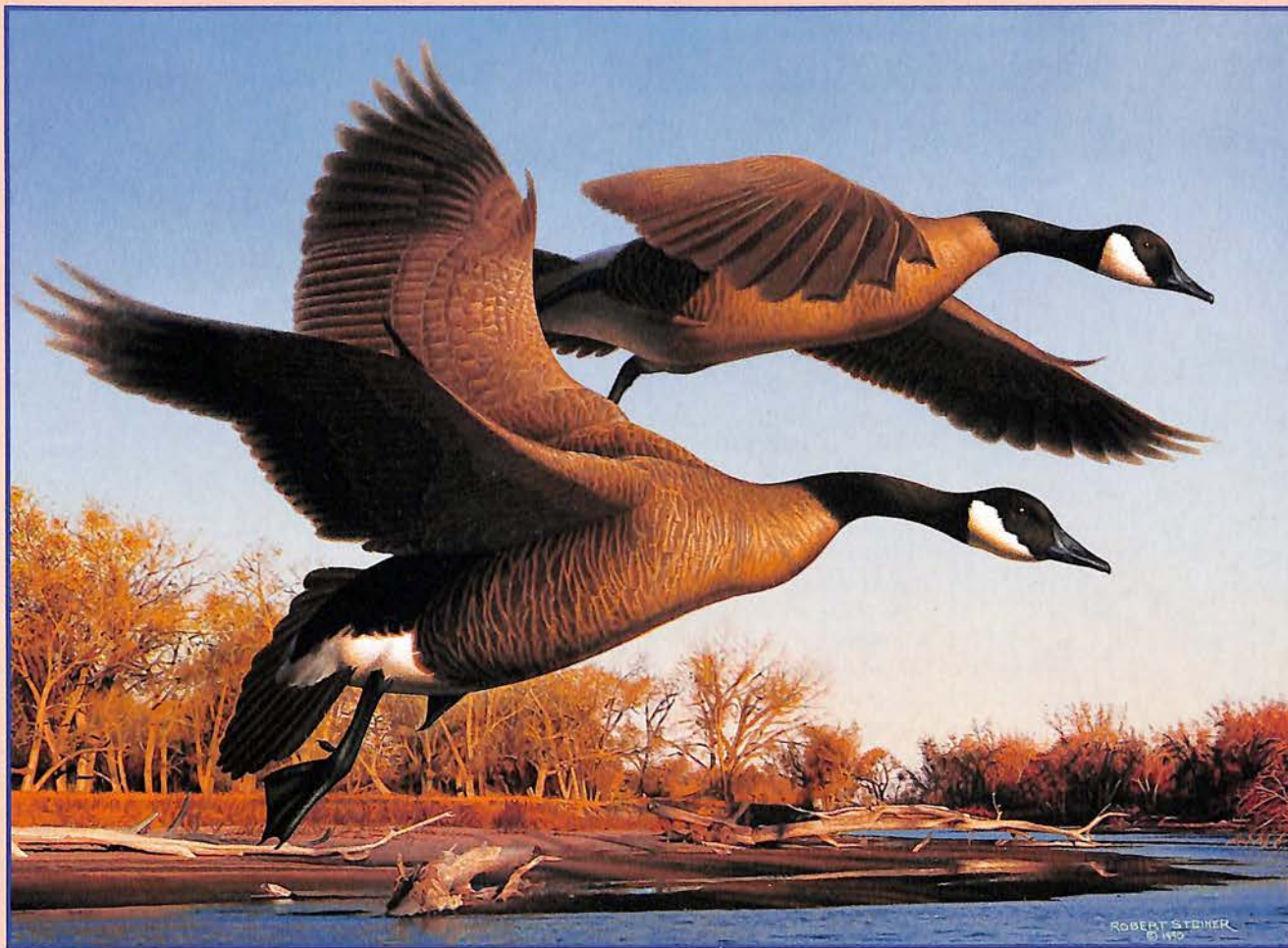
DUCK STAMP PRINT & GOVERNOR'S WETLANDS RELIEF STAMP