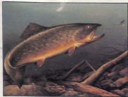
1983 DELAWARE TROUT STAMP