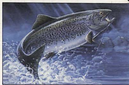
1984 INDIANA TROUT STAMP