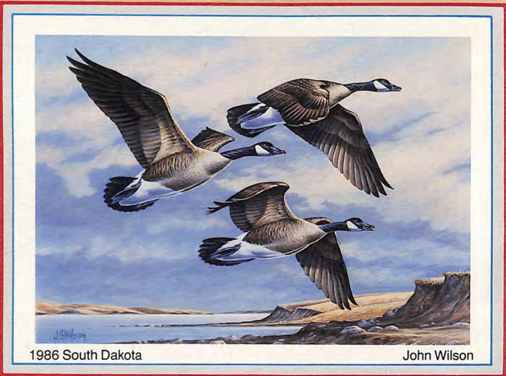
1986 South Dakota