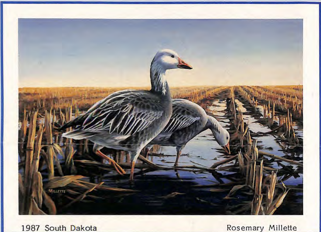
1987 South Dakota

Artist: Rosemary Millette Subject: Blue geese Signed & Numbered Edition Size: Pre-set to 1986 edition size Time limited; Cutoff is 2/28/88 - Shred Date Pencil & Color Remarques Part of Signed & Numbered Quantity Image Size: 6½ x 9 Sheet Size: 12 x 14 Retail Price: Price: $135.00 Pencil Remarques: $230.00 Color Remarques: $330.00 Mint Stamps: $2.00 Signed Stamps: $4.50 Scheduled Delivery: Late Summer 1987