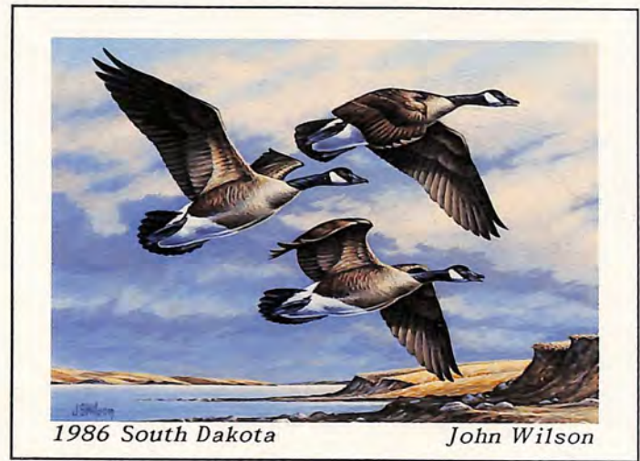
1986 South Dakota