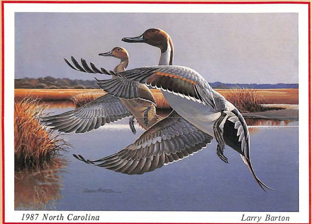
1987 North Carolina