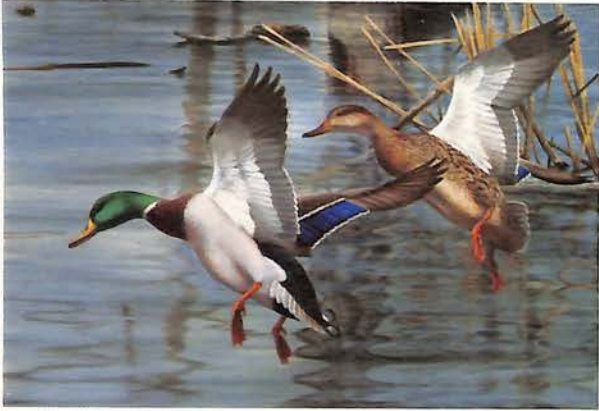
1983 North Carolina