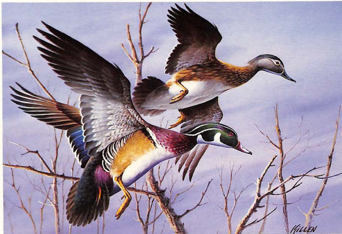
1984 North Carolina