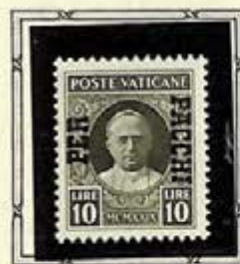
Pope Pius XI

SPECIAL DELIVERY STAMPS OF 1929 OVERPRINTED "PER PACCHI"