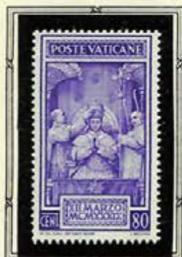
Coronation of Pope Pius XII