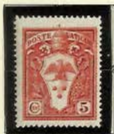
Arms of Pope Pius XI