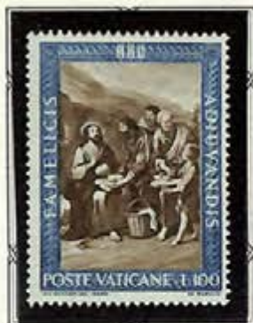
Miracle of Loaves & Fishes