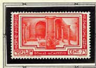
Basilica of St. Petronilla