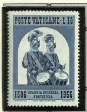
Swiss Guard Drummers

It recalls the most gallant stand of the Corps during the Sack of Rome in 1527 when they fought a delaying action to permit Pope Clement VII to attain safety. The Guardsmen who manned the barricades did not retreat, but were slain to the last man.