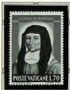
St. Louisa De Marillac