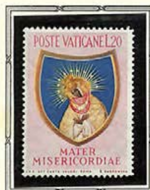
Madonna of the Spiked Gate

The termination of Marian Year is marked by this set of three stamps based on a religious painting, "Madonna of the Spiked Gate" which graced a portal in the Jagellon Wall of Vilna. The identity of the artist appears to be a mystery.