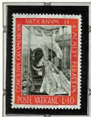
Pope John Being Borne to Opening