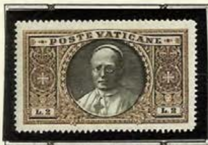
Pope Pius XI