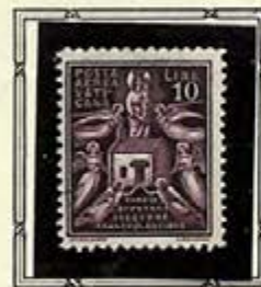
Our Lady of Loreto

This represents the first set of airmails issued by Vatican City. Figures taken from various art treasures, are allegorical of the religious concepts of heaven and man's conquest of the air for peace.