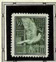
Dove of Peace