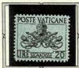
Papal Tiara and Crossed Keys