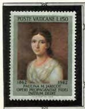
Paulina M. Jaricot