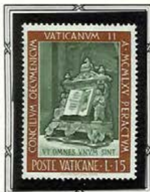
Ancient Bible Displayed at Sessions