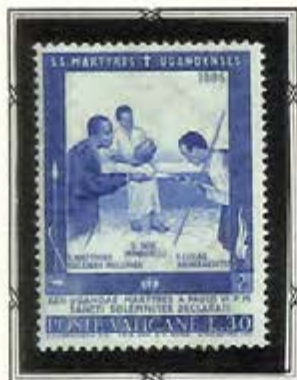
Martyrs of Uganda