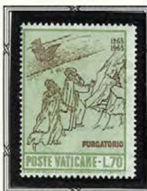
Dante and the Virgil at Entrance to Purgatory