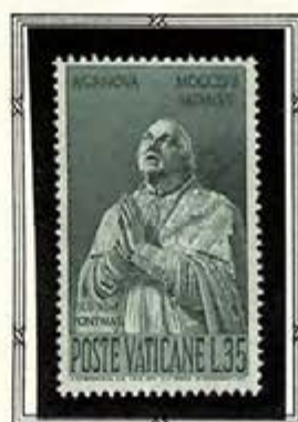
Pope Pius VI