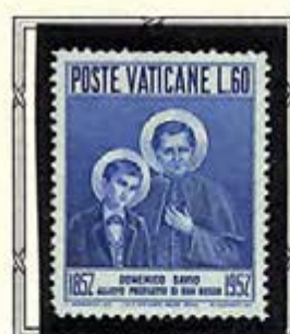
St. Savio & St. Bosco

Issued on March 21, 1957 to commemorate the centenary of the death of St. Dominic Savio. A student of St. John Bosco, St. Dominic is best remembered as the organizer of the Company of the Immaculate Conception which formed the nucleus of the Salesian Order. St. Dominic Savio was beatified in 1950 and canonized in 1954.