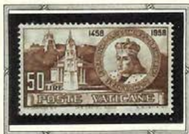
Head of St. Casimir