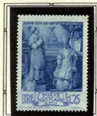
Consecration of Archbishop Pacelli by Pope Benedict XV