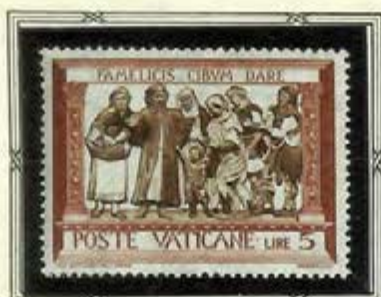
Feed the Hungry