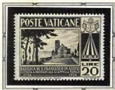
Saint Francis Basilica