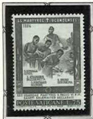
Martyrs of Uganda