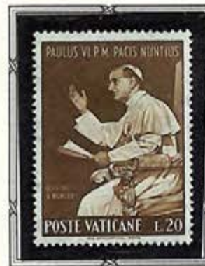
Pope Paul VI