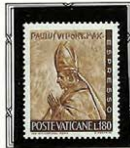
Pope Paul VI

In November, 1964, Pope Paul VI consecrated the altar in his renovated private chapel in the Apostolic Palace at the Vatican. The designs of most of these regular stamps (which replace the 1960 Works of Mercy set) are adapted from the bronze panels on a chair facing this new altar. The panels depict human labor which serves the Eucharist in the building and decorating of churches, supplying the bread and wine for the Eucharistic Service, and (in the case of music) participating in the liturgy of the Mass. The stamps were issued March 8, 1966.