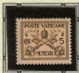
Papal Tiara and St. Peter's Keys