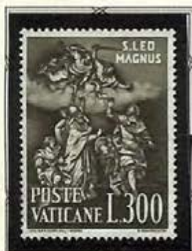
Pope Leo meets Attila