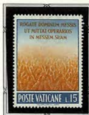
Field of Wheat