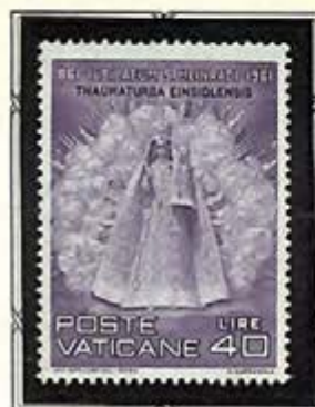
Our Lady of Einsiedeln

This commemorates the eleventh century of St. Meinrad, founder and patron of the shrine at Einsiedeln, Switzerland. St. Meinrad is depicted holding the Lady Chapel in which the statue of Our Lady of Einsiedeln is enshrined. The Benedictine Monastery was erected in 940 to enclose the cell of Brother Meinrad. Eight years later the Monastery Church was erected which enclosed the Lady Chapel.