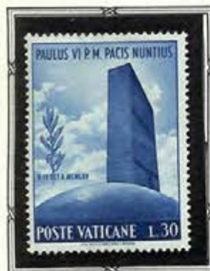
Globe & UN Building