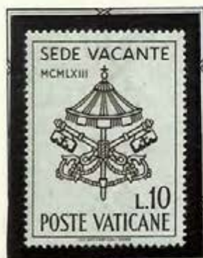
Keys of St. Peter