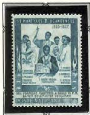
Martyrs of Uganda