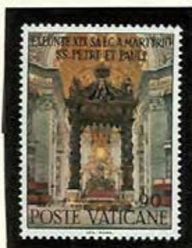
Bernini's Canopy, St. Peter's