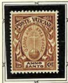
Cross with Orb