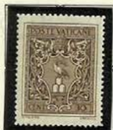
Arms of Pope Pius XII