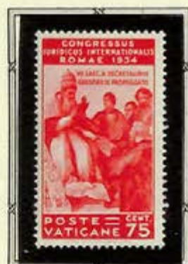
Pope Gregory IX Promulgating Decretals