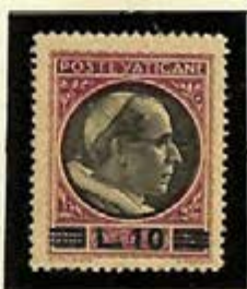
Pope Pius XII