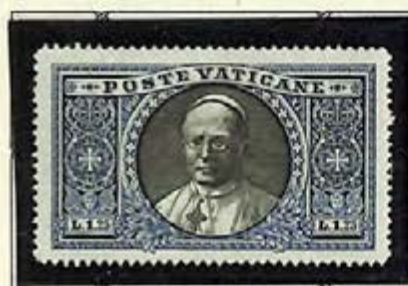
Pope Pius XI