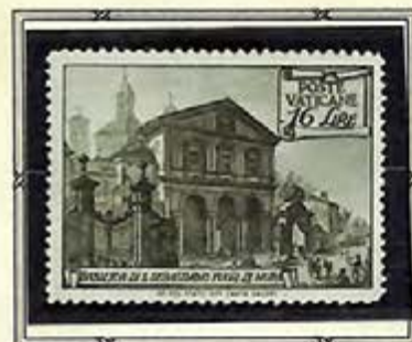
Basilica of St. Sebastian