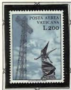
Radio Antenna & St. Gabriel