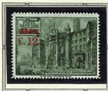
Basilica of the Holy Cross of Jerusalem

On March 15, 1952 a 12 lire provisional stamp was placed on sale. This was made by surcharging the 13 lire value of the Basilicas issue in red.