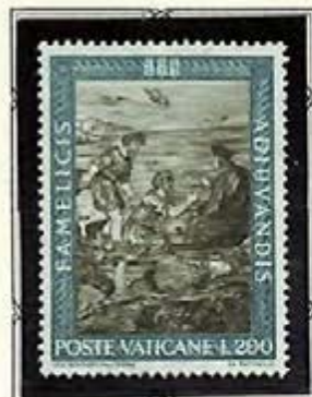
Miraculous Catch of Fishes

Issued to publicize the "Freedom from Hunger" campaign of the UN's Food and Agriculture Organization. Postal administrations throughout the world released similar stamps; some of the funds from their sale went to the FAO.