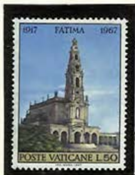
Basilica at Fatima