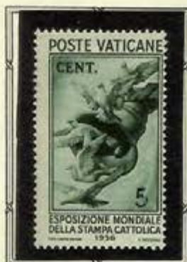
Bell and Doves