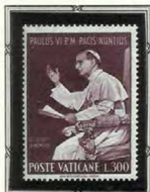
Pope Paul VI