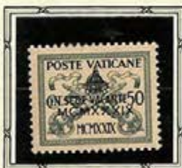
Papal Tiara and St. Peter's Keys