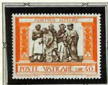
Bury the Dead