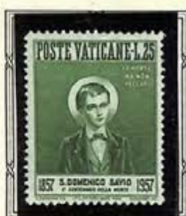
St. Dominic Savio