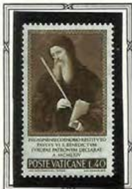
St. Benedict by Perugino