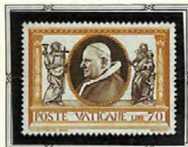
Pope John XXIII Flanked by Faith & Charity