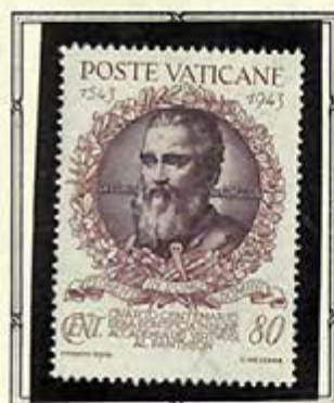
Antonio de Sangallo