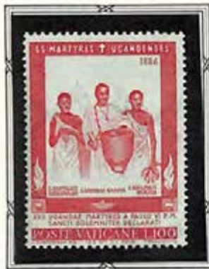
Martyrs of Uganda