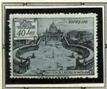
Basilica and Piazza of St. Peter in Vatican City