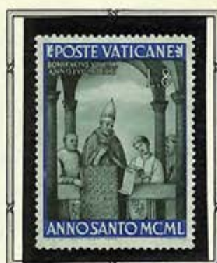
Pope Boniface VIII