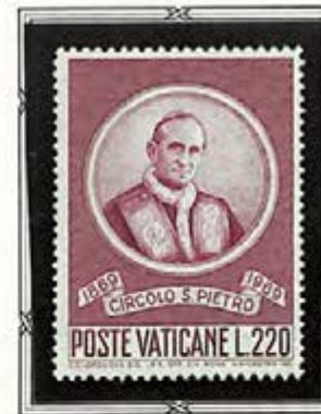
Pope Paul VI

Released in connection with the celebration of the Centenary of St. Peter's Circle. Founded by Pius IX in 1869, he is pictured on the 30L denomination.