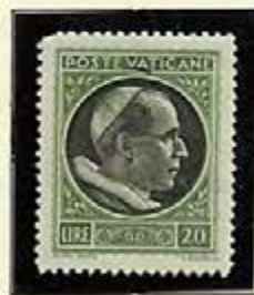
Pope Pius XII