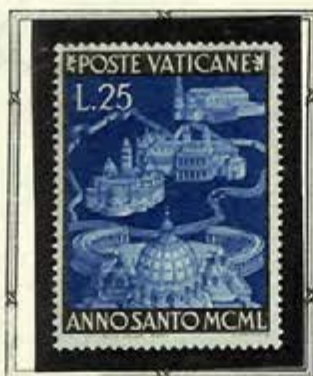
Basilicas in Rome