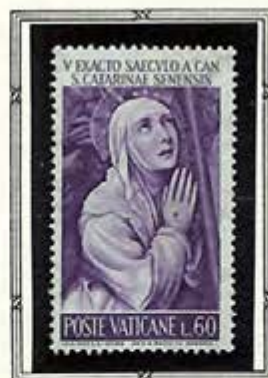
St. Catherine in Prayer