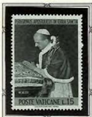
Pope Paul VI

Early in January, 1964, Pope Paul VI made a historic pilgrimage to the Holy Land to visit the birthplace of Christianity and to pay homage at some of the world's holiest shrines.