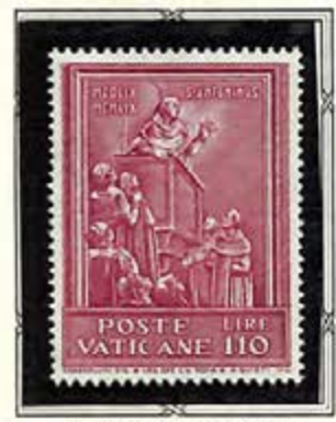
St. Antoninus Preaching