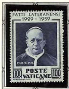
Pope Pius XI

Printed by the photogravure process, this set commemorates the 30th anniversary of the Lateran Pact with Italy which established Vatican City as an enclave and defined relations between the Roman Catholic Church and Italy.