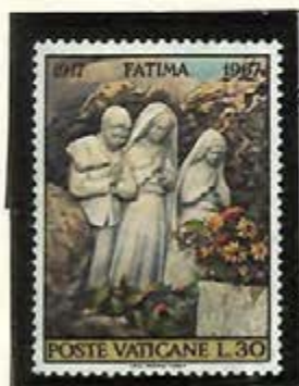
Three Children Statue

On the occasion of the 50th anniversary of the apparitions at Fatima, Portugal, Pope Paul VI made a historic pilgrimage to the holy shrine.