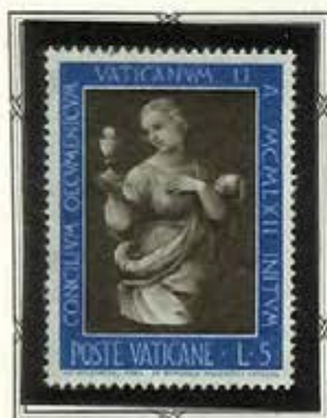
Madonna and Lamp