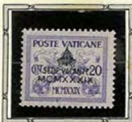
Papal Tiara and St. Peter's Keys