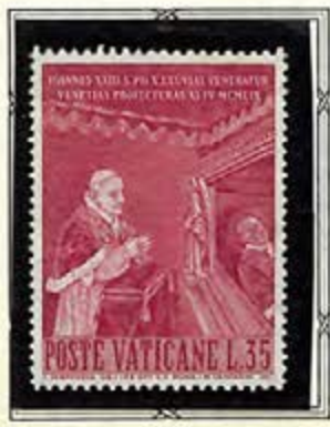
John XXIII Kneeling