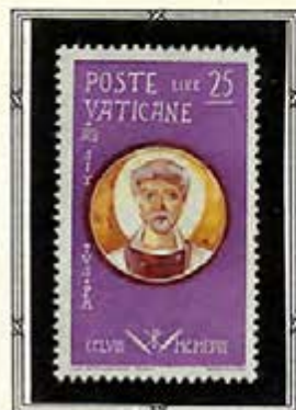
Pope St. Sixtus II