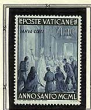
Pope Tapping Holy Door