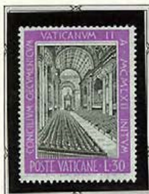
Congress in St. Peter's