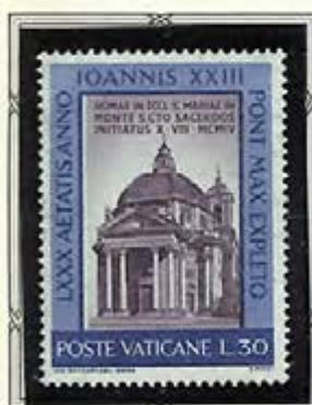
Scene of Ordination