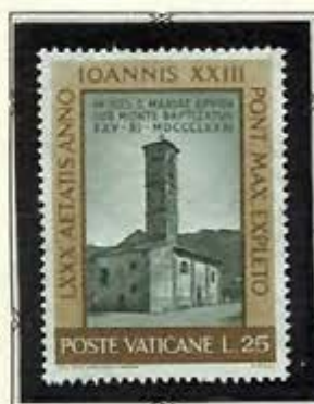
Scene of Baptism