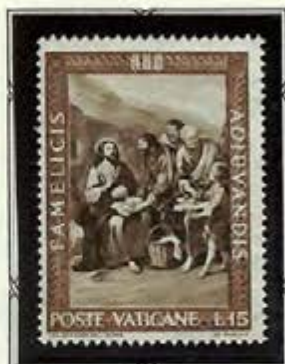
Miraculous Catch of Fishes