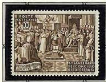
General Council in Session

The Council of Chalcedon was summoned in 451, by Pope Leo the Great. The purpose of the Council was to condemn the errors of the Eutyches who believed Christ had only one nature, and to confirm that there were two natures in Christ. One design shows the General Council in session while the other pictures Pope Leo the Great meeting Attila the Hun.