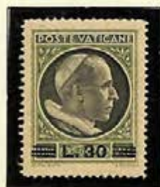
Pope Pius XII