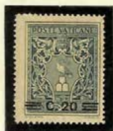
Arms of Pope Pius XII

REGULAR ISSUE OF 1945 OVERPRINTED WITH BARS AND NEW VALUES - UNWATERMARKED PERF. 14