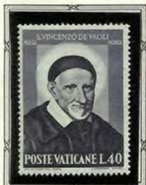
St. Vincent De Paul