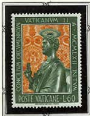
Head of St. Peter