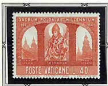
St. Stanislas, Skalka Cathedral and Wawel Royal Palace, Cracow