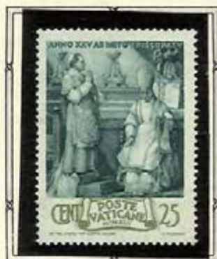
Consecration of Archbishop Pacelli by Pope Benedict XV