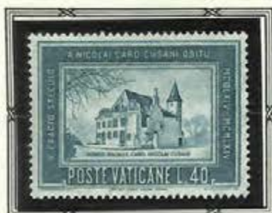
Cardinal Cusano's Birthplace