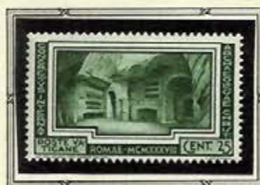
Crypt of St. Cecilia