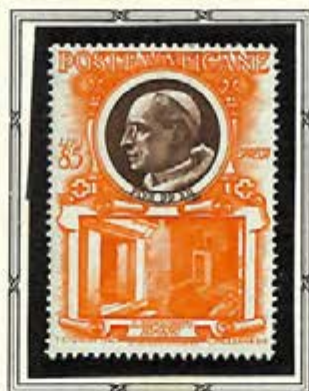
Pope Pius XII