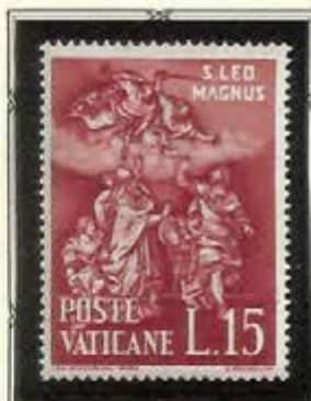
Pope Leo meets Attila

This commemorates the eleventh century of St. Meinrad, founder and patron of the shrine at Einsiedeln, Switzerland. St. Meinrad is depicted holding the Lady Chapel in which the statue of Our Lady of Einsiedeln is enshrined. The Benedictine Monastery was erected in 940 to enclose the cell of Brother Meinrad. Eight years later the Monastery Church was erected which enclosed the Lady Chapel.