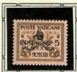
Papal Tiara and St. Peter's Keys

From Feb. 10, 1939, on the death of Pope Pius XI, to March 2nd, day of the election of Pope Pius XII, the Catholic Church was without a head.