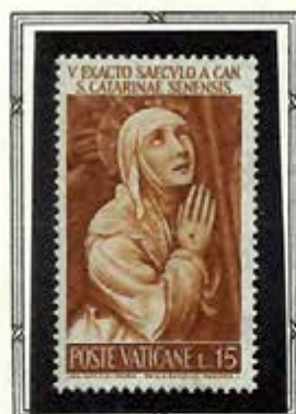
St. Catherine in Prayer

Issued to commemorate the fifth centenary of the canonization of Saint Catherine of Siena. The common design used in the series portrays her in prayer during an execution. The design is taken from a fresco by Sodoma in the Church of St. Dominic in Siena.