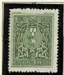
Arms of Pope Pius XII