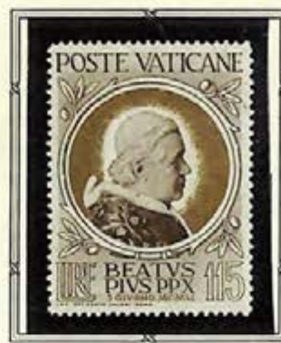
Pope Pius X

The beatification of the late Pope Santo (Pius X) forms the subject for this special commemorative set issued in June 1951. The four stamps show the head of the Pope in profile or full face against a gold background.