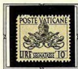
Papal Tiara and Crossed Keys