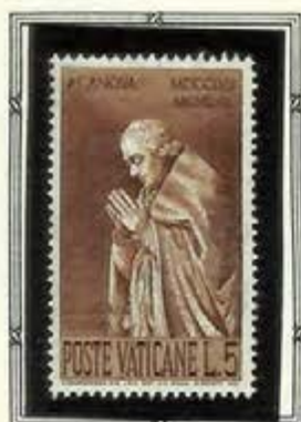
Pope Clement XIII