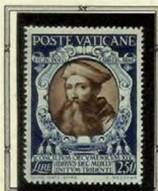
Reginald Cardinal Pole