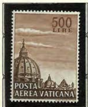
Saint Peter's Dome

Born of a noble family of Assisi, in 1212, Saint Clare founded the order of Franciscan nuns, which spread rapidly through Europe. She guided the work of the order until her death in 1253. Two years after her death she was canonized by Alexander IV. Her festival falls on August 12th.