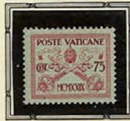
Papal Tiara and St. Peter's Keys