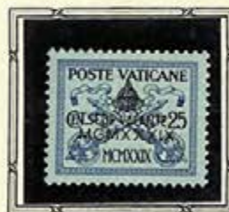
Papal Tiara and St. Peter's Keys