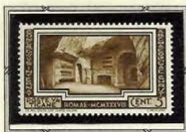
Crypt of St. Cecilia