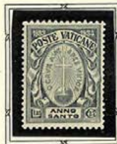
Cross with Orb

Issued in commemoration of the nineteenth centenary of the Redemption.