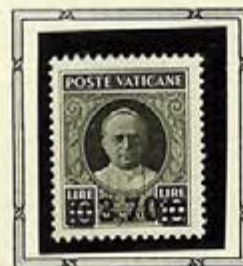
Pope Pius XI