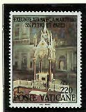
St. Paul's Basilica