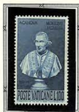
Pope Pius VII

The bicentenary of the birth of the renowned sculptor, Antonio Canova, was marked by this issue which pictures four of his most famous works: the statues of Clement XIII and Pius VI found in St. Peter's Basilica, the bust of Pius VII in the Vatican Museum, and the statue of Clement XIV in the Church of the Apostles, Rome. Canova, known as the founder of the modern classic school, was named Marquis of Ischia by Pius VII for his negotiations with Paris which resulted in the return of the art treasures pillaged from Rome by Napoleon.