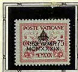
Papal Tiara and St. Peter's Keys