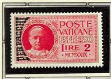
Pope Pius XI

SPECIAL DELIVERY STAMPS OF 1929 OVERPRINTED "PER PACCHI"