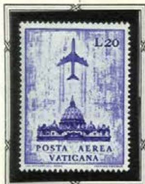
St. Peter's Basilica & Jet