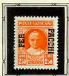
Pope Pius XI