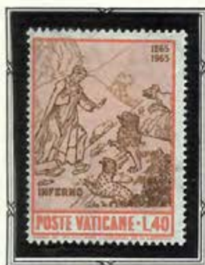
Dante and the Three Beasts at Entrance to the Inferno