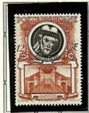
Pope Sylvester I