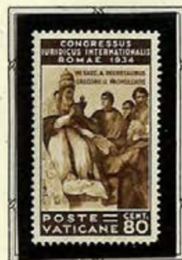
Pope Gregory IX Promulgating Decretals