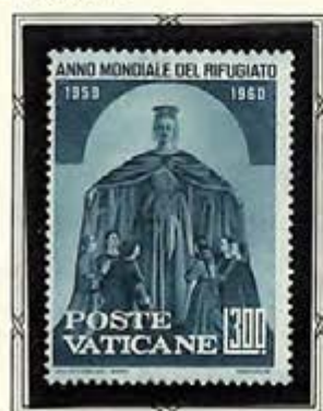
Madonna of Mercy

The first nation to honor the request of the UN to publicize the WRY through stamps, Vatican City portrayed the world's most famous refugees and depicted the need of both spiritual and temporal assistance. The proceeds of this issue were used for refugee relief work.