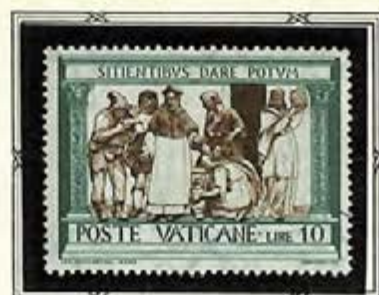
Give Drink to Thirsty