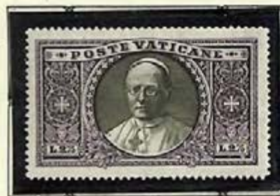
Pope Pius XI