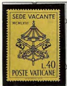
Keys of St. Peter