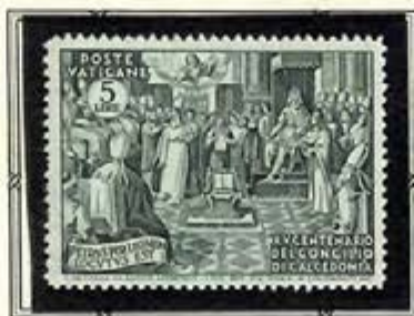
General Council in Session