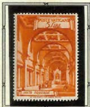
Church of St. Praxedes