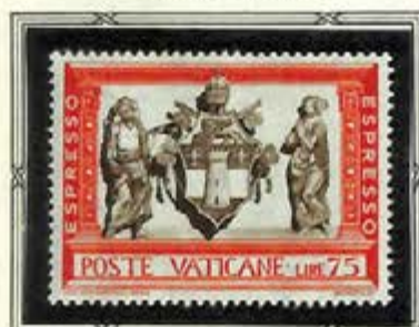
Arms of John XXIII Flanked by Hope & Justice