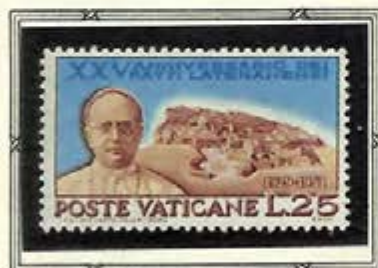
Pius XI and Vatican City

Issued to mark the seventh (7) centenary of "Quatuor libro Sententiarum", compiled by Peter Lombard, the Archbishop of Paris. The design of the stamp reproduces his Episcopal Seal which also appeared in this theological work.