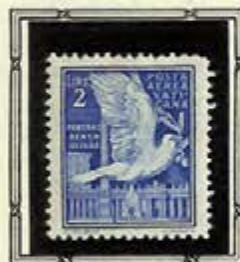
Dove of Peace