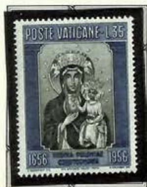
Our Lady of Czestochowa