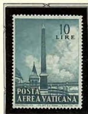
St. Mary Major Basilica