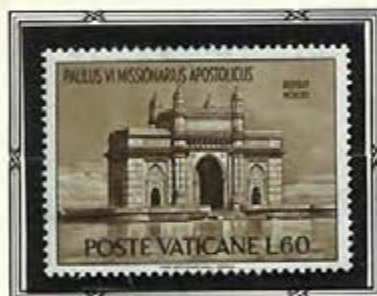
Gateway to India from Sea