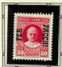
Pope Pius XI

REGULAR ISSUE OF 1929 OVERPRINTED "PER PACCHI"