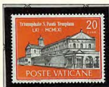
St. Paul's Basilica