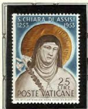
Saint Clare of Assisi

Saint Maria Goretti, Martyr of Purity, is one of the youngest saints of the Roman Catholic Church. At the age of 12, she met her death by refusing to sacrifice her chastity. This set commemorates the 50th anniversary of her martyrdom.