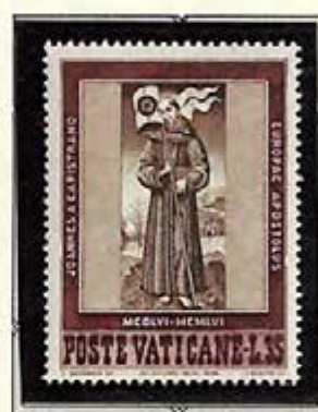
St. John of Capistrano

Saint John of Capistrano, known as the Apostle of Europe, was honored by this issue on October 30, 1956 coinciding with the fifth centenary of his death. Not only was Saint John known as a writer and religious leader, but history tells us he was a warrior as well. He preached a Crusade which he led to defeat one hundred twenty thousand Mohamedans at Belgrade in 1455.