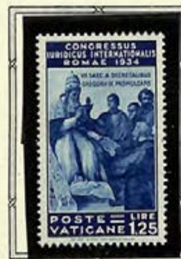
Pope Gregory IX Promulgating Decretals

This Congress of students and churchmen versed in Ancient Roman and Canon Law, assembled in Rome in 1934 to commemorate the presentation of the first codification or digest of Roman Law authorized by Emperor Justinian I and a similar presentation of canon or ecclesiastical law by Pope Gregory IX.