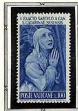
St. Catherine in Prayer