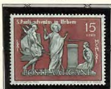
St. Paul's Arrival