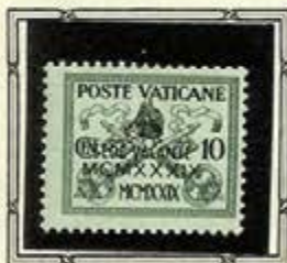
Papal Tiara and St. Peter's Keys

"Sede Vacante" indicates that the chair is vacant. During this time, Cardinals from distant countries hasten to Rome to elect a new Pope.