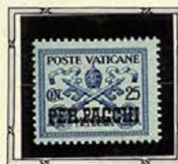
Papal Tiara and St. Peter's Keys