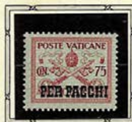
Papal Tiara and St. Peter's Keys