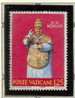
Pope John XXIII