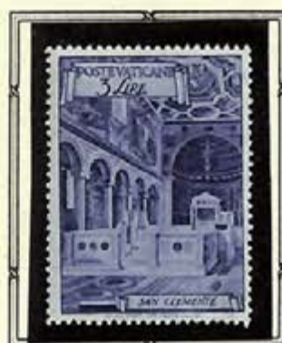
Church of St. Clement