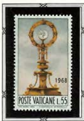
Fresco by Raphael