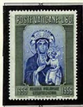
Our Lady of Czestochowa