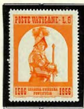
Corporal with Cuirass and Great Sword

It recalls the most gallant stand of the Corps during the Sack of Rome in 1527 when they fought a delaying action to permit Pope Clement VII to attain safety. The Guardsmen who manned the barricades did not retreat, but were slain to the last man.