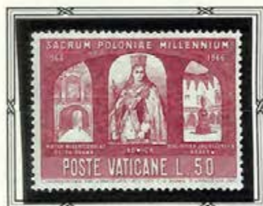
Queen Jadwiga (Hedwig), Ostra Brama Gate with Madonna, Wilno and University Library