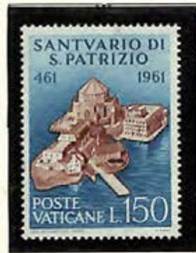
Saint Patrick Purgatory

St. Patrick's first visit to Ireland was as a captive of Irish Marauders who sold him into slavery. During his captivity he mastered the Celtic tongue and as his master was a high priest, he learned the details of Druidism. After his escape Patrick placed himself under the guidance of St. Germain, to prepare for his return to Ireland. Pope Celestine I commissioned him to bring Christianity to the Irish. He returned to Ireland in 433 to spend the remainder of his life in converting the Irish.