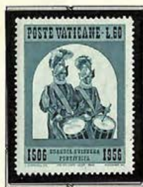
Swiss Guard Drummers