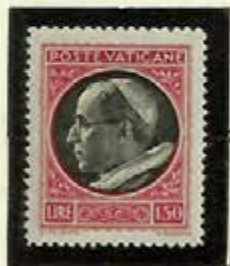
Pope Pius XII