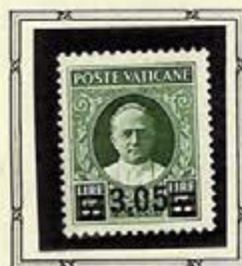
Pope Pius XI