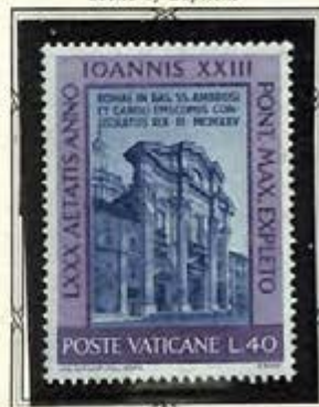
Scene of Episcopal Consecration

The religious milestones in the life of Pope John XXIII are illustrated in this series by depicting the churches in which he was Baptized, Ordained a priest, and consecrated an archbishop. The Chair of Peter in the Apse of St. Peter's Basilica, the scene of his coronation, is depicted by the date of his election as pontiff, October 28, 1958.