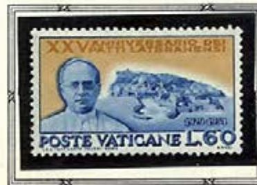
Pius XI and Vatican City

Issued to mark the 25th anniversary of the signing of the Lateran Pact that established the independent and sovereign State of Vatican City which is composed of 107.8 acres within the city of Rome.