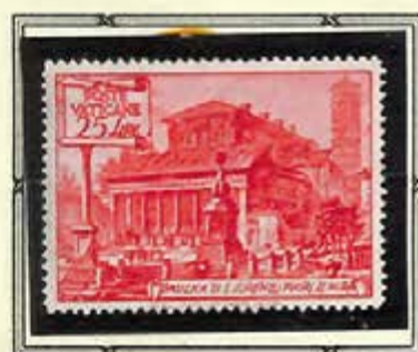
Basilica of St. Lawrence