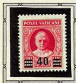
Pope Pius XI

STAMPS OF 1929 ISSUE SURCHARGED WITH NEW VALUES