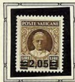
Pope Pius XI