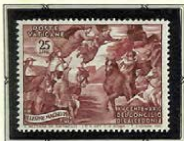
Pope Leo Meeting Attila the Hun