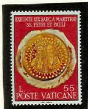
Sts. Peter & Paul

The 1900th anniversary of the martyrdom of the Apostles Peter and Paul is marked by these stamps, issued June 15, 1967. The portraits of the Saints are early mosaics in the Catacombs of Sts. Peter and Marcellinus in Rome. The gilt glass window on the L.55 value is in the Sacred Museum of the Vatican Library.