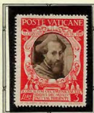
Marcellus Cardinal Cervini