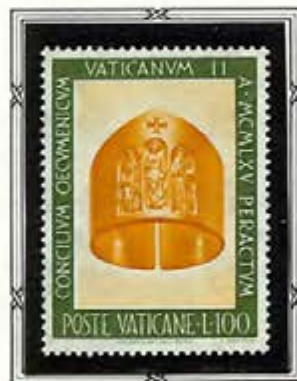
Gold Ring Given to Bishops