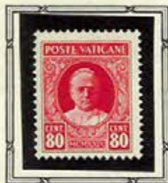
Pope Pius XI