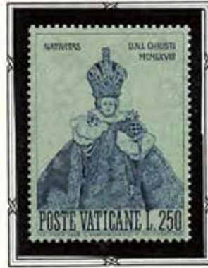
Infant of Prague