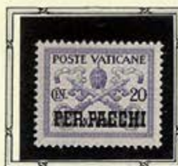
Papal Tiara and St. Peter's Keys