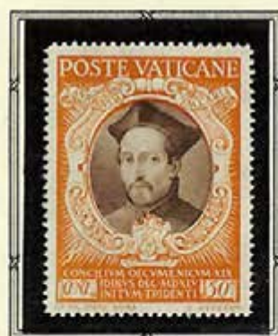
St. Anthony Maria Zaccaria