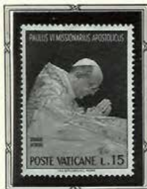
Pope Paul Praying