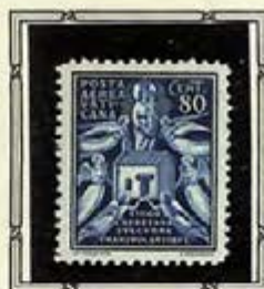
Our Lady of Loreto