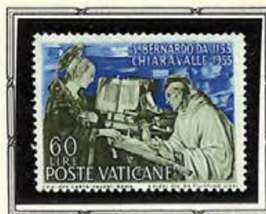
Virgin Appearing to St. Bernard

St. Bernard was one of the last Fathers and Doctor of the Church. His accomplishments included the founding of monasteries, preaching the crusade, assisting at Councils, refuting Abelard, and writing treatises and sermons. This issue marks the eighth (8) centenary of his death.