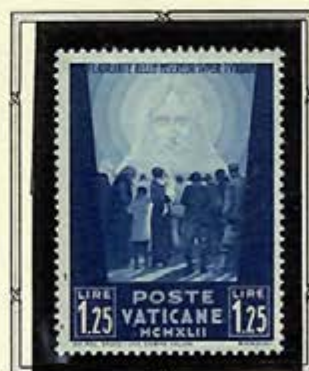
Picture of Christ

Issued to bring international attention to the efforts of the Vatican on behalf of the prisoners of World War II.