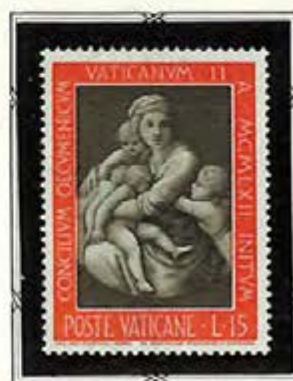
Madonna and Children