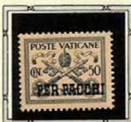
Papal Tiara and St. Peter's Keys