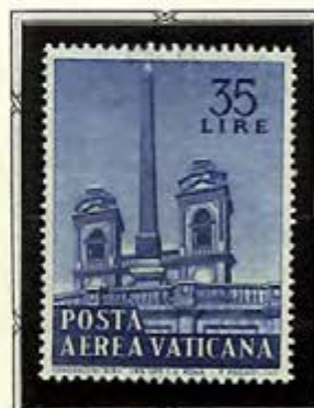
Trinita del Monti