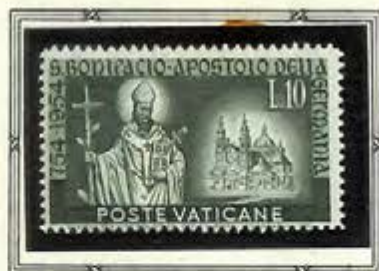
St. Boniface & Cathedral