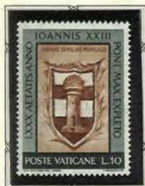
Roncalli Family Emblem