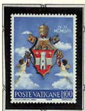
Coat-of-Arms Pope John XXIII

The four stamps marking the coronation of Pope John XXIII were issued on April 2, 1959. The 25 and 60 lire denominations show the new Pope standing attired in pontifical vestments, and wearing the triple crown, symbol of supreme authority over the Roman Catholic Church. The other two stamps in the series show the coat-of-arms of the new Pontiff in front of the symbolic crossed keys of St. Peter, surmounted by the jeweled tiaratum.