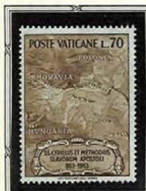
Map of Moravia, Hungary, and Poland