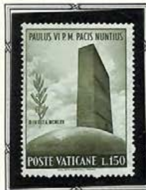
Globe & UN Building