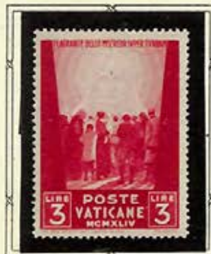
Picture of Christ