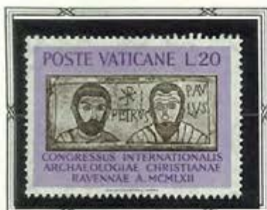
Heads of St. Peter & St. Paul