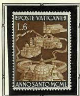
Basilicas in Rome