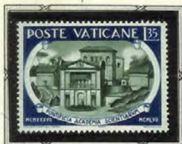
Academy of Science

The 20th anniversary of the reorganization of the Pontifical Academy of Science by Pope Pius XI was marked by the release of this set on October 9, 1957. The academy's purpose is to promote the study and progress of the mathematical, natural, and physical sciences and their history. This, the first scientific academy, dates back to 1603. Its buildings now are the former Casino of Pius IV in Vatican City.