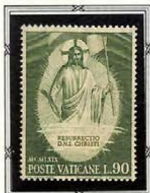
The Resurrection by Fra Angelico