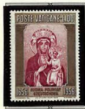
Our Lady of Czestochowa

In 1656, King John Casimiro proclaimed Our Lady of Czestochowa as Queen of Poland. This issue marks the 300th anniversary of the proclamation and depicts the famed painting, attributed to St. Luke, with the ornate plate of precious metals and jewels superimposed on the original painting.