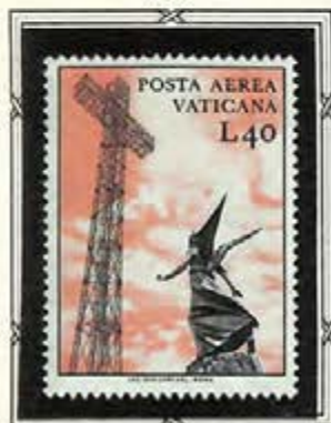
Radio Antenna & St. Gabriel