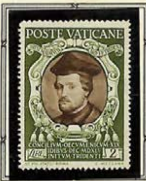
Christopher Cardinal Madruzzo

The Council of Trent was originally convoked June 2, 1536 by Pope Paul III to be held at Mantua in 1537, but because of various difficulties and oppositions did not open until 1545 and then only by pressure of Pope Paul.