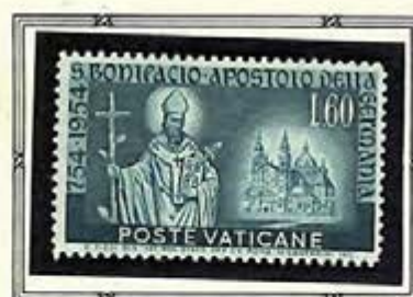
St. Boniface & Cathedral

Issued to mark the 12th centenary of the martyrdom of St. Boniface on June 5, 754, at Dokkum, the Netherlands. Saint Boniface, the German Apostle, is buried in the crypt of the Cathedral of the Holy Redeemer at Fulda which is pictured on the stamp.