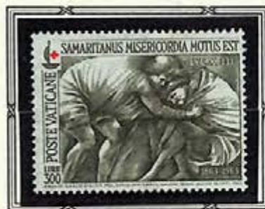
Good Samaritan Tending Wayfarer

This series of three stamps commemorating the Red Cross Centenary was placed on sale September 22nd. The design shows the good Samaritan tending the wayfarer. The inscription at the top of the stamp reads, "Samaritanus Misericordia Motus Est" (The Samaritan was moved to mercy) and the small inscription just below ("Luc. X. 33") identifies the Biblical text.