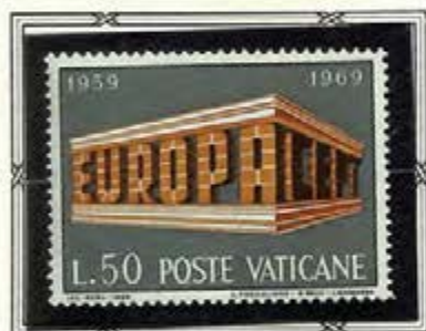
EUROPA and CEPT