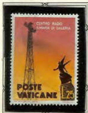
Aerial and Statue

The design for this stamp, though of a common nature, does convey the purpose of Vatican Radio. . . to broadcast the teachings of God as symbolized by the cross-shaped aerial. A statue of Archangel Gabriel, patron of communications, appears on the grounds of the new radio station which is located at Sant Maria di Galeria, just outside the city of Rome.