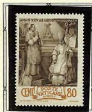
Consecration of Archbishop Pacelli by Pope Benedict XV