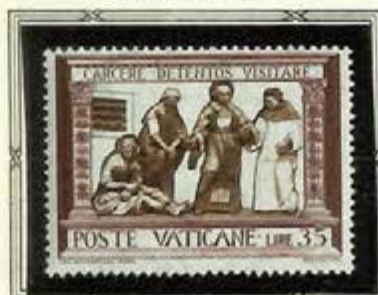
Ransom the Captive