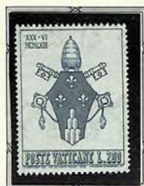
Coat of Arms