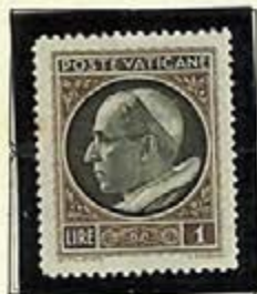
Pope Pius XII