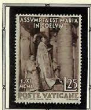
Pope Pius XII