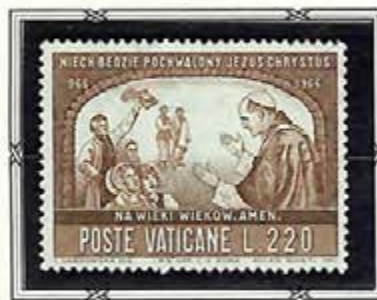
Pope Paul VI Blessing Students and Farmers

Poland in 1966 celebrated a joint anniversary, the 1000th anniversary of the Christianization of the country and the millennium of nationhood. This set, released May 3, 1966, commemorates the former event and features rulers and religious leaders of Poland. The L.220 value bears the traditional greeting of the Polish people: "Praised Be Jesus Christ." At the bottom is the response: "For ever and ever, Amen."