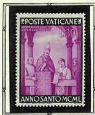
Pope Boniface VIII