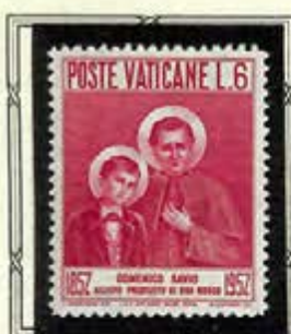
St. Savio & St. Bosco