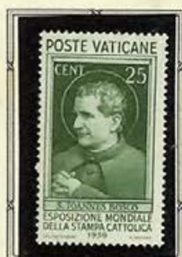
St. John Bosco