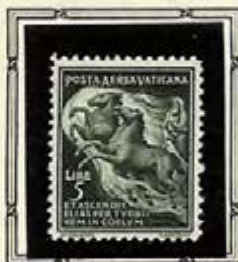
Elijah's Ascent into Heaven