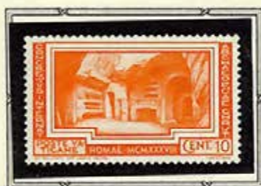
Crypt of St. Cecilia