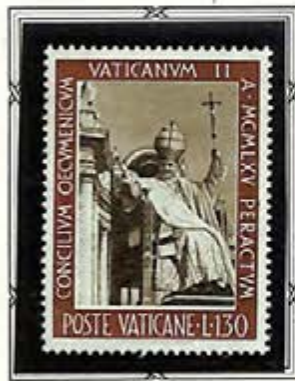
Pope Paul Dismissing the Council

This six-value set — issued October 11, 1966 — marks the fourth anniversary of the opening of Vatican II, the historic Ecumenical Council. Similar in format to the set released to mark the Council's opening, these adhesives depict actual events or objects associated with the Council. The border legend says: "Vatican Second Ecumenical Council Finishing in 1965."