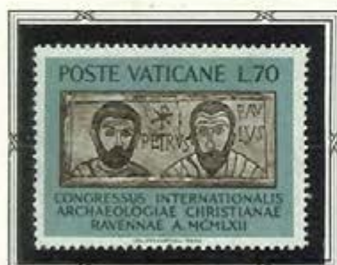
Heads of St. Peter & St. Paul

The 6th Congress of Christian Archaeology was held at Ravenna, Italy, from September 23 to 28 and was marked by this Vatican set issued September 25th. The Congress is the sixth in a series which was initiated at Spoleto in 1894. Fifteen nations were represented.