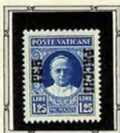
Pope Pius XI