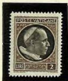
Pope Pius XII