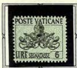
Papal Tiara and Crossed Keys