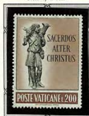
Statue: "The Good Shepherd"