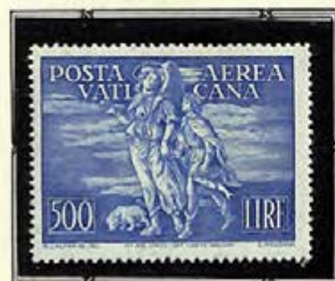
Younger Tobias and Heavenly Guide