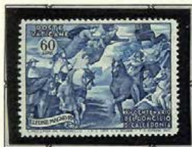
Pope Leo Meeting Attila the Hun