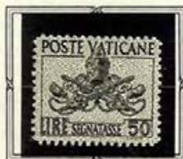
Papal Tiara and Crossed Keys