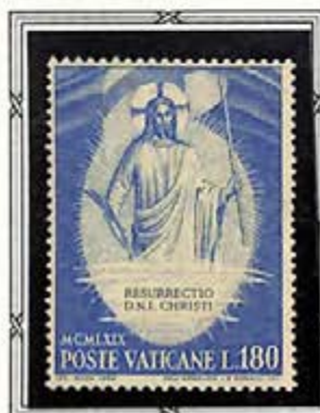
The Resurrection by Fra Angelico

This issue, released March 6, 1969, commemorates Easter 1969. The design features "The Resurrection of Our Lord Jesus Christ" painted by Fra Angelico. Christians believe that Christ was the Son of God become man, and that He was put to death in His human nature on Good Friday by crucifixion and rose from the dead to life on Easter Sunday.