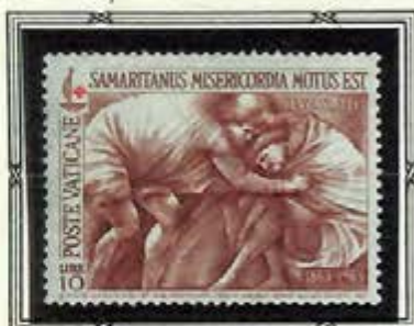
Good Samaritan Tending Wayfarer