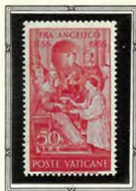
St. Lawrence & Pope Sixtus II