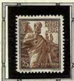
Statue of St. Peter