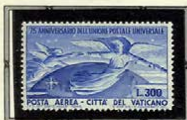
Angels with Clasped Hands