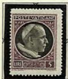
Pope Pius XII