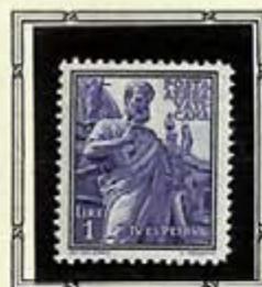
Statue of St. Peter