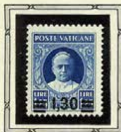
Pope Pius XI