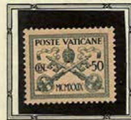
Papal Tiara and St. Peter's Keys