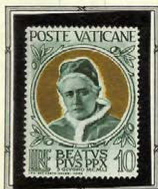
Pope Pius X