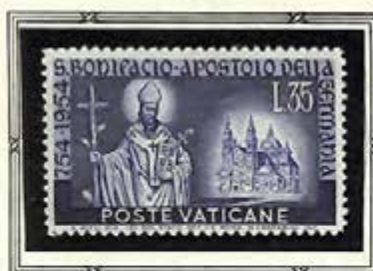
St. Boniface & Cathedral