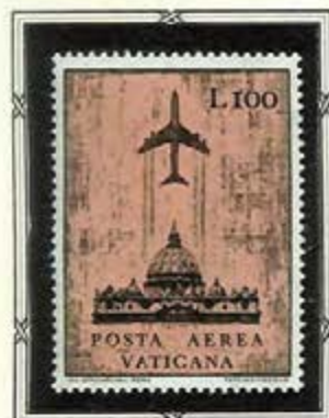
St. Peter's Basilica & Jet