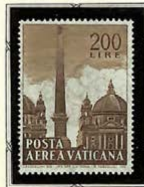
Piazza del Popolo