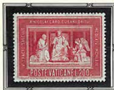
Cardinal Cusano's Sepulchre