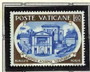
Academy of Science

The 20th anniversary of the reorganization of the Pontifical Academy of Science by Pope Pius XI was marked by the release of this set on October 9, 1957. The academy's purpose is to promote the study and progress of the mathematical, natural, and physical sciences and their history. This, the first scientific academy, dates back to 1603. Its buildings now are the former Casino of Pius IV in Vatican City.