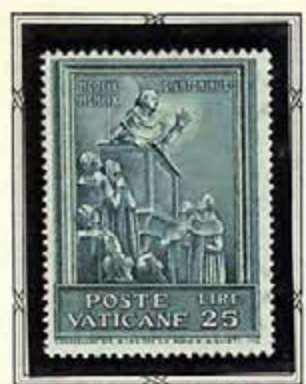
St. Antoninus Preaching

This set commemorates the 5th centenary of the death of St. Antoninus, Archbishop of Florence (1389-1459). He was a prelate of the poor and oppressed and gained fame as a moral theologian and writer of local and international law.