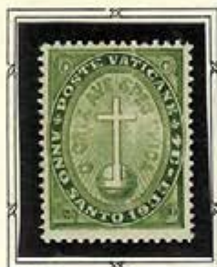
Cross with Orb