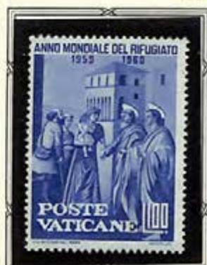
St. Peter Giving Alms