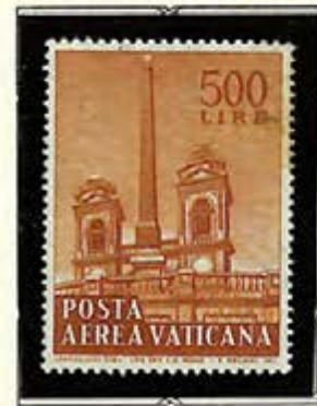
Trinita del Monti

This set of ten air mail stamps was released on October 27, 1959. The designs depict obelisks which rise in front of famous basilicas of Greater Rome. Of particular interest is the fact that the 15L, and 100L, depict the obelisk of St. Peter's with the Apostolic Palace in the background as it appears late at night. The ray of light from the window of the Palace is the location of the Papal Apartment where Pope Pius XII worked until the early hours of the morning. A solemn memorial stamp to a great Pope.