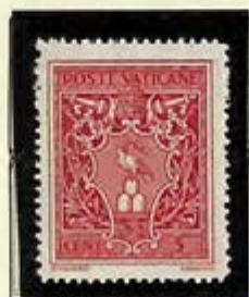
Arms of Pope Pius XII