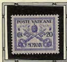
Papal Tiara and St. Peter's Keys