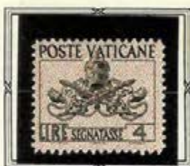
Papal Tiara and Crossed Keys