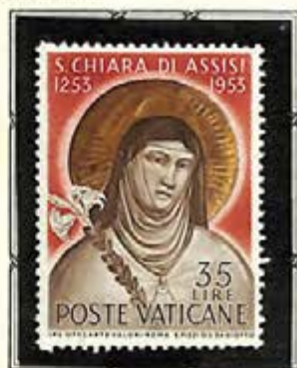
Saint Clare of Assisi

Born of a noble family of Assisi, in 1212, Saint Clare founded the order of Franciscan nuns, which spread rapidly through Europe. She guided the work of the order until her death in 1253. Two years after her death she was canonized by Alexander IV. Her festival falls on August 12th.