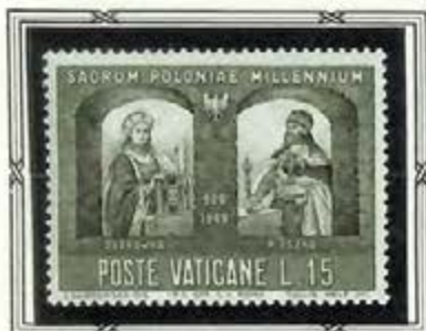
King Mieszko I and Queen Dabrowka