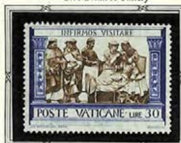
Visit the Sick