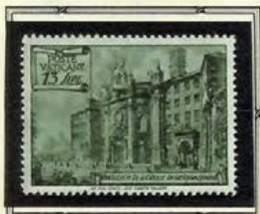
Basilica of the Holy Cross of Jerusalem