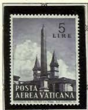
St. John Lateran Basilica