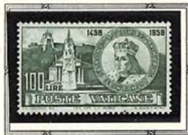
Head of St. Casimir

Saint Casimir, patron saint of Lithuania and Poland, is often referred to as the King of Poland and Hungary though he never occupied the throne of either country. In 1471 he was sent by his father, King Casimir IV of Poland, to seize the crown of Hungary when he was but 15 years of age. He withdrew his troops without fighting and as a punishment his father had him imprisoned for three months. Upon release, he spent the rest of his short life in study and religious undertakings. He passed away in 1484 and was buried in Vilna in the Church of St. Stanislaus.