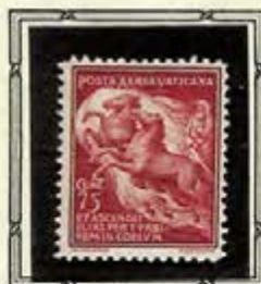
Elijah's Ascent into Heaven