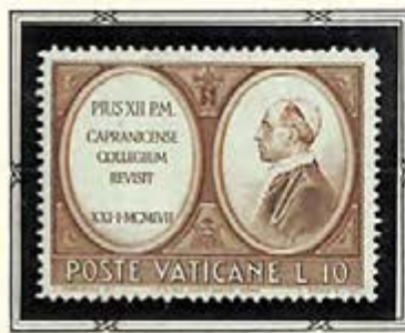
Pius XII & Plaque

The fifth centenary of the Capranica College was marked by this set issued on June 27, 1957. This, the oldest college in Rome, was founded by Cardinal Domenico Capranica in his own palace. Its constitutions, drawn up by the Cardinal, are regarded as a model of their kind. Two years after his death a special building for the college was erected by his brother, also a cardinal.