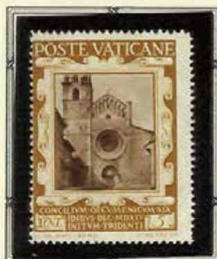
St. Maria Maggiore Church