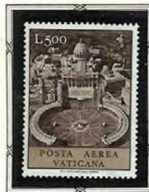
St. Peter's Square

These six airmails, featuring views of the Vatican, were issued on March 7, 1967. The design of the L.40 and L.200 values was originally used for the two stamps issued in 1959 to mark the second anniversary of the Vatican radio station, St. Maria di Galeria, twelve miles outside of Rome. The stamps have a crossed keys watermark.