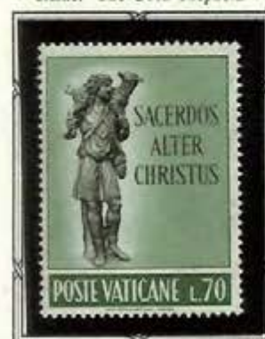
Statue: "The Good Shepherd"