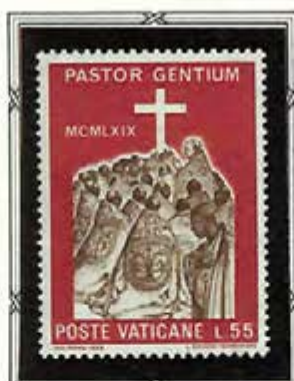
Pope Paul VI and African Bishops