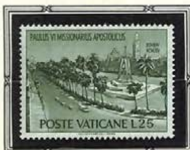
View of Bombay