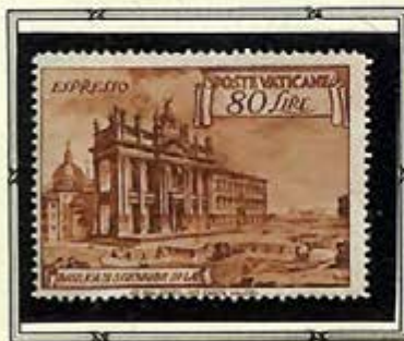
Basilica of St. John Lateran