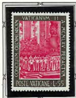
Assembly of Bishops for Mass