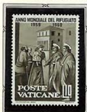
St. Peter Giving Alms