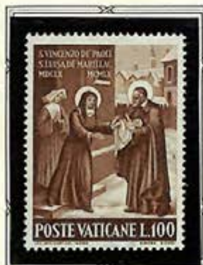
St. Vincent with Child

St. Louisa De Marillac was St. Vincent De Paul's right hand in founding the Sisters of Charity subsequently called the Sisters of Charity of St. Vincent De Paul. The unbounded Love of St. Vincent for the poor and unfortunate lead to the founding of the Vincentians. He is revered as the patron saint of all charitable societies.