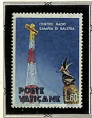
Aerial and Statue