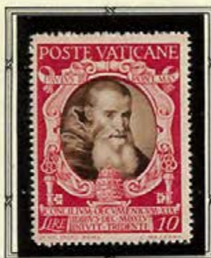
Pope Paul III