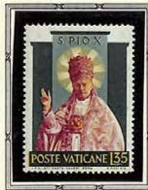
Saint Pius X

Issued on May 29, 1954, this series was released to mark the canonization of Pope Pius X, the 4374th Saint of the Catholic Church.