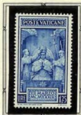
Coronation of Pope Pius XII

The occasion of the coronation of the Pope is a great day in Rome and for the Church. It is the culmination of centuries of tradition and is not an ordinary occurrence. On this day, March 12, 1939, the tiara or triple crown was placed on the head of Cardinal Pacelli, newly elected Pope Pius XII. The blowing of silver trumpets from the Dome of St. Peter's announces the beginning of the ceremonies. At the coronation of Pope Pius XII, eighty-five thousand people were crowded into St. Peter's with another half million outside to watch this five hour procession. It was the first coronation to be held outside the Basilica in 93 years.