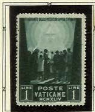
Picture of Christ