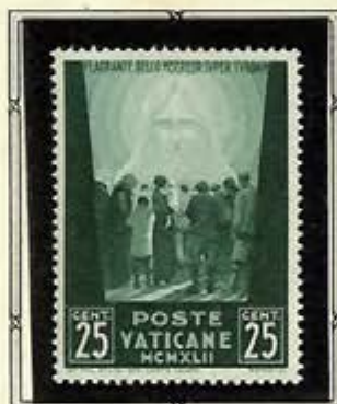
Picture of Christ