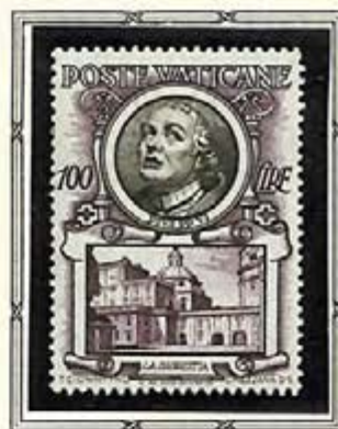
Pope Pius VI

This set of regular postage stamps has the history of Saint Peter's Basilica as its theme. Each stamp depicts a Pope along with his contribution to the basilica's embellishment. The basilica was erected over the tomb of St. Peter, the first pope, and is the largest church in the world today.