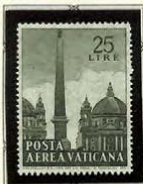
Piazza del Popolo