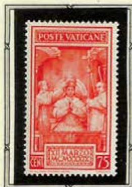
Coronation of Pope Pius XII