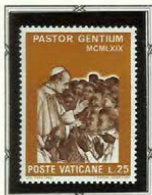
Pope Paul VI and African Children