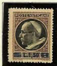
Pope Pius XII