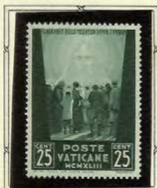
Picture of Christ