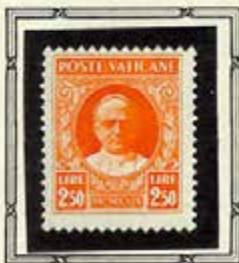
Pope Pius XI

He installed the first modern communications, such as, telephone and radio in the Vatican. A great humanitarian, he issued many encyclicals on social and religious relations. His crowning achievement was the signing of the Lateran Pacts with Italy, establishing Vatican City as an independent State.