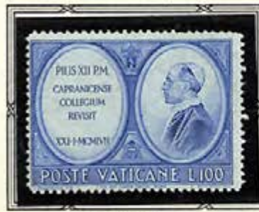
Pius XII & Plaque