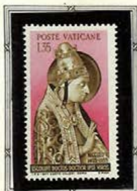
Pope Nicholas V