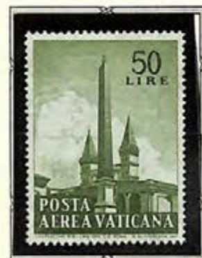
St. John Lateran Basilica