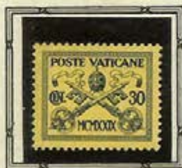
Papal Tiara and St. Peter's Keys

Its origin is lost in the veil of antiquity. Its evolution from one crown to its present three with gold cross is clothed in the venerable traditions of the Popes. The Crossed Keys is the insignia of authority of the Pope as successor to St. Peter, who as an Apostle of Christ received the original authority as the Bishop or Vicar of Rome.