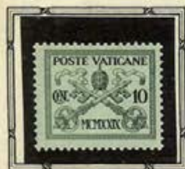
Papal Tiara and St. Peter's Keys