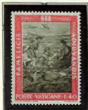
Miracle of Loaves & Fishes