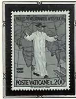
Pope Paul & Map of India

This set commemorates the visit of Pope Paul VI to India and to the 38th International Eucharistic Congress in Bombay. Each stamp is inscribed, "Paulus VI Missionarius Apostolicus" (Pope Paul VI Apostolic Missionary).