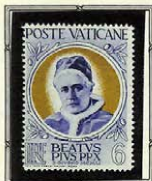
Pope Pius X