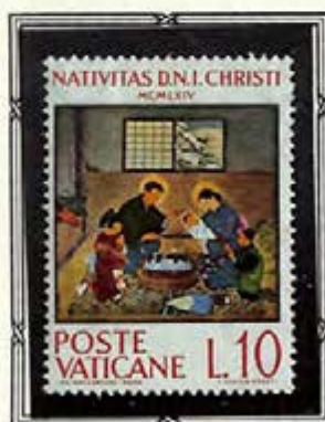
Nativity Scene — Japanese Style

The 1964 Christmas set . . . in three denominations . . . shows a Nativity scene, Japanese style. The stamp design is after a painting by T. Kimiko Koseki.