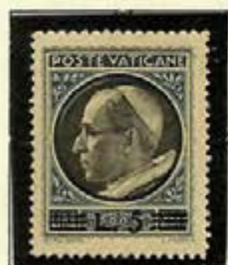
Pope Pius XII