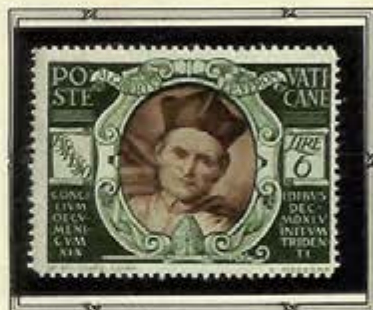
Gian Matteo Giberti