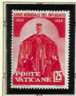
Madonna of Mercy