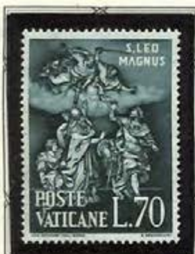
Pope Leo meets Attila