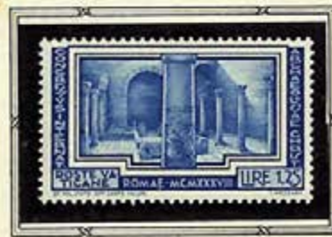
Basilica of St. Petronilla

Picturing the Crypts and Basilica in the Catacombs of Domitilla, this group of stamps commemorates the International Archeological Congress held in Rome in 1938. Attending were students and scholars interested in the catacombs and restorations.