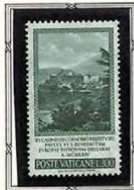
View of Monte Cassino

Issued to commemorate the conferring of the title Patron Saint of Europe upon Saint Benedict by Pope Paul VI, and to commemorate the restoration of the Abbey of Monte Cassino where he died in 543.