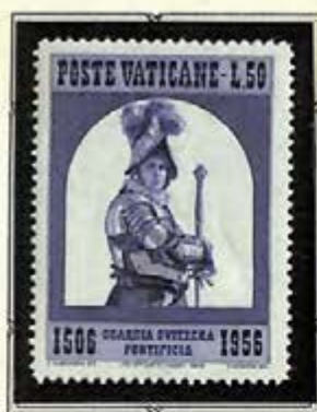
Corporal with Cuirass and Great Sword