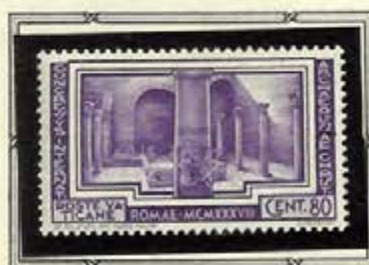
Basilica of St. Petronilla

Picturing the Crypts and Basilica in the Catacombs of Domitilla, this group of stamps commemorates the International Archeological Congress held in Rome in 1938. Attending were students and scholars interested in the catacombs and restorations.