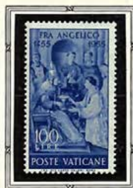
St. Lawrence & Pope Sixtus II

To mark the fifth centenary of the death of the famous Dominican painter, Fra Angelico, this set of two stamps was released on June 27, 1955. The design is taken from one of his paintings in the Chapel of Pope Nicholas V, located in the Vatican Museums.