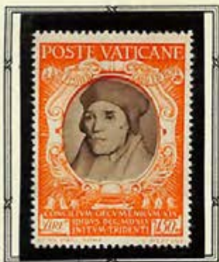
St. John Baptist Cardinal Fisher