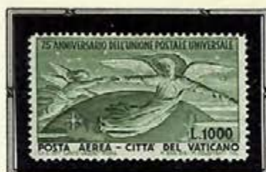
Angels with Clasped Hands

Angels with clasped hands in flight around the earth symbolize the Universal Postal Union on its 75th Anniversary. The illustration was designed by Nello Ena and the engraving prepared by M. Colombati. These much needed high value air post stamps were released on December 3, 1949.