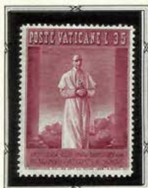
Pope Pius XII