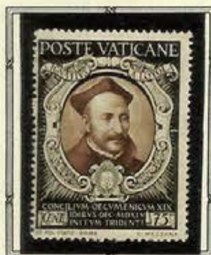
St. Ignatius of Loyola