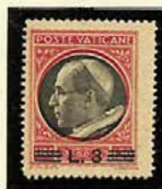
Pope Pius XII