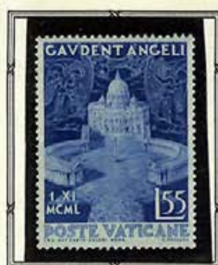
St. Peter's Square

This set of two stamps was issued on May 8, 1951 and commemorates the Enunciation of the Dogma of the Assumption of the Blessed Virgin made the later part of 1950. The 25 lire value shows Pope Pius XII proclaiming the Dogma from the Balcony of St. Peter's Church. Cardinals Canali and Mercati appear in the background. The 55 lire pictures St. Peter's Square thronged with Holy Year pilgrims applauding the proclamation of the Dogma by the Supreme Pontiff.