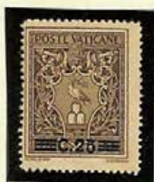
Arms of Pope Pius XII