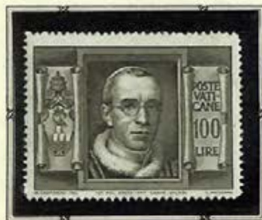
Pope Pius XII