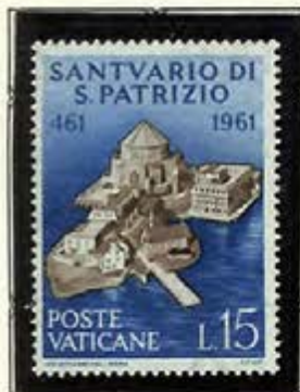
Saint Patrick's Purgatory