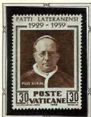
Pope Pius XI