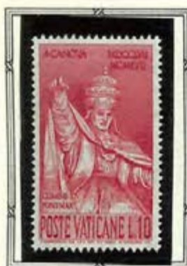
Pope Clement XIV