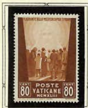
Picture of Christ