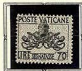
Papal Tiara and Crossed Keys