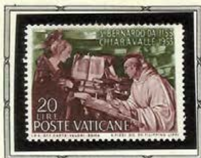
Virgin Appearing to St. Bernard