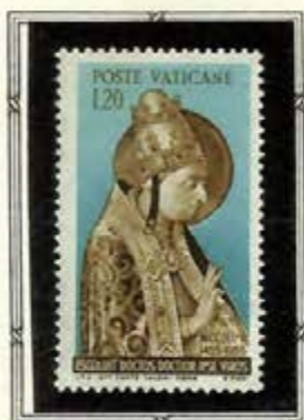
Pope Nicholas V