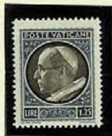
Pope Pius XII