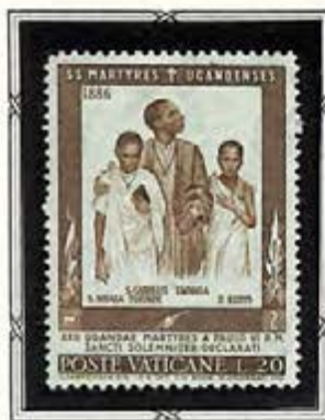
Martyrs of Uganda