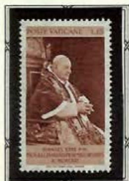
Pope John XXIII

Issued to publicize the "Freedom from Hunger" campaign of the UN's Food and Agriculture Organization. Postal administrations throughout the world released similar stamps; some of the funds from their sale went to the FAO.