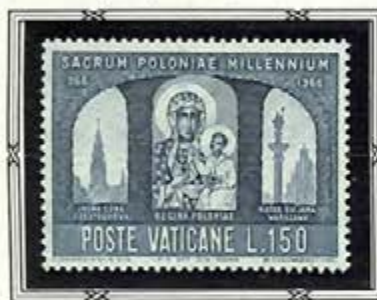
Black Madonna, Jaina Gora Monastery and St. John's Cathedral