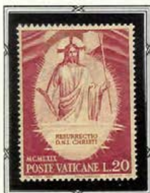
The Resurrection by Fra Angelico