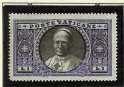
Pope Pius XI