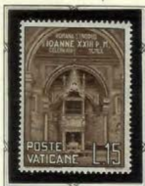
Transept of St. John Lateran