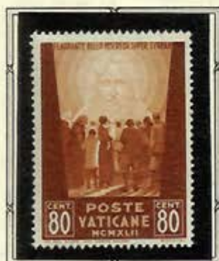
Picture of Christ