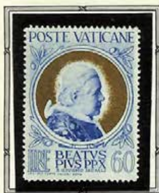
Pope Pius X