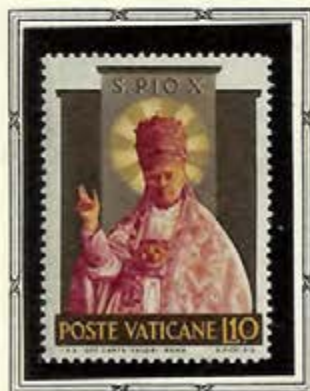
Saint Pius X