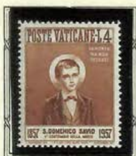
St. Dominic Savio