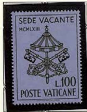
Keys of St. Peter

This traditional "Sede Vacante" ("Vacant Seat") set was issued June 15, 1963, twelve days after the death of Pope John XXIII. The design is similar to that used in 1958 when Pope Pius XII died. Pope John reigned 4 1/2 years.