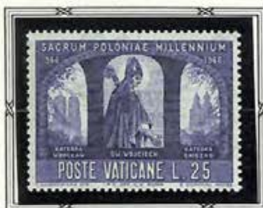
St. Adalbert (Wojciech) and Cathedrals of Wroclaw and Gniezno