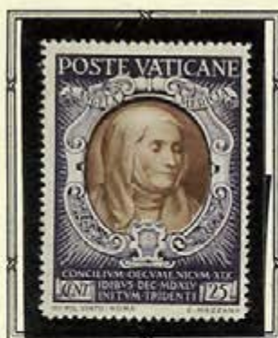
St. Angela Mericia