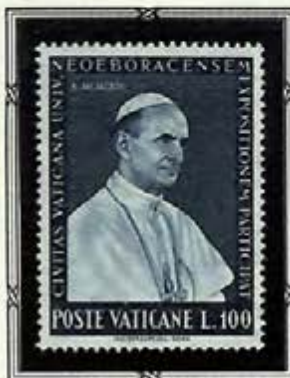
Pope Paul VI