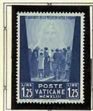
Picture of Christ