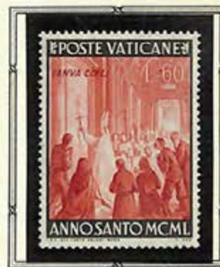
Pope Tapping Holy Door

Issued on December 21, 1949, this set commemorates the Holy Year which opened officially on the following December 24th. Four designs were used. The 5L and 20L represent Christ giving the keys, symbolical of papal primacy and temporal and spiritual power, to St. Peter, the first pope. This design is the central section of a mural painting in the Sistine Chapel of the Vatican, painted by Pietro Vannucci, usually known as Perugino (1445-1523). The 5L and 25L values show the four major basilicas of Rome to be visited for gaining the Holy Year Indulgence, - St. Peter, St. Mary Major, St. John Lateran, and St. Paul. Although the design has a medieval flavor, it is likely of recent origin. The 8L and 30L values bear a fresco found in St. John Lateran, attributed to Giotto (1276-1337), representing Pope Boniface VIII proclaiming the first Jubilee Year in 1300 A.D. The year 1950 is the 25th regular Jubilee Holy Year, the intervals having been shortened gradually to 25 years. The 10L and 60L stamps show the Pope tapping the Holy Door with a silver hammer, the opening of which indicates the beginning of the Jubilee Holy Year.