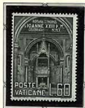
Transept of St. John Lateran

The Roman Synod was convened by Pope John XXIII to institute reforms within the Dioceses of Rome. Its decisions which went into effect November 1, 1960, primarily concerned administrative reforms and discipline of the clergy.