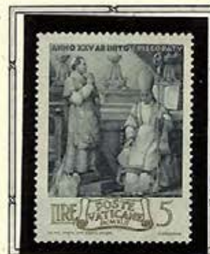
Consecration of Archbishop Pacelli by Pope Benedict XV

Commemorating the twenty-fifth anniversary of the consecration of Archbishop Pacelli, who was to become Pope Pius XII: by Pope Benedict XV.