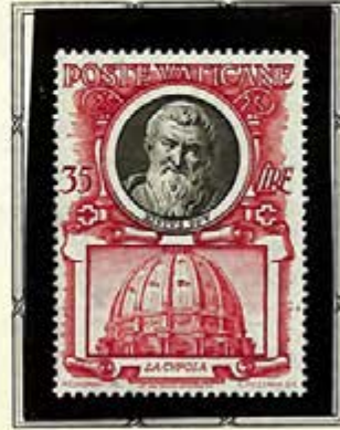
Pope Sixtus V