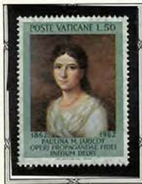
Paulina M. Jaricot