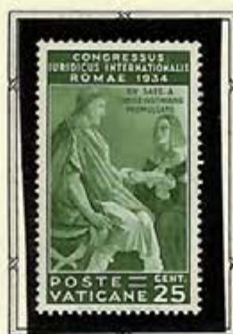
Tribonian Presenting Pandects to Justinian I