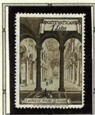
Church of St. Agnes