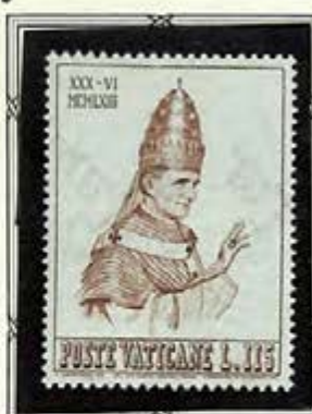
Pope Paul VI