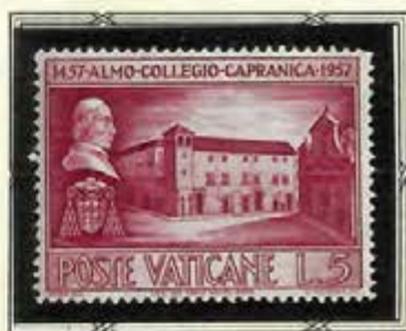
Cardinal Capranica & College