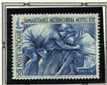
Good Samaritan Tending Wayfarer