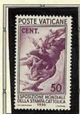
Bell and Doves