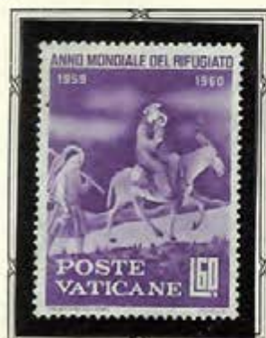
Flight into Egypt