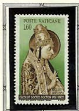
Pope Nicholas V

This set commemorates the fifth century of the death of Pope Nicholas V. His most outstanding achievements were the centralization of the Church government at the Vatican, patron of the arts, and his planning of the Vatican which earned him the title of, "The Father of the Modern Vatican."