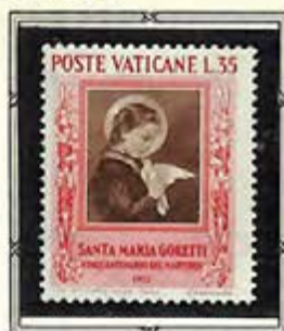
Saint Maria Goretti

Saint Maria Goretti, Martyr of Purity, is one of the youngest saints of the Roman Catholic Church. At the age of 12, she met her death by refusing to sacrifice her chastity. This set commemorates the 50th anniversary of her martyrdom.