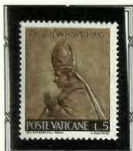
Pope Paul VI