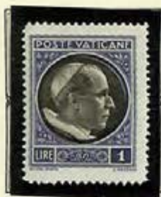
Pope Pius XII