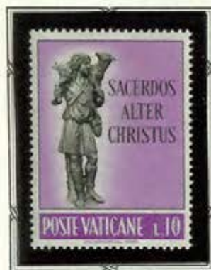
Statue: "The Good Shepherd"

This set was released following the first International Congress on Priestly Vocations at the Vatican. Its purpose was to stimulate interest in vocations to the priesthood and the religious life.