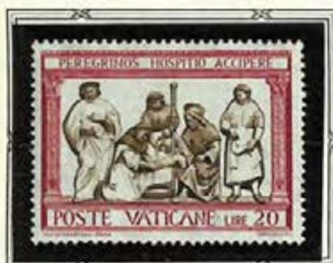
Shelter the Homeless