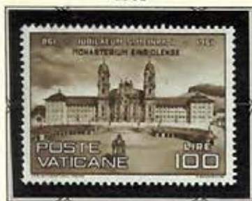
Monastery at Einsiedeln