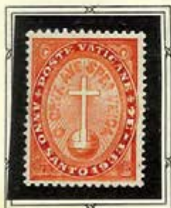
Cross with Orb