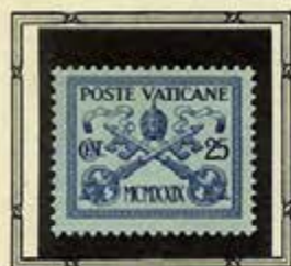
Papal Tiara and St. Peter's Keys

The Papal Tiara or triple crown used at Coronations is generally believed to symbolize the sovereign authority of the Pope over the three churches — militant, suffering and triumphant or that the Pope is lawgiver, judge and teacher.