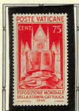
Church and Bible