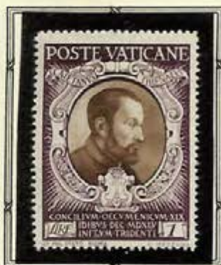
St. Cajetan of Thiene