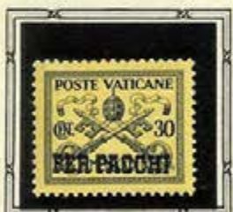
Papal Tiara and St. Peter's Keys