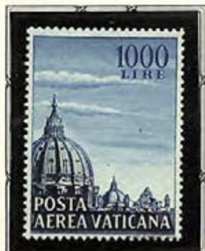
Saint Peter's Dome

This new airmail set depicts the roof and dome of St. Peter's Basilica. The dome was designed by Michelangelo and erected at a cost of over 200,000 gold scudi. It is a familiar sight to visitors at the Vatican.