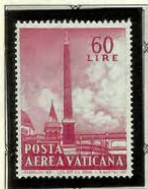
St. Mary Major Basilica