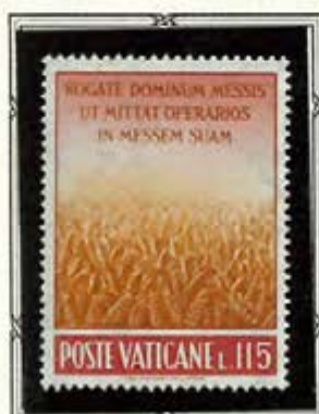
Field of Wheat