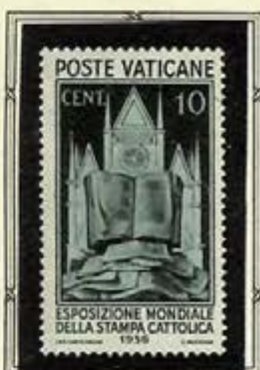
Church and Bible