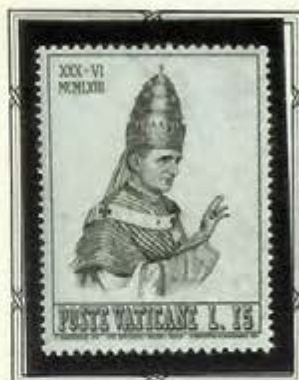
Pope Paul VI