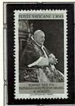
Pope John XXIII

Shortly before his death Pope John XXIII was awarded the 1963 Balzan Peace Prize; this pair marks the event. The money was dedicated by the Holy Father to "a perpetual fund in favor of peace," an amount of about $260,000.