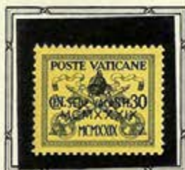
Papal Tiara and St. Peter's Keys