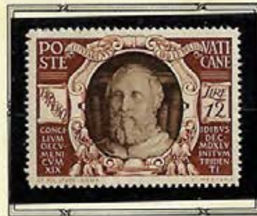
Caspar Cardinal Contarini

In effect, the Canons of Trent are the doctrines and citadel of Rome as it exists today. Also, they resulted in a complete break from Protestant opinions forever and further re-established the hierarchy of the Church and resulted in greater strength for the Pope, though the original intentions were to circumscribe his powers.