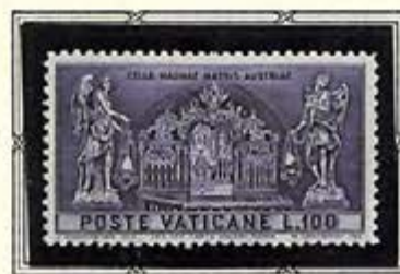
Altar & Miraculous Statue

Another set in a series to honor famous Marian Shrines throughout the world was released on November 14, 1957, to mark the eighth centenary of the Mariazell Shrine in Austria. Mariazell is the most famous Marian Shrine in Central Europe. A miraculous statue of the Madonna and Child is enshrined in the basilica. The statue is a 22 inch carving in Linden wood which in spite of its 800 years shows no sign of decay.