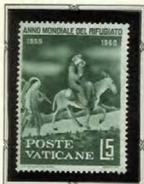
Flight into Egypt