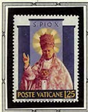
Saint Pius X