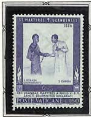
Martyrs of Uganda