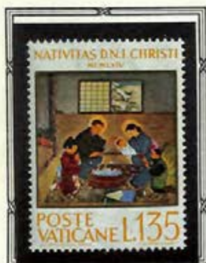
Nativity Scene — Japanese Style