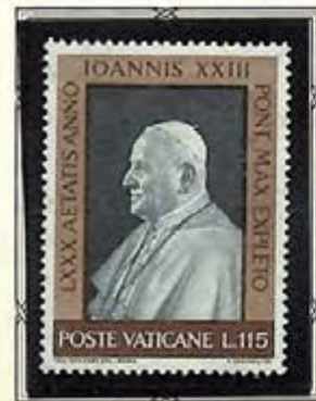
Pope John XXIII