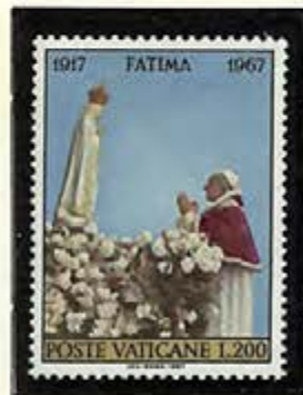
Pope Paul at Shrine

Here he met the surviving member of the three children who had the visions of the Virgin in 1917. The stamps came out on October 13, 1967.