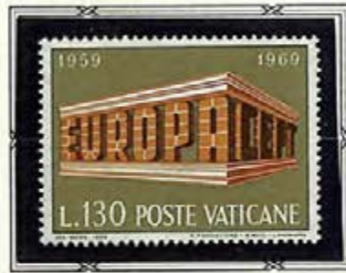
EUROPA and CEPT

The Vatican issued its first EUROPA stamps on April 28, 1969 in commemoration of the tenth anniversary of the founding of CEPT . . . Conference on European Posts and Telecommunications.