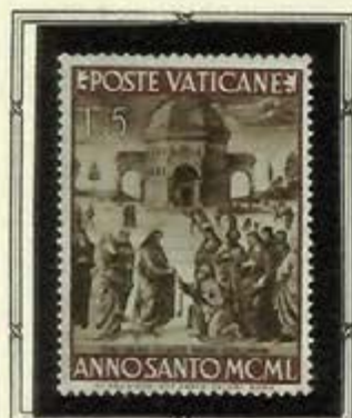
Christ Giving Keys