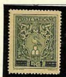
Arms of Pope Pius XII