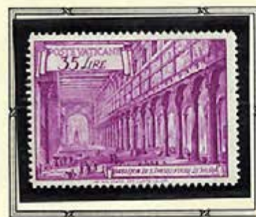
Basilica of St. Paul