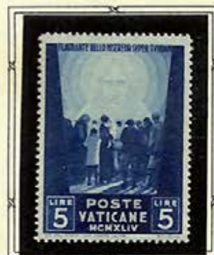
Picture of Christ