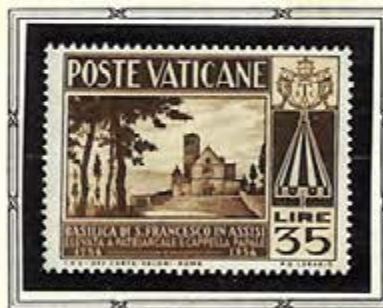
Saint Francis Basilica

Issued to commemorate the 200th anniversary of the elevation of the Basilica of St. Francis at Assisi to the rank of Patriarchal Basilica by Pope Benedict XIV on March 23, 1754.