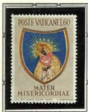
Madonna of the Spiked Gate