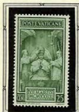
Coronation of Pope Pius XII