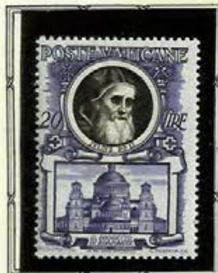
Pope Julius II