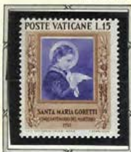
Saint Maria Goretti