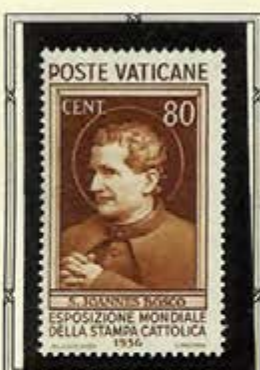
St. John Bosco