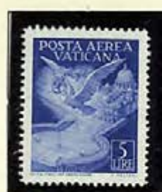
Dove of Peace over St. Peter's House of Our Lady of Loreto Dove of Peace over St. Peter's