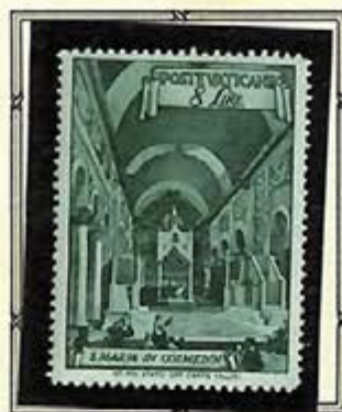
Church of St. Mary in Cosmedin