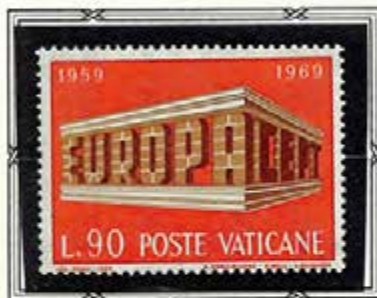
EUROPA and CEPT