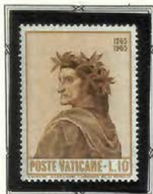
Dante by Raphael