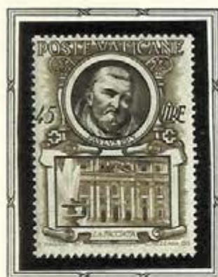
Pope Paul V