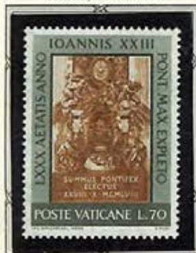
Scene of Coronation