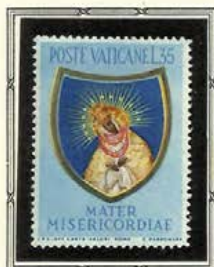
Madonna of the Spiked Gate