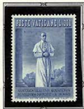
Pope Pius XII

This issue commemorates the Vatican participation in the Brussels International Exposition at Brussels, Belgium. The Vatican pavilion, "Civitas Dei" (City of God) consisted of three segments: a church, public hall and a dining area. It marked the first time that the Holy See participated in a non-religious affair of this nature.