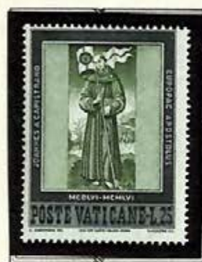
St. John of Capistrano