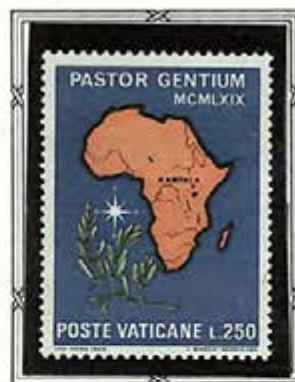
Map of Africa with Kampala, Olive Branch and Compass Rose

Issued to commemorate Pope Paul's historic visit to Africa July 31 to August 2. His visit to African bishops and African leaders was in quest for peace... especially in connection with the Nigeria-Biafra conflict.