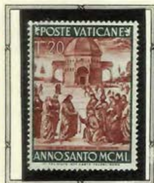
Christ Giving Keys