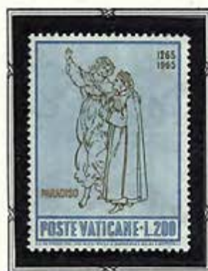
Dante & Beatrice in Paradise

Dante Alighieri is honored by this set marking the 700th anniversary of his birth. Raphael's portrait of Dante, from the Disputa fresco in the Vatican Library, provides the design for the 10-lire denomination. The other three denominations show Botticelli drawings of the Inferno, Purgatory and Paradise.