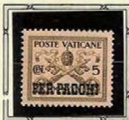
Papal Tiara and St. Peter's Keys

REGULAR ISSUE OF 1929 OVERPRINTED "PER PACCHI"