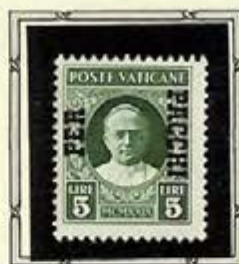
Pope Pius XI