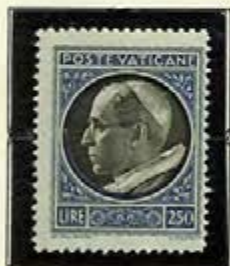
Pope Pius XII