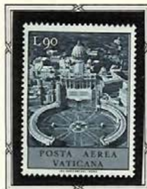
St. Peter's Square