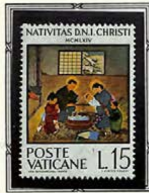
Nativity Scene — Japanese Style

The 1964 Christmas set . . . in three denominations . . . shows a Nativity scene, Japanese style. The stamp design is after a painting by T. Kimiko Koseki.