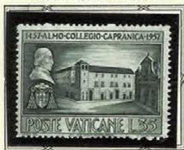
Cardinal Capranica & College

The fifth centenary of the Capranica College was marked by this set issued on June 27, 1957. This, the oldest college in Rome, was founded by Cardinal Domenico Capranica in his own palace. Its constitutions, drawn up by the Cardinal, are regarded as a model of their kind. Two years after his death a special building for the college was erected by his brother, also a cardinal.