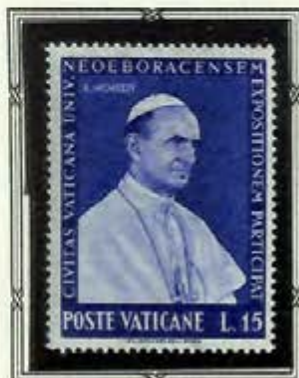
Pope Paul VI