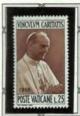
Pope Paul VI