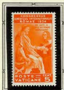
Tribonian Presenting Pandects to Justinian I