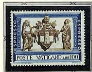
Arms of John XXIII Flanked by Hope & Justice

Released during the WRY, this set publicizes the various needs of the refugees. The famous ceramics of Giovanni della Robbia were used to portray the seven works of mercy and allegories of the remaining three values. These works are in the Civil Hospital at Pistoia, Italy.