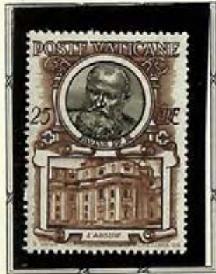
Pope Paul III