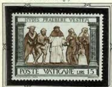
Clothe the Naked