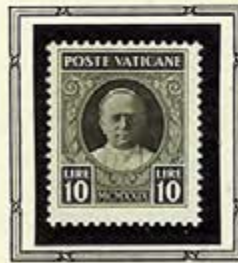
Pope Pius XI