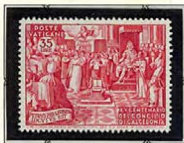
General Council in Session