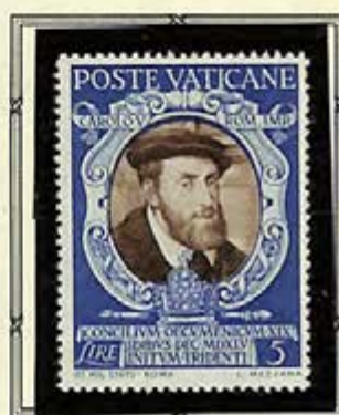
Emperor Charles V