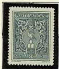
Arms of Pope Pius XII