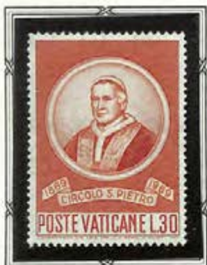
Pope Pius IX