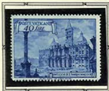
Basilica of St. Mary Major