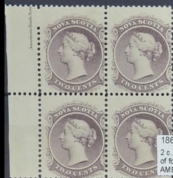
1860-63, SG. 11 2 c., grey purple, yellowish paper, block of four from the left margin with imprint AMERICAN BANK NOTE (Co. NEW