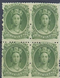
1860-63, SG. 15 8 1/2 c., yellow-green, block of (4), perf. 12, yellowish paper, MNH/MH, very