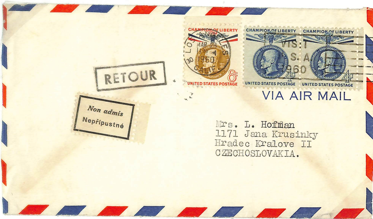
Single weight, 1-cent overpaid. 8c Masaryk 4c (2) + 8c

Czechoslovakia refused all mail bearing the Masaryk commemoratives. Such mail was returned to sender RETOUR with a bilingual Non-Admissable label.