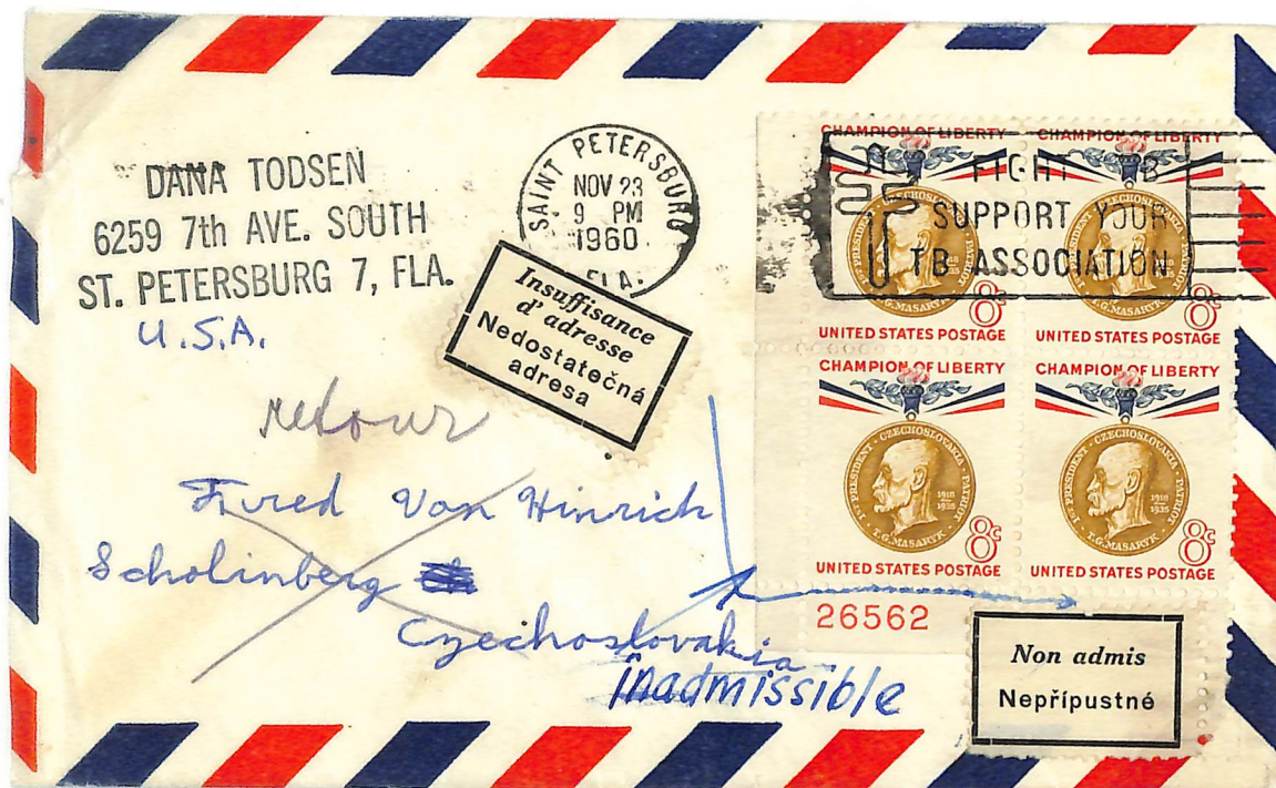
Double weight franking, 1-cent overpaid. 8c Masaryk (4) Returned to sender, insufficient address.