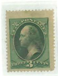
#158 - Used, Jumbo Margins With Magenta Maltese Cross Cancel