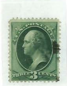
#136 - Used, "H" Grill Variety