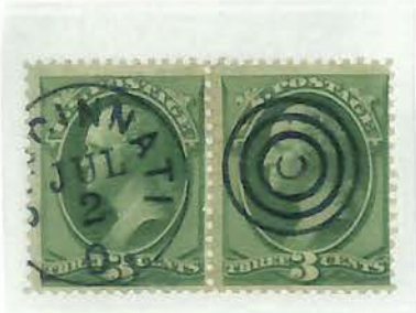
#158 - Used Pair, Blue Cincinnati OH Duplex Cancel