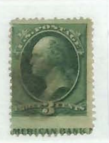
#184 Variety - Used Type 4 Imprint Capture American BNC (1879 or Later) Thin Hard Paper Variety