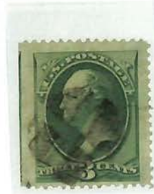
#158 Used, Left Straddle Margin With Guide Arrow @ Bottom