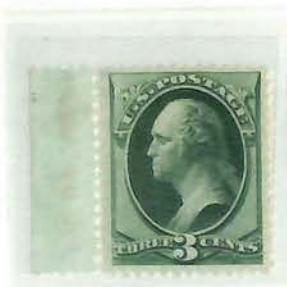
#147 - Unused, Never Hinged Sheet Margin Single