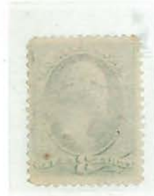
#207 - Used, Partial Offset on Reverse