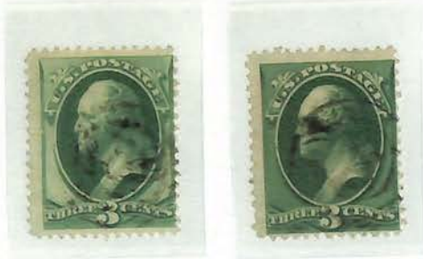
#147 & #158 - Used, Position Dot Within Circular Frame at Left