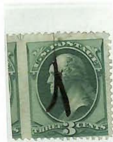
#158 - Used, Left Straddle Margin With Guide Arrow @ Top