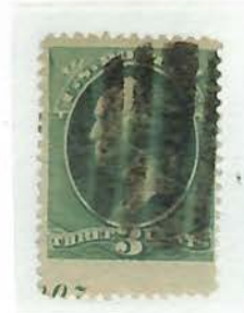
#207 - Used With Plate Number Captured at Bottom