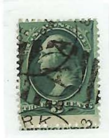
#207 - Used Type 3 Imprint Capture American BNC Thick Soft Porous Paper