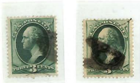
#158 - Used, Underinked Background Frame Lines