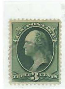
#184 - Used, Very Faint Magenta Circular Cancel