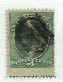
#184 - Used Type 3 Imprint Capture American BNC Thick Soft Porous Paper