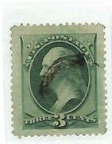
#184 - Used, Jumbo Margins