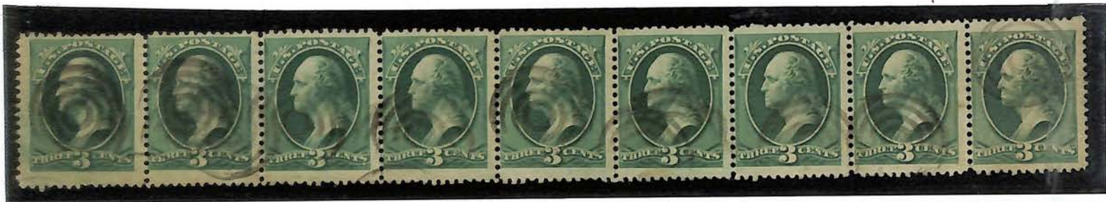
#184 - Used Horizontal Strip of 9, Black Target Cancels