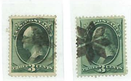
#158 - Used, Circular Star and Circular Geometric Cancels