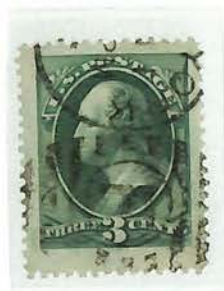
#184 - Used, Jumbo Margins