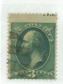
#207 - Used With Plate Number Captured at Top