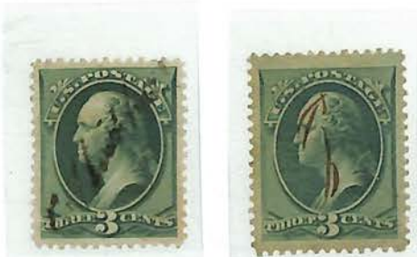
#184 - Used, Each With Manuscript Cancel