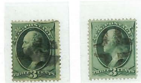
#158 Variety - Used, Short Transfer at Bottom