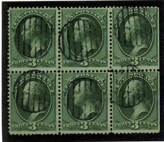
#158 - Used Horizontal Block of 6, Olive Color Variety, Blue Circular Grid Cancels