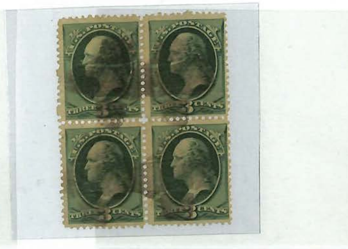
#184 - Used Block of 4