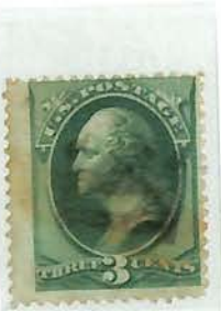
#136 - Used, "H" Grill Split Top-Bottom