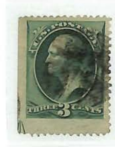
#184 - Used, Jumbo Left Straddle Margin With Arrow