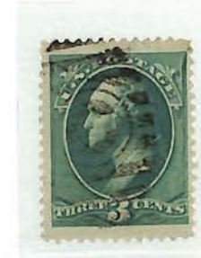
#207 - Used, Jumbo Margins