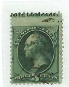
#184 Variety - Used Type 4 Imprint Capture American BNC (1879 or Later) Thin Hard Paper Variety