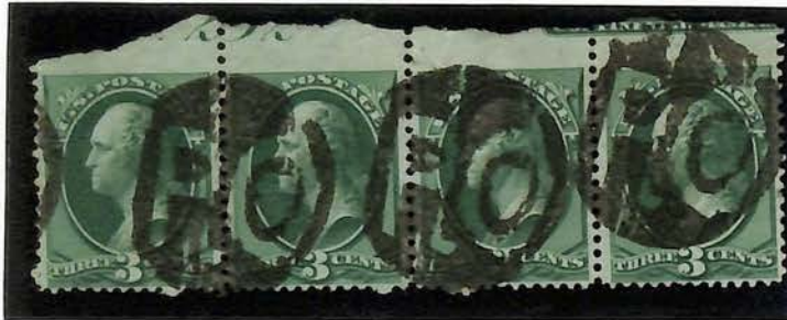
#158 - Used Strip of 4, Imprint & Plate Number Capture at Top, Fancy Negative "PO" Cancel