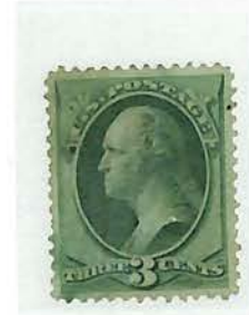
#136 - Used, "I" Grill Variety