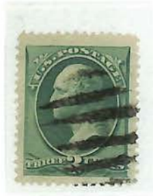
#184 - Used, Jumbo Margins