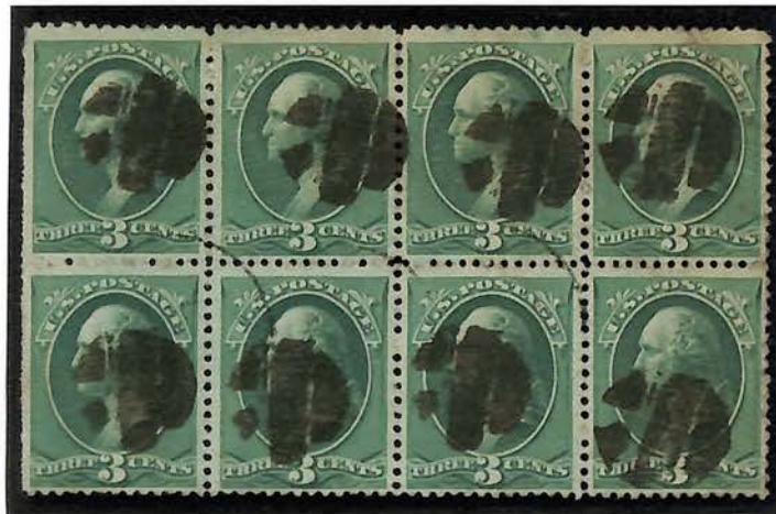
#207 - Used, Horizontal Block of 8, Blue-Green Color, Black Geometric Cancels