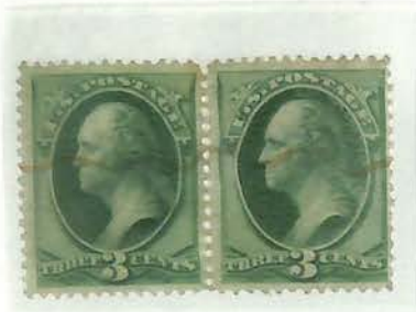
#147 - Used Pair, Manuscript Cancel