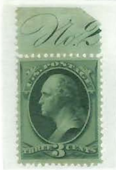
#158 - Unused Margin Copy With Plate Number