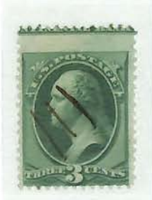
#158 - Used Type 1 Imprint Capture Continental BNC Thin Hard Paper, Identical to National BNC