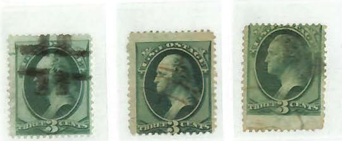
#158 & #184 - Used, Plate Scratches or Cracks at Left & Bottom