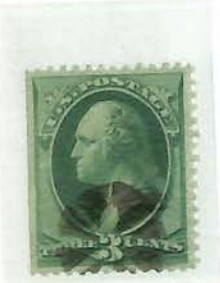
#136 - Used, "I" Grill Variety