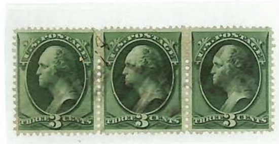
#158 - Used Strip of 3, Right & Left Stamps With Ink Smear