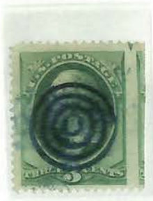
#147 - Used, Right Straddle Margin With Guide Arrow @ Top