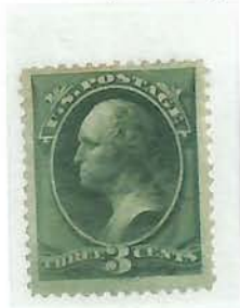
#158 - Used, Very Faint Cancel, Appears Unused