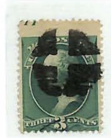
#207 - Used With Plate Number Captured at Top