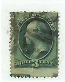
#184 - Used Type 2 Imprint Capture Continental or American BNC Thick Soft Porous Paper