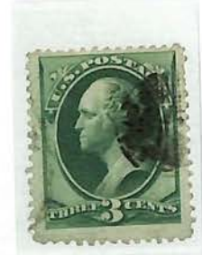
#136 - Used, Partial Grill Top Right (Continues on Next Stamp)