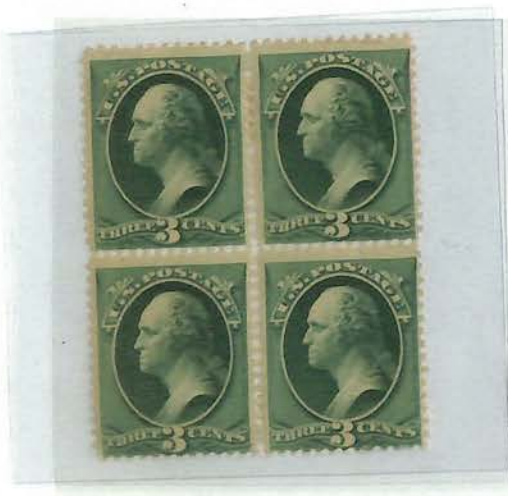
#158 - Unused Original Gum Block of 4