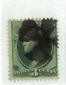
#158 - Used, Ink Spot Lower Left