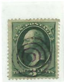
#158 - Used, Magenta Target Cancel