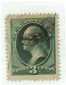
#184 - Used, Jumbo Margins