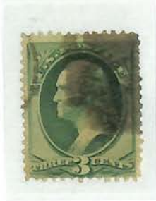
#158 - Used, Dry Printing Variety