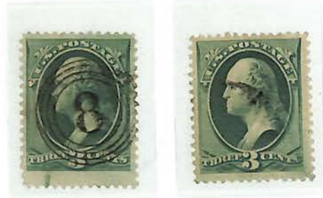
#184 - Used, Ink Smear Bottom Left & Right