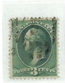
#207 - Used, Part Registered Cancel