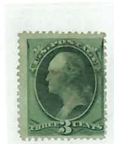
#136 - Used, "H" Grill Variety