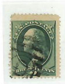
#184 - Used, Position Dot Top Outside Frame