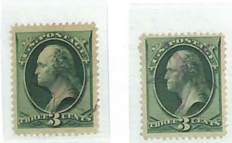
#158 & #184 - Used, Magenta Star Cancels