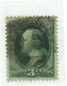
#184 - Used, Jumbo With Negative "E" Cancel