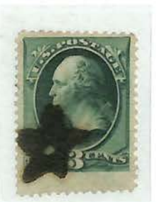
#184 - Used, Tall Stamp, Fancy Star Cancel