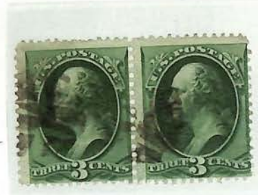
#158 Variety - Used Pair, Short Transfer at Bottom