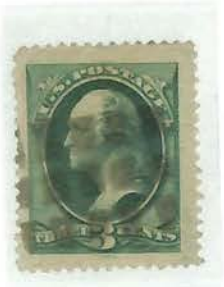
#184 - Used, Jumbo Margins With Grid Cancel