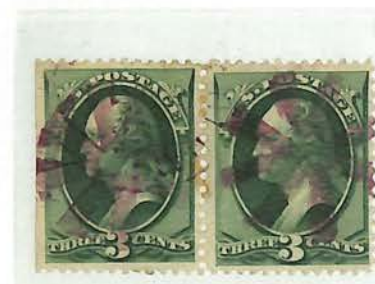
#158 - Used Pair, Magenta Circular Geometric Cancel