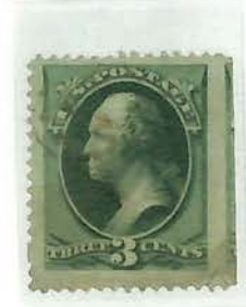
#147 - Used, Right Straddle Margin With Guide Arrow @ Bottom