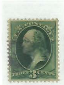
#184 - Used, Purple Circular Clamshell Cancel