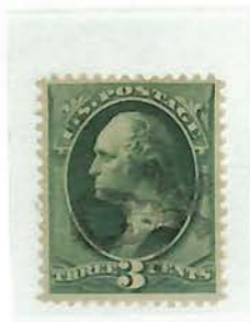
#184 - Used, "Skull & Crossbones" Cancel (Cole SK-32)