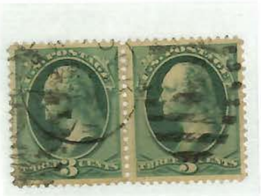
#184 - Used Pair, April 29, 1879 New York Cancel