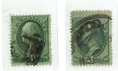
#184 - Used, Mottled Ink Bottom and Top