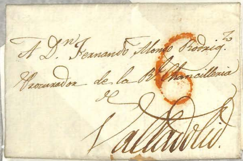
1826 - 14TH JANUARY - FOLDED LETTER FROM MADRID TO VALLADOLID WITH LARGE "6" RATE MARK IN RED.