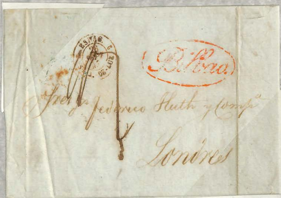
1841 - 24th SEPT. - LETTER AND SHIP'S SCHEDULE FROM BILBAO TO LONDON. ORANGE-RED "BILBAO" IN SCRIPT SURROUNDED BY OVAL. ARRIVED OCTOBER 1st.