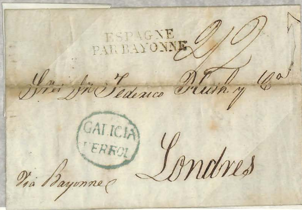
1827 - 15th SEPT. - BUSINESS LETTER FROM FERROL TO LONDON. BLUE GALICIA "FERROL" IN OVAL.