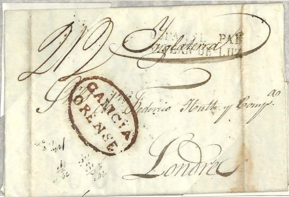
1835 - 22nd FEBRUARY - FLD. LETTER FROM ORENSE TO LONDON. LARGE "GALICIA ORENSE" IN ROPE OVAL.