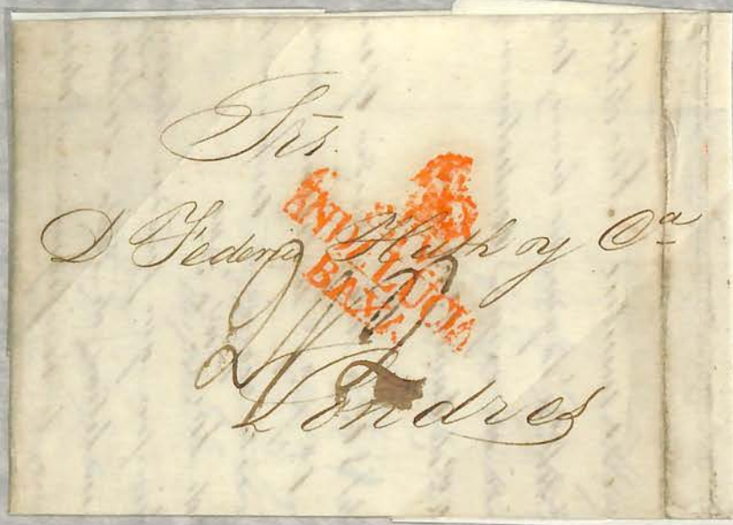
1842 - 10th JANUARY - FLD. LETTER FROM SEVILLA TO LONDON. FANCY, CROWNED "SEVA, ANDALUCIA BAXA" IN RED.