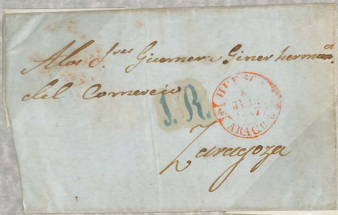
1847 - 4th JULY - RED, TYPE I BAEZA OF HUESCA, ARAGON PROVINCE ON FOLDED LETTER TO ZARAGOZA. BLUE "1R" RATE MARK AND RED ZARAGOZA BAEZA ON REVERSE.