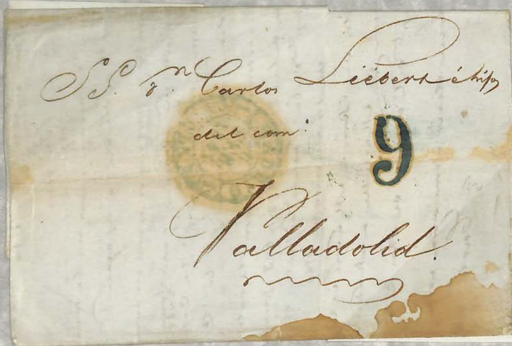
1844 - 8th FEBRUARY - TYPE I BAEZA OF MADRID IN BLUE. ON FLD. LETTER TO VALLADOLID. BLUE "6" RATE MARK.