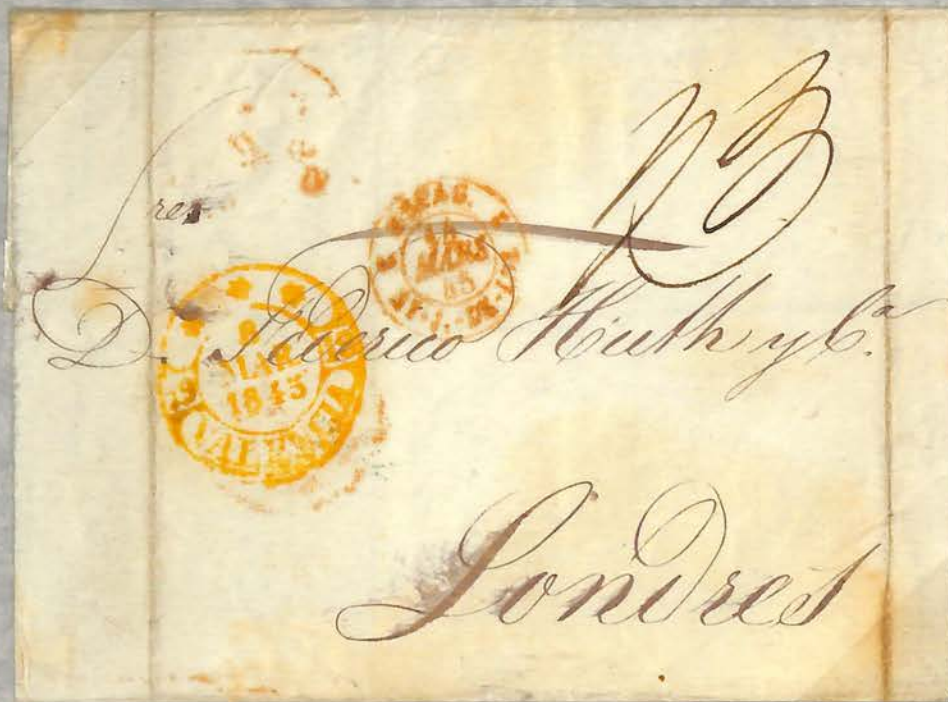
MARCH 8, 1845 - ORANGE VALENCIA TYPE II BAEZA ON COVER TO LONDON. FRENCH TRANSIT MARKS ON FRONT AND REVERSE.