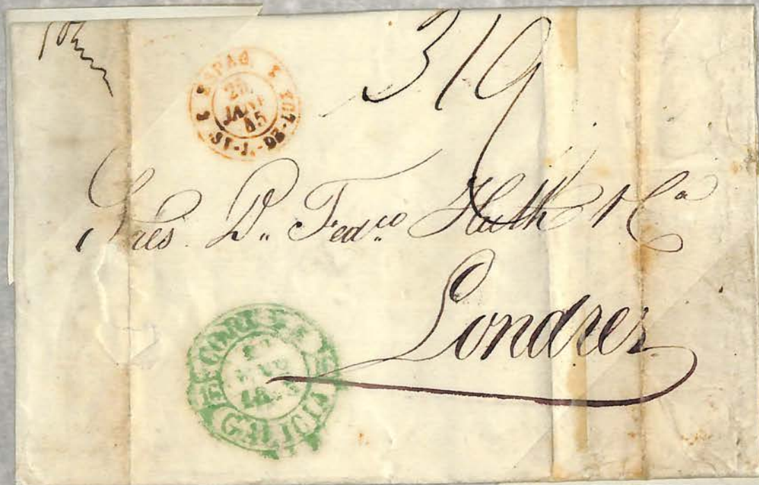
1845 - 20th JANUARY - GREEN, TYPE I BAEZA OF CORUÑA ON FOLDED LETTER TO LONDON. FRENCH TRANSIT MARKS.