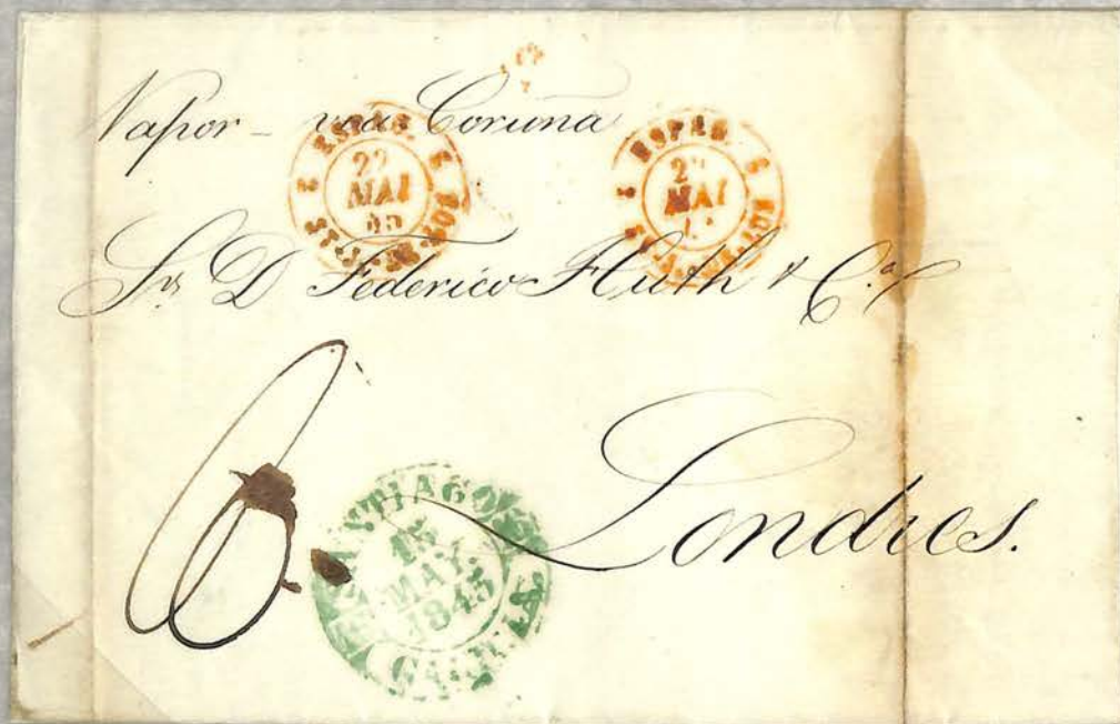
MAY 15, 1845 - GREEN SANTIAGO, GALICIA TYPE I BAEZA ON COVER TO LONDON. ORANGE FRENCH TRANSIT MARKS.