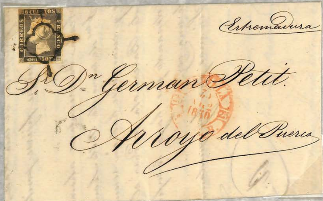
August 30 NOVEMBER 28, 1850 - SPAIN'S FIRST STAMP ON COVER WITH "SPIDER" CANCELLATION. SEVILLA BAEZA USED AS DATE STAMP WHICH CONTINUED INTO STAMP PERIOD.