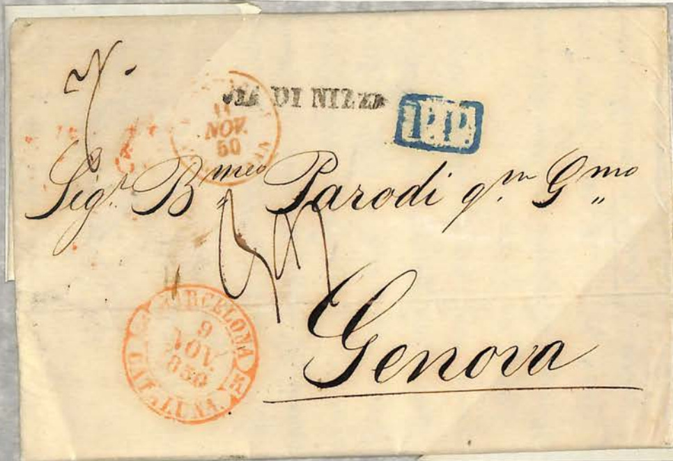
1850 - 9th NOVEMBER - LETTER FROM BARCELONA TO GENOA, ITALY. FRENCH AND ITALIAN TRANSIT MARKS.