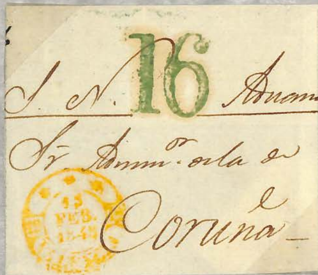
ORANGE VALENCIA TYPE II BAEZA DATED FEBRUARY 15, 1845. ON PIECE WITH "16" RATE MARK APPLIED WHEN LETTER WENT ON GREEN ROUTE TO CORUNA.