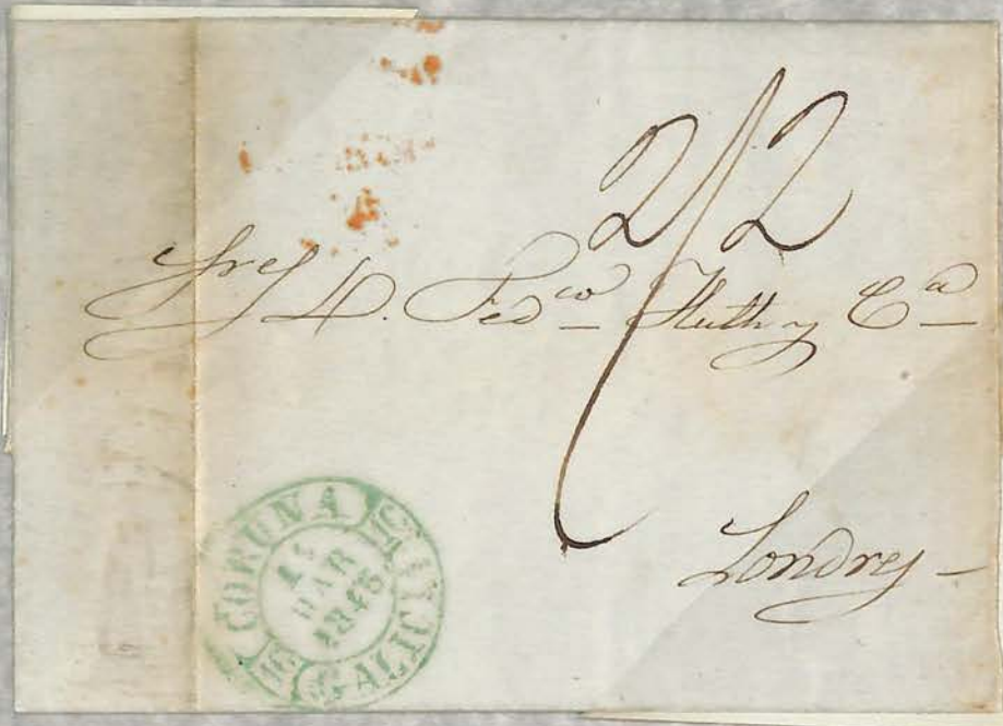
1845 - 14th MARCH - GREEN, TYPE I BAEZA OF CORUÑA, GALICIA PROVINCE. FLD. LETTER TO LONDON.