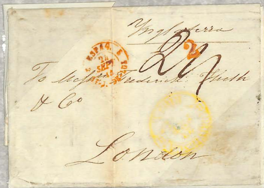
1844 - 22nd SEPTEMBER - YELLOW, TYPE I BAEZA OF BRIVIESCA, A SMALL TOWN ON THE "YELLOW ROUTE".