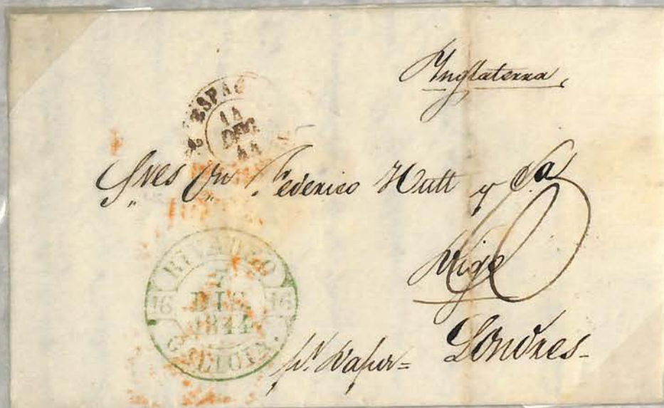
DECEMBER 7, 1844 - GREEN RIVADEO, GALICIA TYPE I. BAEZA ON COVER TO LONDON VIA STEAM SHIP. ORANGE ST. JEAN-DE-LUZ FRENCH TRANSIT MARKS.