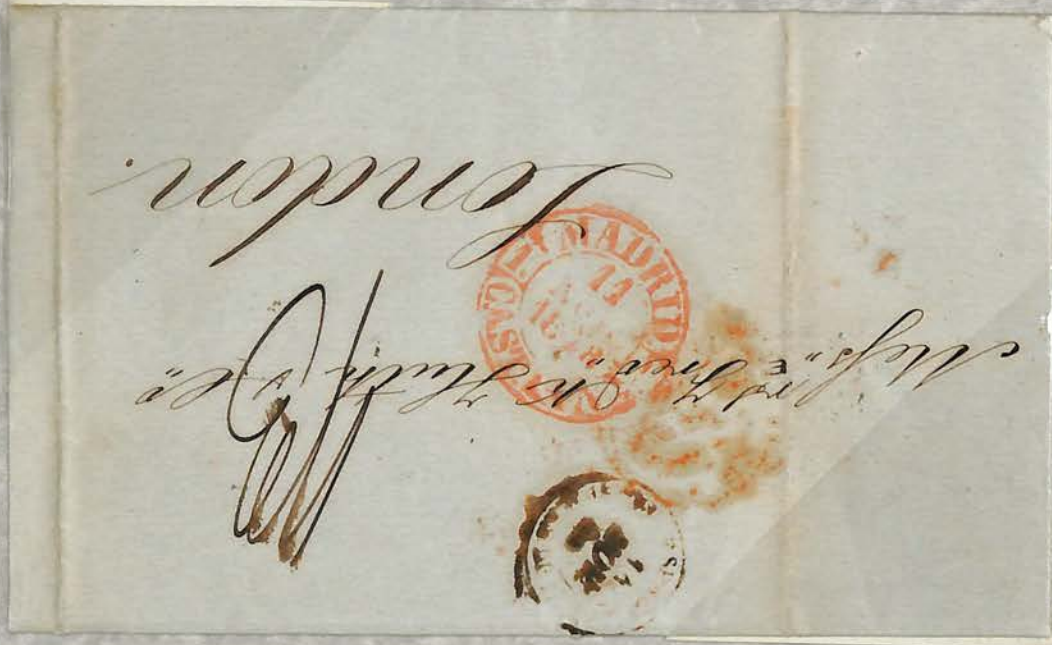
1848 - 11th NOVEMBER - REGULAR TYPE I BAEZA OF MADRID. COMPARED TO SUB-TYPE ABOVE.