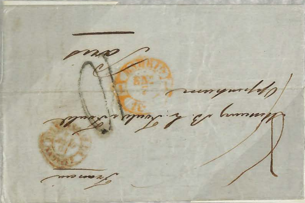
1854 - 7th JANUARY - FLD. LETTER BEARING ORANGE-RED MADRID BAEZA SUB-TYPE. FLD. LETTER TO PARIS.