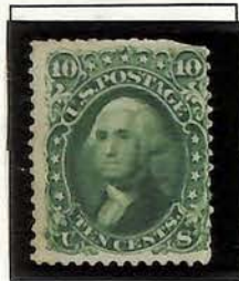
GEORGE WASHINGTON 0 65.