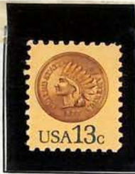
INDIAN HEAD PENNY