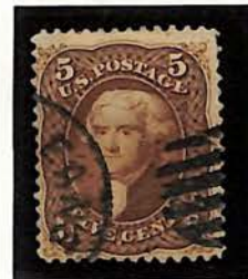
THOMAS JEFFERSON 475.