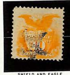
SHIELD AND EAGLE