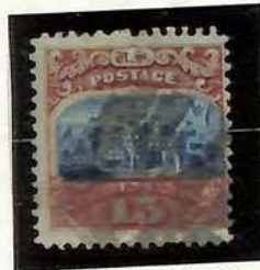
LANDING OF COLUMBUS