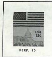
FLAG & CAPITOL DOME