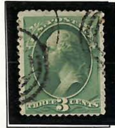
GEORGE WASHINGTON 1.-