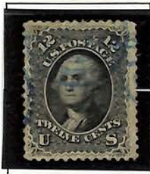
GEORGE WASHINGTON 0 120.