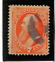
EDWIN M. STANTON