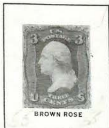
BROWN ROSE GEORGE WASHINGTON