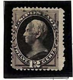
HENRY CLAY 12.5.-