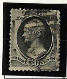
ALEXANDER HAMILTON 30c