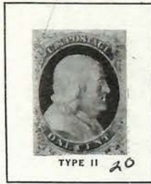
TYPE II 20 BENJAMIN FRANKLIN 300.