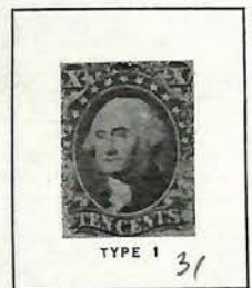
TYPE I 31 GEORGE WASHINGTON 1700.