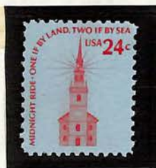
OLD NORTH CHURCH