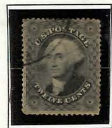
GEORGE WASHINGTON 350.