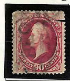
OLIVER HAZARD PERRY