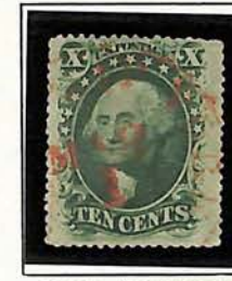
GEORGE WASHINGTON 65.