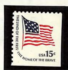
FT. MCHENRY FLAG