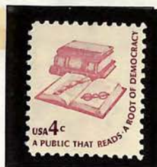
BOOK & EYEGLASSES