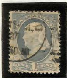
BENJAMIN FRANKLIN 15c

American Bank Note Co. Printing Same as 1870-75 Issues: Soft Porous Paper