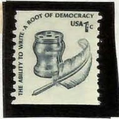
INKWELL & QUILL