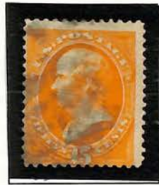
DANIEL WEBSTER 160.