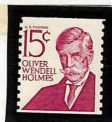
OLIVER WENDELL HOLMES