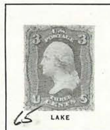
65 LAKE GEORGE WASHINGTON