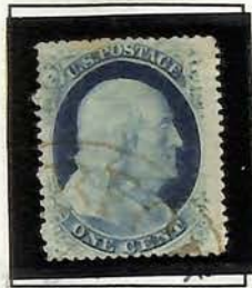
BENJAMIN FRANKLIN 45.