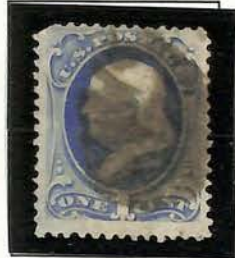
BENJAMIN FRANKLIN 5.

Continental Bank Note Co. Printing Types of 1870-71 with Secret Marks: Thin Hard Paper