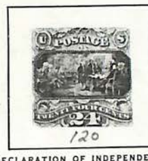
DECLARATION OF INDEPENDENCE