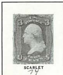
SCARLET 74 GEORGE WASHINGTON