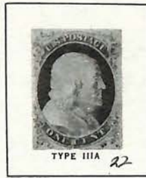
TYPE IIIA 22 BENJAMIN FRANKLIN 550