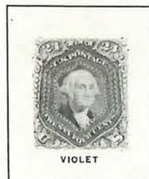
VIOLET GEORGE WASHINGTON