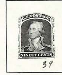
39 GEORGE WASHINGTON 3500 *

These were the first perforated stamps! They were enthusiastically welcomed, because previous stamps were usually cut apart with scissors. This issue includes the identical 1851-56 denominations, plus the much-needed 24c, 30c and 90c values for foreign mail and large postage amounts.