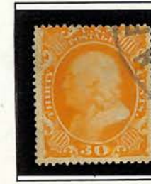
BENJAMIN FRANKLIN 425.