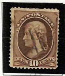
THOMAS JEFFERSON 27c