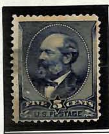
JAMES A. GARFIELD