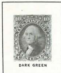
DARK GREEN GEORGE WASHINGTON