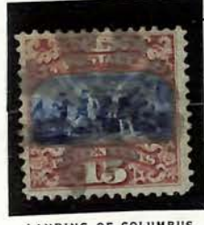
LANDING OF COLUMBUS