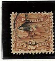
PONY EXPRESS RIDER