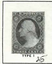
TYPE I 25 GEORGE WASHINGTON 125.