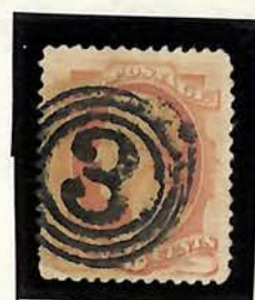
ABRAHAM LINCOLN 30c