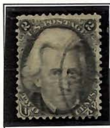
ANDREW JACKSON 0 70.