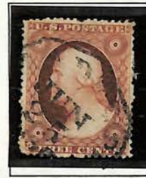
GEORGE WASHINGTON 9.