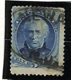
ZACHARY TAYLOR 5.

The 1873 design, honoring President Andrew Jackson, was now printed in vermilion; and a new blue 5c value, picturing President Zachary Taylor, was issued to comply with the rate set by the international Universal Postal Union for European mail.