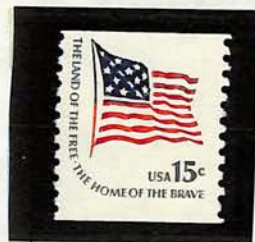
FT. MCHENRY FLAG