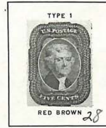
TYPE I RED BROWN 28 THOMAS JEFFERSON 1200.