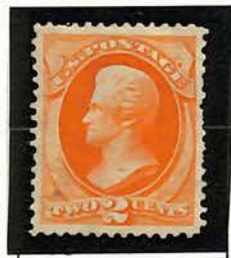
ANDREW JACKSON 25.