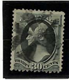
ALEXANDER HAMILTON 140