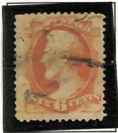
ABRAHAM LINCOLN 20.