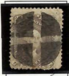
GEORGE WASHINGTON 300.