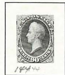
OLIVER HAZARD PERRY