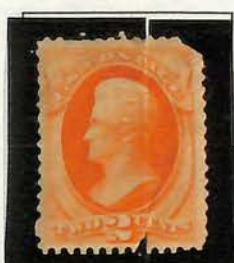
ANDREW JACKSON 25c