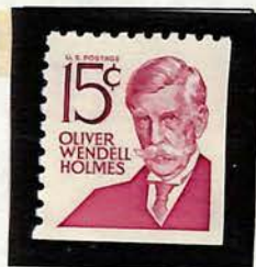
OLIVER WENDELL HOLMES