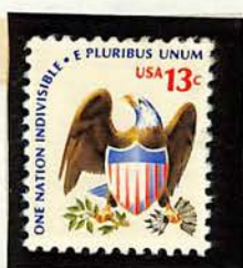
EAGLE & SHIELD