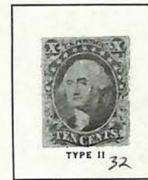
TYPE II 32 GEORGE WASHINGTON 300.