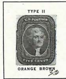
TYPE II ORANGE BROWN 29 THOMAS JEFFERSON 1200.