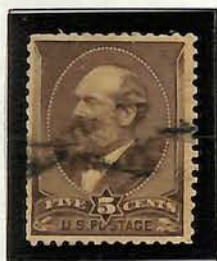
JAMES A. GARFIELD