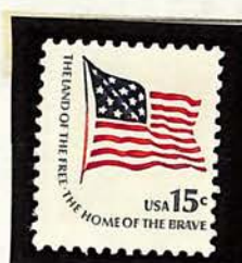
FT. MCHENRY FLAG