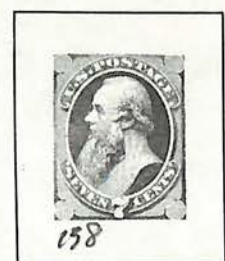
EDWIN M. STANTON