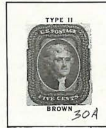
TYPE II BROWN 30A THOMAS JEFFERSON 325