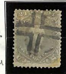
GEORGE WASHINGTON 450.

With the outbreak of the Civil War all previous U.S. postage issues were declared valueless, to prevent their use by Confederates. During the war the 1861-66 stamps were also used by Northerners as "small change," due to the lack of metal coins. These varieties include the famous "Black Jacks" honoring President Andrew Jackson; and the first Abraham Lincoln stamp marking the anniversary of his assassination.