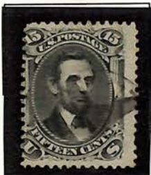
ABRAHAM LINCOLN 225. #2 MOU