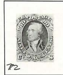
72 GEORGE WASHINGTON 600.