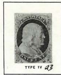
TYPE IV 23 BENJAMIN FRANKLIN 300