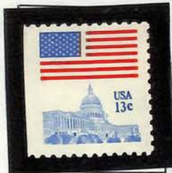
FLAG & CAPITOL DOME