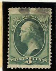
GEORGE WASHINGTON 3c