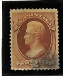
ANDREW JACKSON 25.