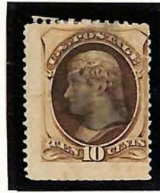
THOMAS JEFFERSON 25.