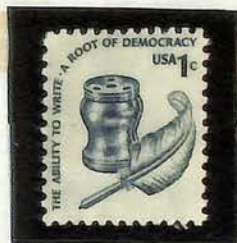
INKWELL & QUILL