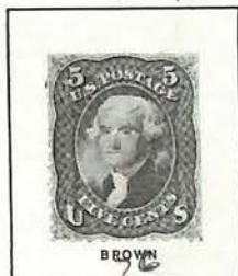
BROWN 76 THOMAS JEFFERSON