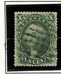
GEORGE WASHINGTON 300.