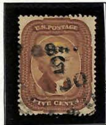
THOMAS JEFFERSON 2012 cat 325.