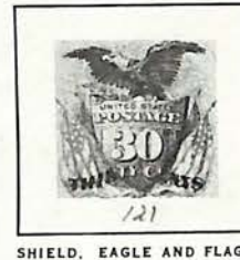
SHIELD, EAGLE AND FLAGS