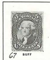
67 BUFF THOMAS JEFFERSON 1100