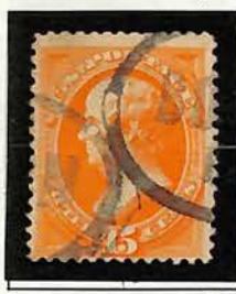
DANIEL WEBSTER 15c