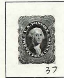
37 GEORGE WASHINGTON 400.