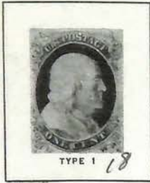
TYPE I 18 BENJAMIN FRANKLIN 700.