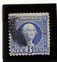
SIX 6 CENTS