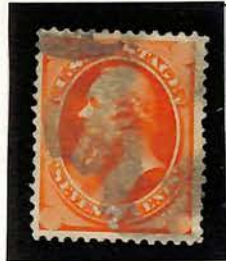
EDWIN M. STANTON 90.