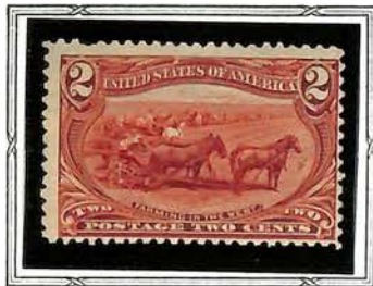
Farming in the West