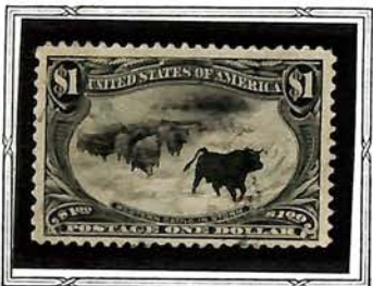
Western Cattle in Storm