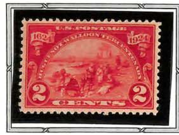
Landing at Fort Orange