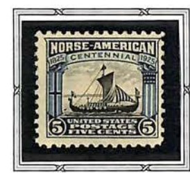
A Viking Ship

Two stamps of 2¢ and 5¢ denomination were issued to commemorate the 100th anniversary of the arrival in New York, on October 9, 1825, of the sloop Restaurationen with the first group of immigrants to the United States from Norway.