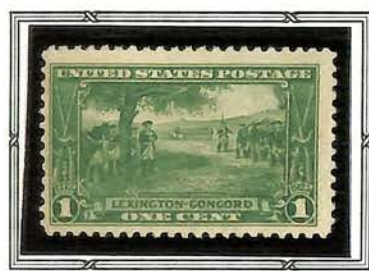
Washington at Cambridge