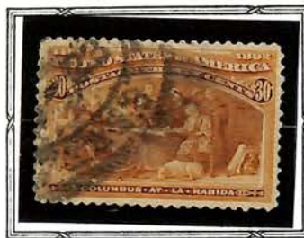
Columbus at La Rabida