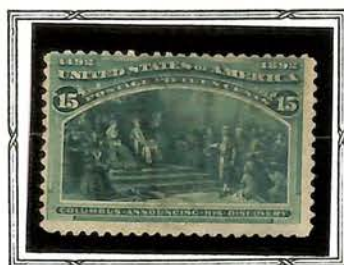
Columbus announcing his discovery