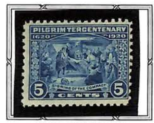
Signing of the Compact

Authorized by Congress, the Postmaster General first placed on sale in December, 1920, a set of three stamps commemorating the 300th anniversary of the landing of the Pilgrims at Provincetown and Plymouth, Mass.