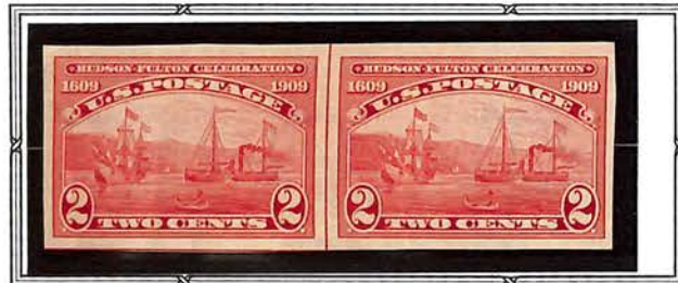
The Clermont and Half Moon

Celebrating the tercentenary of the discovery of the Hudson River and the centennial of its first navigation by steam, this stamp was first placed on sale September 25, 1909. The central design shows the progress from canoe to steam on the Hudson River.