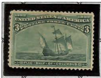
Flagship of Columbus