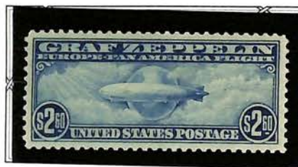
Graf Zeppelin over Globe

Great interest in the mail carrying flights of the Graf Zeppelin prompted the Post Office Department to issue this set of three stamps in connection with the Europe-Pan American Flight. This was one of the more important flights of the great German airship which carried it from Germany to South America, thence to Lakehurst and back to Germany in a huge triangle. The stamps were placed on sale April 19, 1930 at Washington, D. C. and at selected post offices in the forty-eight states on April 21st.