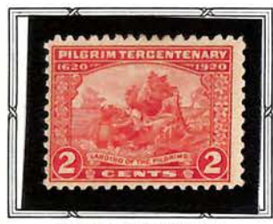
Landing of the Pilgrims