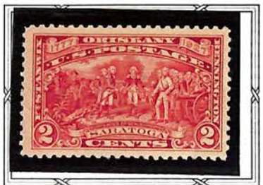
Surrender of Burgoyne

The Surrender of Burgoyne at Saratoga marked the end of a campaign in which the Battles of Fort Stanwix, Oriskany, Bennington and Saratoga played an important part in the winning of the American Revolution.