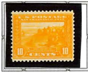
Discovery of San Francisco Bay