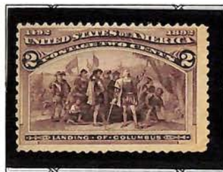
Landing of Columbus