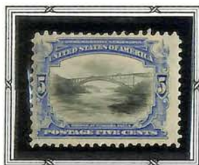
Bridge at Niagara Falls