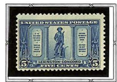
The Minute Man

These stamps commemorate the 150th anniversary of the Battle of Lexington and Concord—the birthplace of Liberty and the Minuteman, and where also, the famous eulogy, "By the rude bridge that arched the flood their flag to April's breeze unfurled. Here once the embattled farmers stood and fired the shot heard round the world", stands inscribed.