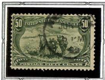
Western Mining Prospector