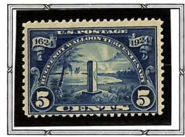
Monument at Mayport, Fla.

This series of postage stamps was issued to commemorate the three hundredth anniversary of the settling of the Walloons in New Netherlands in 1624. This is now the State of New York.