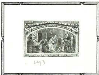
Columbus describing third voyage