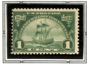
The New Netherlands