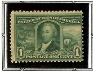
Robert R. Livingston