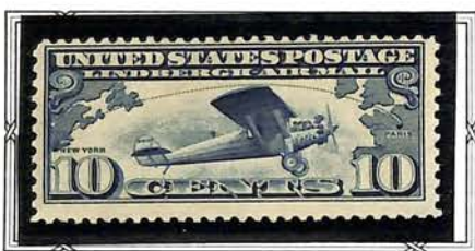
Spirit of Saint Louis

This stamp, placed on sale June 18, 1927, marks Charles A. Lindbergh's non-stop solo flight from New York to Paris in his "Spirit of St. Louis" in May of 1927, the first successful such flight.