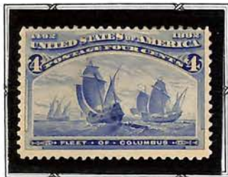
Fleet of Columbus