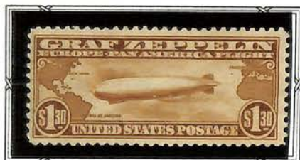
Graf Zeppelin between Continents