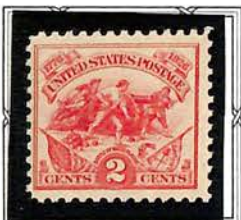
Battle of White Plains

A painting by E. F. Ward adorns the stamp issued to commemorate the 150th anniversary of the Battle of White Plains. It was here at White Plains where the "Liberty or Death" flag first made its appearance.