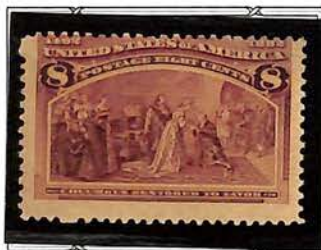
Columbus restored to favor