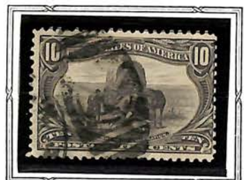
Herdships of Emigration