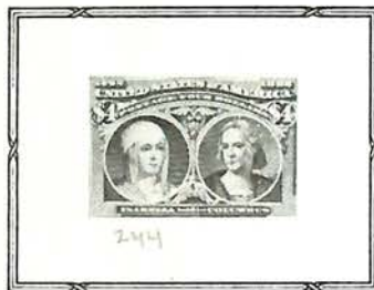
Isabella - Columbus