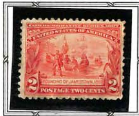
Founding of Jamestown