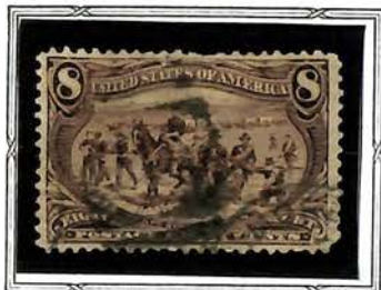
Troops Guarding Train