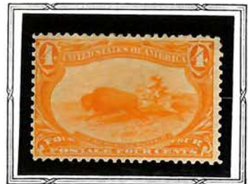
Indian Hunting Buffalo