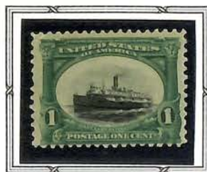
Fast Lake Navigation