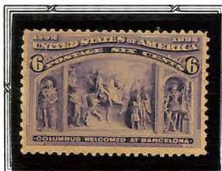
Columbus welcomed at Barcelona