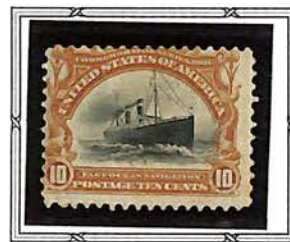
Fast Ocean Navigation

Coinciding with the opening and closing of the Pan American Exposition at Buffalo, N. Y., this set was placed on sale May 1, 1901, at Post Offices throughout the country and withdrawn from sale October 31, 1901. The stamps were issued to commemorate and publicize the exposition which had for its theme, "To illustrate the progress of the New World during the 19th Century."