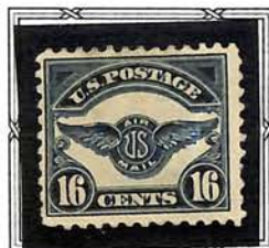
Emblem of Mail Service