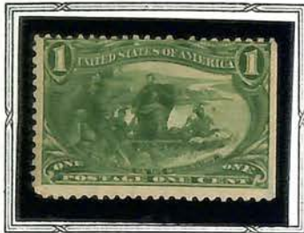
Marquette on the Mississippi