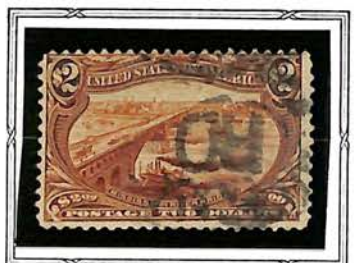
Mississippi River Bridge

This set of nine stamps was issued to commemorate the opening of the Trans-Mississippi and International Exposition at Omaha, Nebraska. The various scenes portrayed on the stamps were taken from art reproductions depicting the progress of the "Golden West." The Series was placed on sale June 10, 1898, and discontinued on December 31st of the same year.