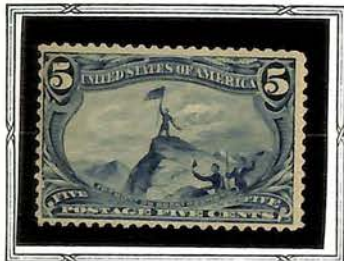
Fremont on Rocky Mountains