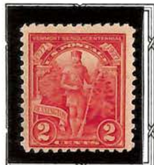
Green Mountain Boy

A Green Mountain Boy, one of the colonist heroes of the Battle of Bennington, is shown on this stamp, which was issued to mark the 150th anniversary of the Battle and of Vermont's independence.