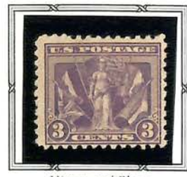
Victory and Flags

The successful termination of World War I brought forth a special 3¢ Victory Stamp with its first day sale at Washington, D. C., in March, 1919. A composite, featuring Liberty in front of massed flags, is the central design of the stamp.