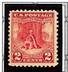
Washington at Prayer

A critical period in American Revolutionary history was the encampment of George Washington's Army at Valley Forge. This stamp, picturing Washington at Prayer, was issued on the 150th anniversary.