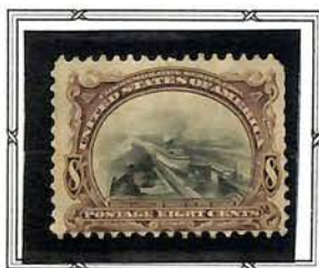
Canal Locks at Sault Ste. Marie