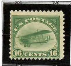
Early Mail Plane