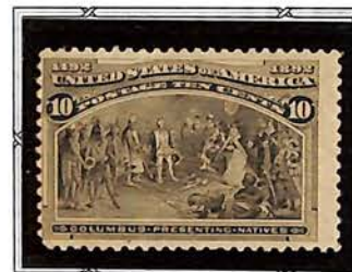
Columbus presenting natives