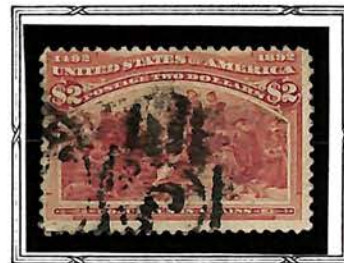
Columbus in chains