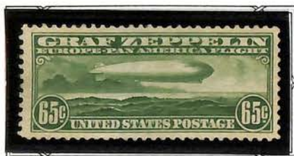
Graf Zeppelin over Ocean