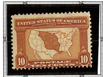
Map of Louisiana Purchase

Issued to commemorate and publicize the World's Fair, St. Louis, 1903 the purpose of which was to celebrate the 100th anniversary of the purchase of the Louisiana Territory from France. The stamps, in a set of five, were placed on sale May 1, 1904, to December 1, 1904, and honored those connected with its purchase, as well as a map of the territory.