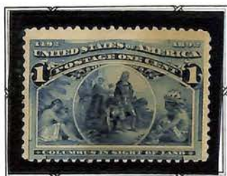
Columbus in sight of land