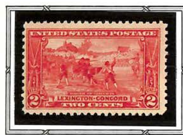
Birth of Liberty