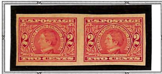
William H. Seward

To commemorate the development of the Alaska-Yukon-Pacific Territory, a 2¢ stamp was placed on sale at Seattle, Washington, June 1, 1909. A portrait of William H. Seward, Secretary of State, who negotiated the purchase of Alaska from Russia in 1867, appears on this stamp.