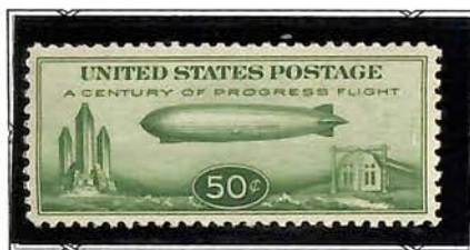
Graf Zeppelin between Friedrichshafen and Chicago

Germany sent the Airship Graf Zeppelin as her messenger of good will to the CENTURY OF PROGRESS EXPOSITION in Chicago the Fall of 1933. The ship carried special souvenir letters for which the 50c stamp was issued on October 2, 1933.