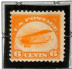
Early Mail Plane