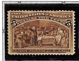
Columbus soliciting aid from Isabella