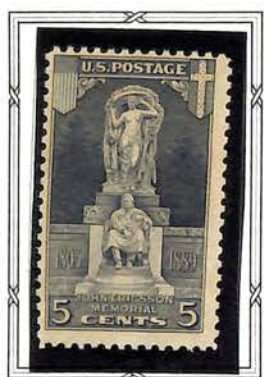
Statue of John Ericsson

Memorializing John Ericsson, builder of the "Monitor," this stamp was issued in 1926 when a statue of him was unveiled in Washington, D. C., by the Crown Prince of Sweden.