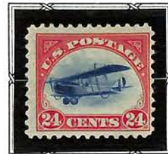
Early Mail Plane

In May 1918, an Act of Congress placed mail carrying by plane on an officially scheduled basis with the postage rate set at 24c. The first air mail stamp was released on May 13, 1918 in connection with the inauguration of air mail service from New York to Washington, D.C. The denomination was 24c and it was this stamp that created the famous inverted airplane error. The 16c denomination was first placed on sale July 11th followed by the 6c on December 10th.