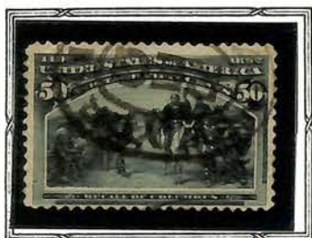
Recall of Columbus