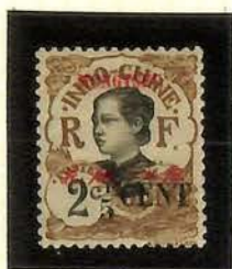
52 surch 145