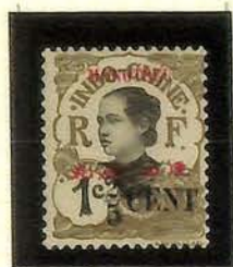
51 surch 135