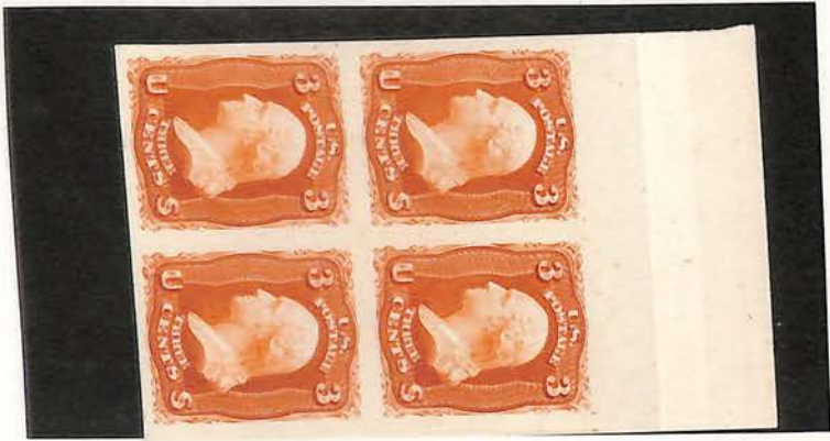
Style No. GK 102BK

65P3 SUPERB TOP MARGIN BLOCK OF 4 INDIA ON CARD Price $599.00