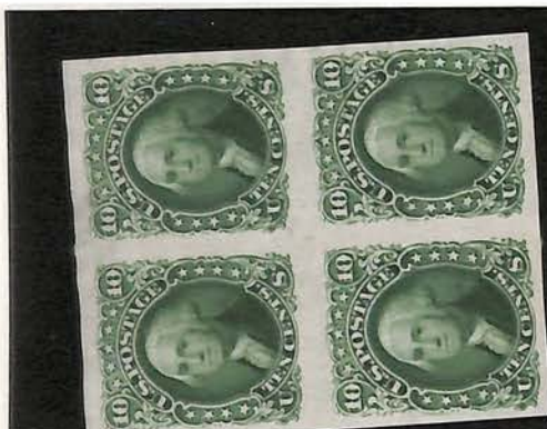
Style No. GK 102BK