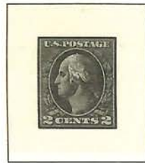
#534B Washington (Type VII)