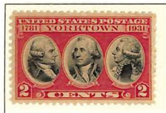
#703 Rochambeau, Washington, de Grasse