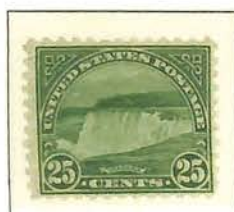
#699 Niagara Falls