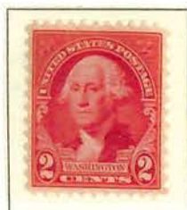
#707 By Gilbert Stuart, 1796