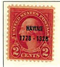
#647 Discovery of Hawaii