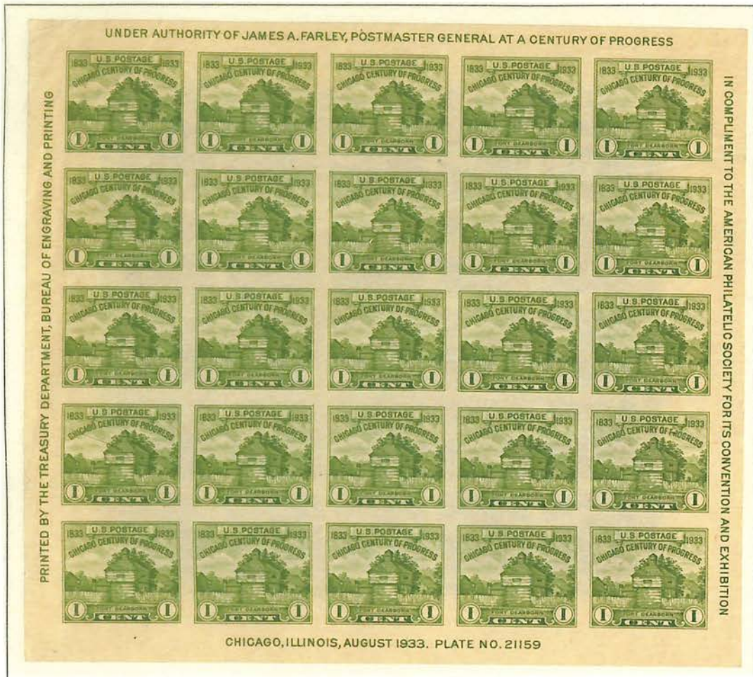
#730 Century of Progress