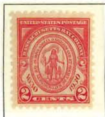
#682 Seal of Mass. Bay Colony