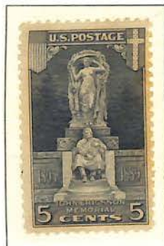
#628 John Ericsson Statue