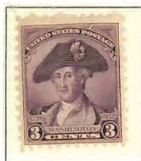
#708 By Charles W. Peale, 1777