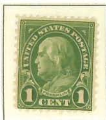
#632 - PERF. 11 x 10 1/2 Franklin