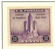
#731a Century of Progress