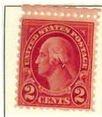
#634A - PERF. 11 x 10 1/2 Washington (Type II)