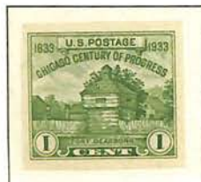
#730a Century of Progress