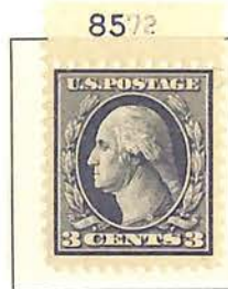
#529 Washington (Type III)