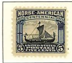
#621 Viking Ship