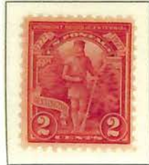
#643 Green Mountain Boy