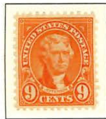
#641 - PERF. 11 x 10 1/2 Jefferson