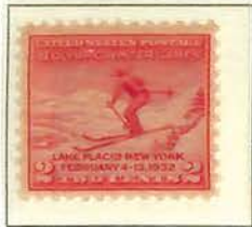
#716 A Ski Jumper