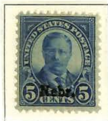
#674 T. Roosevelt