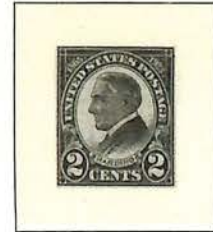
#613 - PERFORATED 11 W.G. Harding