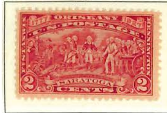
#644 Surrender of Burgoyne