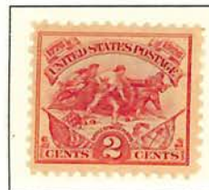
#629 Hamilton's Battery