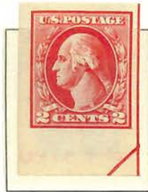
#532 Washington (Type IV)