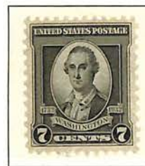
#712 By John Trumbull, 1792