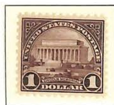
#571 Lincoln Memorial