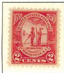
#683 Governor and Indian