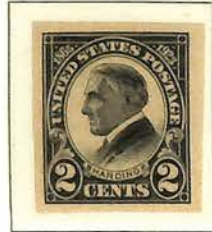
#611 - IMPERFORATE W.G. Harding