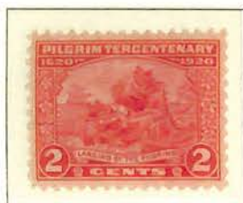
#549 Landing of the Pilgrims