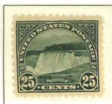
#568 Niagara Falls