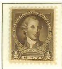
#704 By Charles W. Peale, 1777