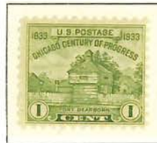
#728 Restoration of Fort Dearborn