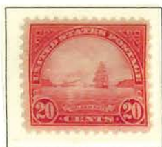
#567 Golden Gate