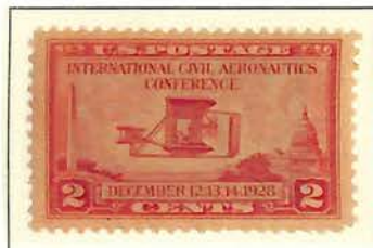
#649 Wright Airplane