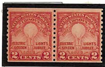
#656 - Rotary Press Coil Edison's First Lamp