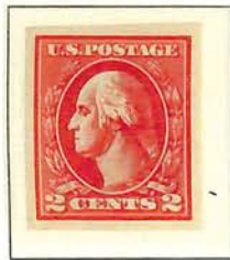
#534A Washington (Type VI)