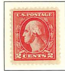
#528 Washington (Type Va)