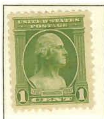
#705 From Houdon Bust, 1785