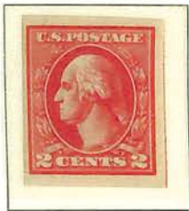
#534 Washington (Type Va)