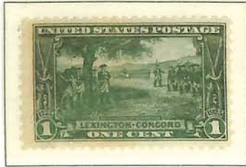
#617 Washington at Cambridge