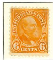
#638 - PERF. 11 x 10 1/2 Garfield