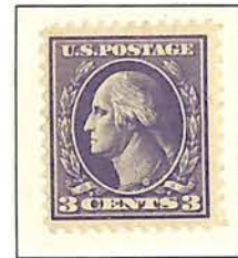
#530 Washington (Type IV)