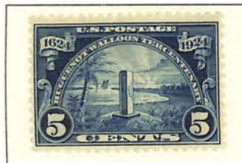
#616 Ribault Memorial Monument