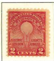
#654 - Flat Plate, Perf. 11 Edison's First Lamp