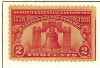
#627 Liberty Bell