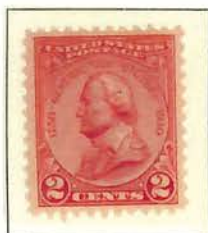
#689 von Steuben