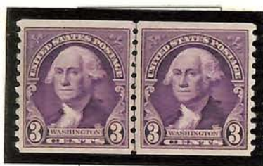
#721 - PERF. 10 VERT. Washington