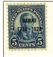
#648 Discovery of Hawaii