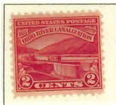
#681 Ohio River Canal Lock #5