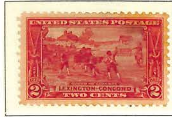
#618 "Birth of Liberty"