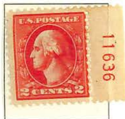
#528A Washington (Type VI)