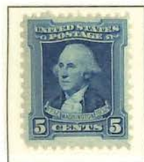
#710 By Charles W. Peale, 1795