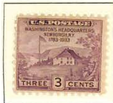
#727 Washington's Headquarters