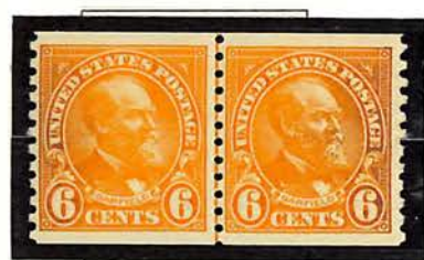
#723 - PERF. 10 VERT. Garfield