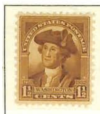
#706 By Charles W. Peale, 1772