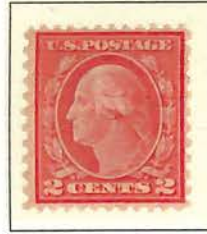
#540 Washington (Type III)