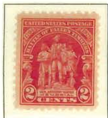
#680 General Wayne Memorial