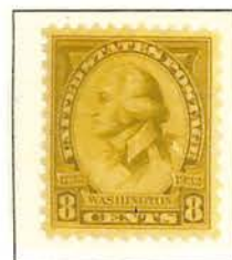
#713 By Charles St. Memin, 1798