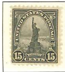
#696 Statue of Liberty