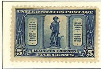
#619 The Minuteman