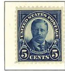
#557 T. Roosevelt