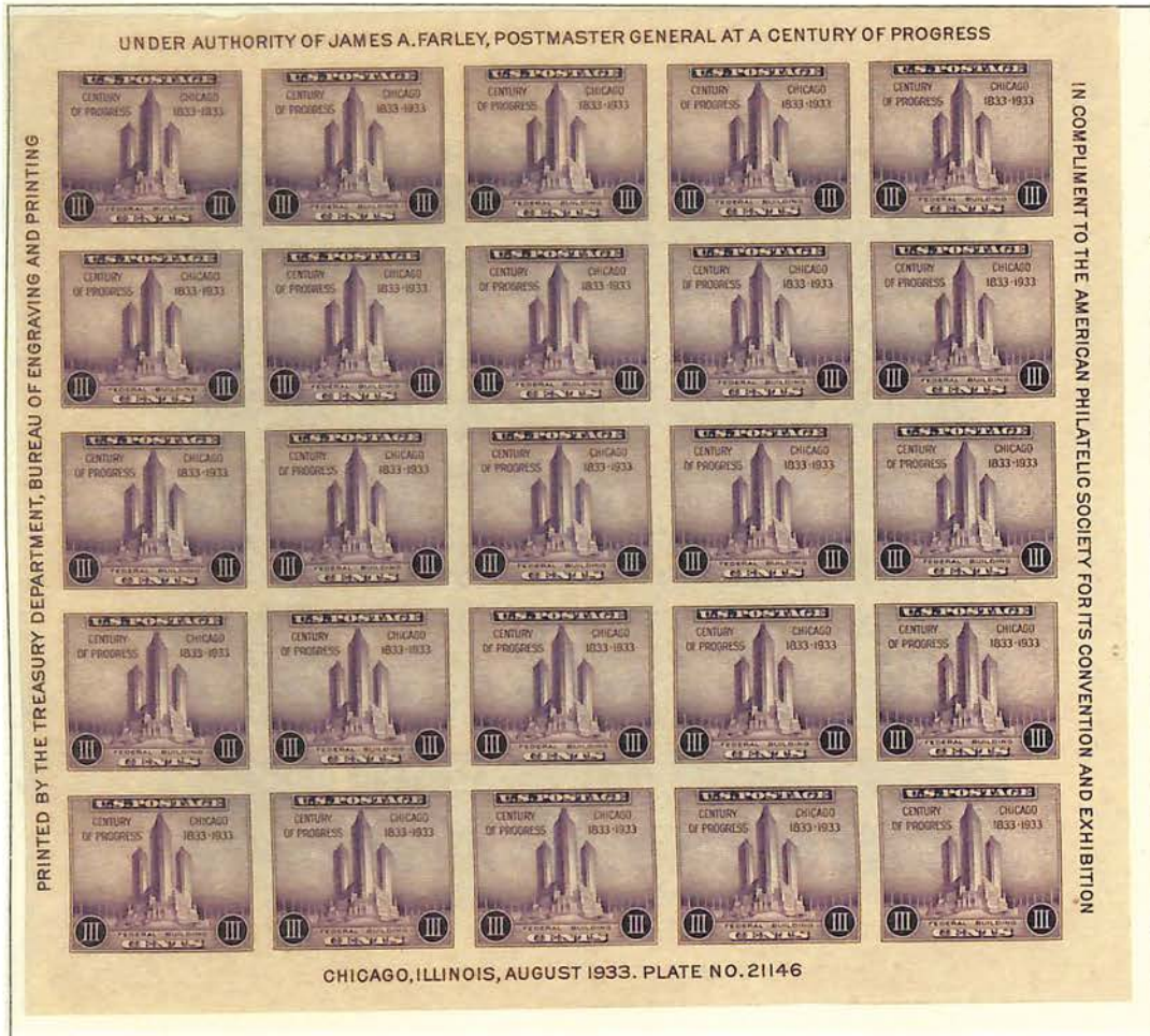
#731 Century of Progress