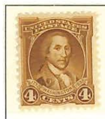
#709 By Charles P. Polk