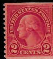
#599A Washington (Type II)