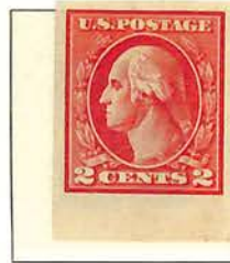
#533 Washington (Type V)