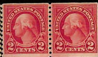
#599 Washington (Type I)