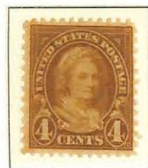
#636 - PERF. 11 x 10 1/2 M. Washington