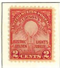
#655 - Rotary, Perf. 11 x 10.5 Edison's First Lamp