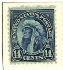
#695 American Indian