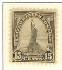
#566 Statue of Liberty