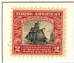
#620 Sloop Restaurationen