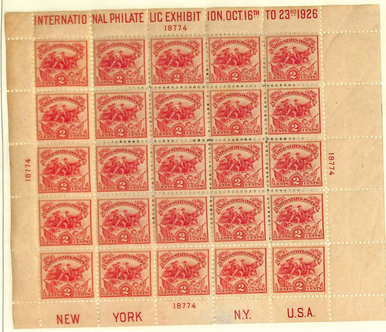
#630 Battle of White Plains