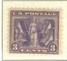
#537 "Victory" and Flags of Allies