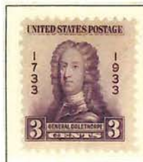
#726 Gen. J. Oglethorpe