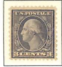
#541 Washington (Type II)