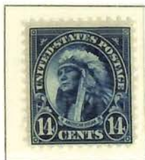
#565 American Indian