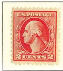
#526 Washington (Type IV)