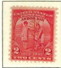
#717 Boy and Girl Planting Tree