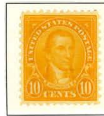
#642 - PERF. 11 x 10 1/2 Monroe