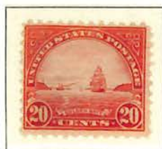
#698 Golden Gate