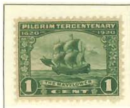
#548 The "Mayflower"