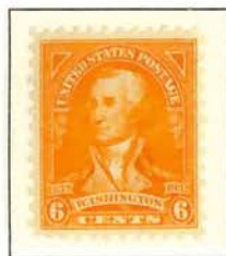
#711 By John Trumbull, 1792