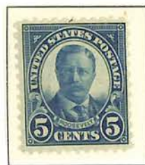
#637 - PERF. 11 x 10 1/2 T. Roosevelt