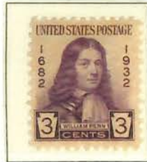
#724 William Penn