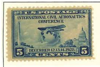
#650 Globe & Airplane