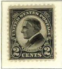
#610 - PERFORATED 11 W.G. Harding