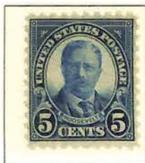
#586 T. Roosevelt