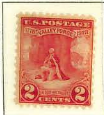
#645 Washington at Prayer