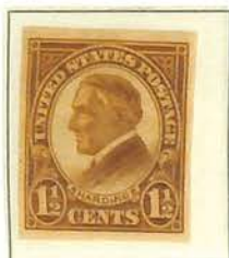
#631 - IMPERFORATE Harding