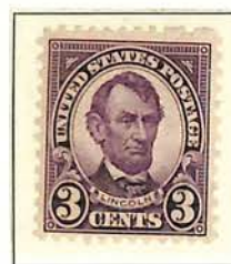
#635 - PERF. 11 x 10 1/2 Lincoln