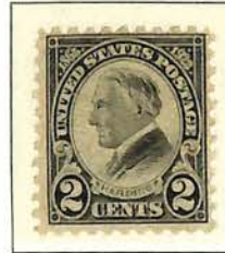
#612 - PERFORATED 10 W.G. Harding