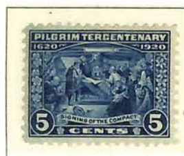
#550 Signing of the Compact