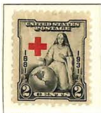
#702 "The Greatest Mother"