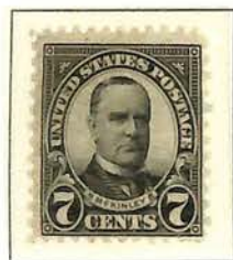
#639 - PERF. 11 x 10 1/2 McKinley