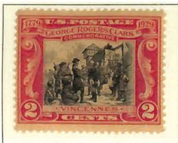
#651 Surrender of Fort Sackville