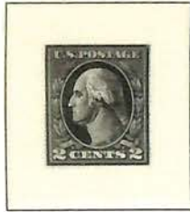
#539 Washington (Type II)