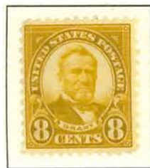
#640 - PERF. 11 x 10 1/2 Grant