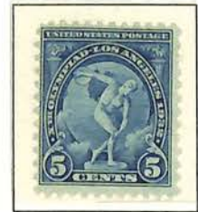
#719 Discus Thrower