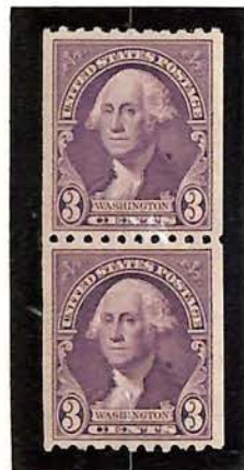
#722 Perf 10 Horiz