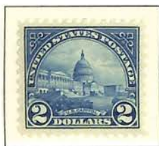
#572 U.S. Capitol