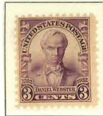
#725 Daniel Webster