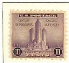
#729 Federal Building at Chicago