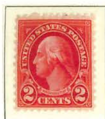
#634 - PERF. 11 x 10 1/2 Washington (Type I)