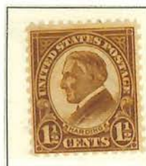
#633 - PERF. 11 x 10 1/2 Harding