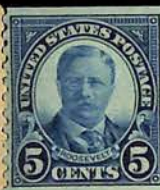
#602 T. Roosevelt