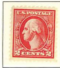
#527 Washington (Type V)