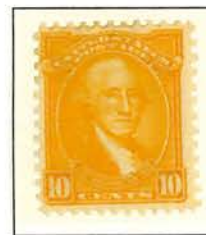
#715 By Gilbert Stuart, 1795