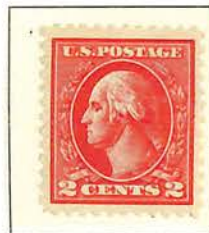
#528B Washington (Type VII)