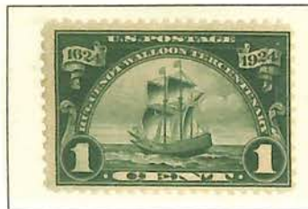
#614 Ship Nieu Nederland