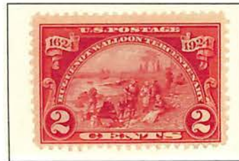
#615 Landing at Fort Orange