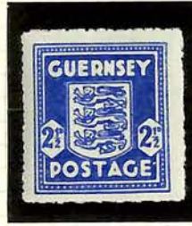
b NH EXPT