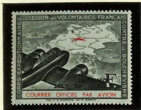
IV K NH 200