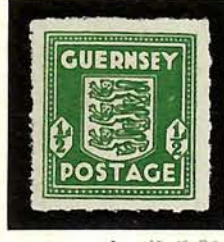
d HD EXPT