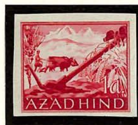
VIII-X B #