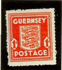
v NH EXPT