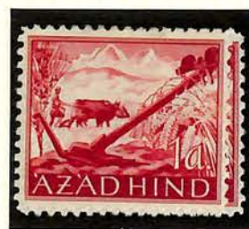
VIII-X A #