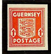
2 aU NH