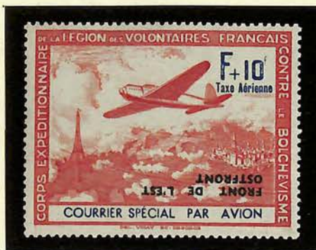
V K NH 200