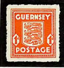
2 cv NH EXPT.