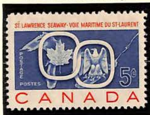
St. Lawrence Seaway