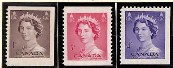
Imperf. x perf. 12