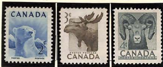
1953. National Wild Life Week