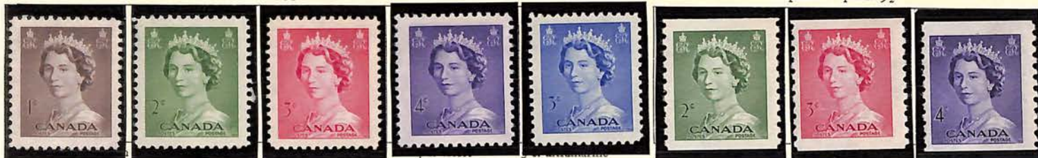
Imperf. x perf. 9½