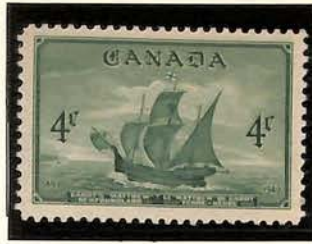
1949. Entry of Newfoundland into Canadian Confederation