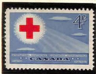
1952. Toronto Red Cross Conference