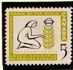
"Associated Country Women"