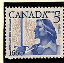
Battle of the Long Sault