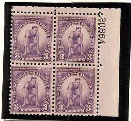
Runner at Starting Mark