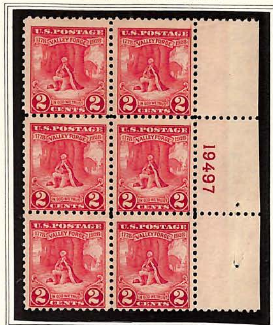
Washington at Prayer

To commemorate the 150th anniversary of the encampment of Washington's army at Valley Forge during the bitter winter of 1777-78. First placed on sale May 26, 1928.