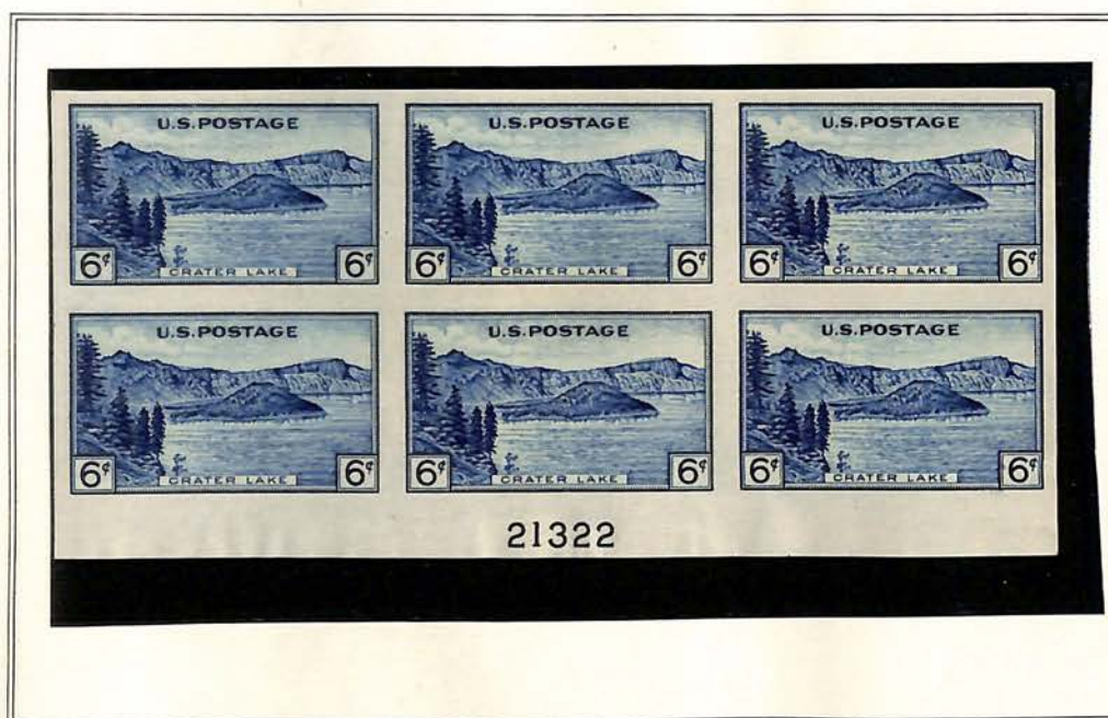
Crater Lake (Oregon)