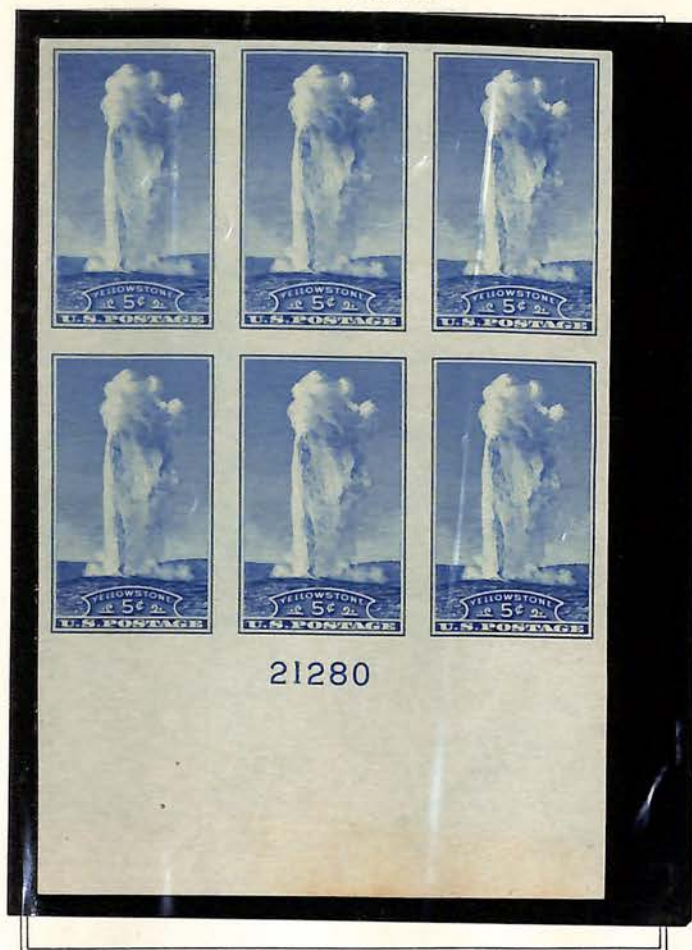
Old Faithful, Yellowstone (Wyoming)