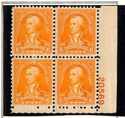
Washington at the age of 60