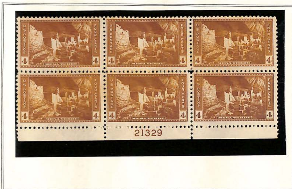
The Cliff Palace, Mesa Verde (Colorado)