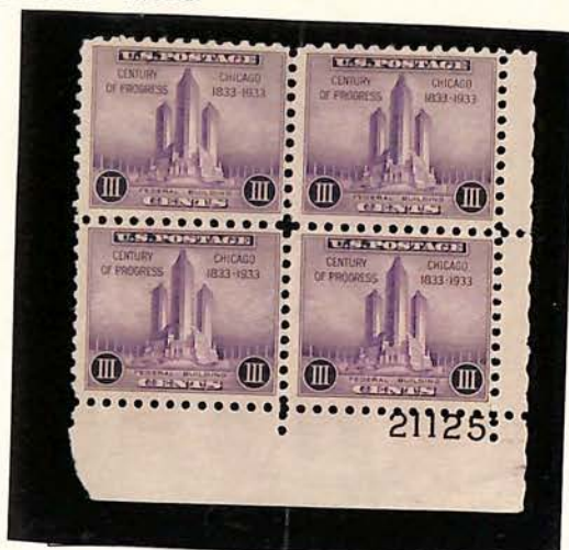
The Federal Building

In commemoration of the Century of Progress International Exposition held in Chicago, Ill., beginning June 1, 1933. First placed on sale May 25, 1933 at Chicago, Ill.