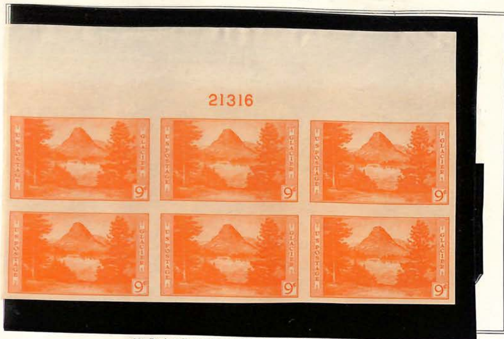
Mt. Rockwell and Two Medicine Lake, Glacier (Montana)