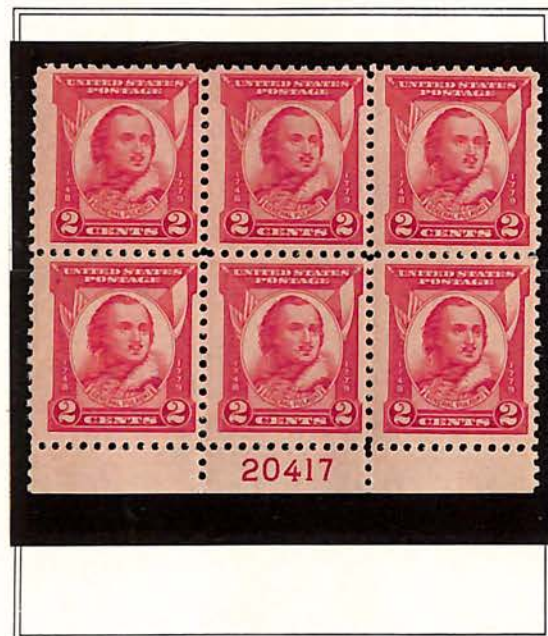
General Casimir Pulaski

To commemorate the 175th anniversary of the Battle of Braddock's Field. The stamp shows George Washington in the uniform of a British officer while serving under General Braddock.