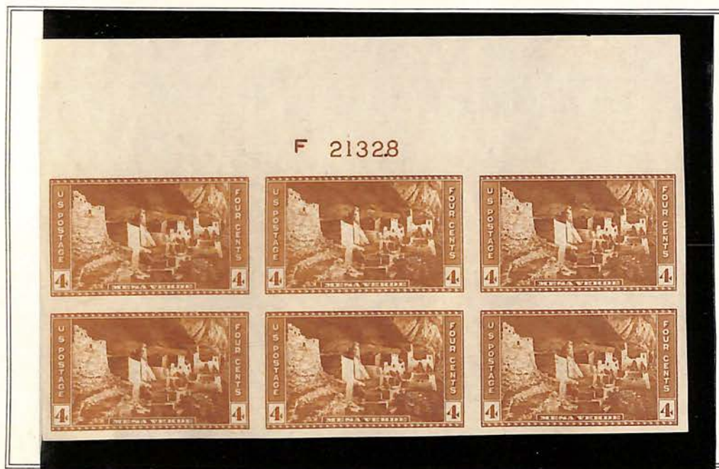
The Cliff Palace, Mesa Verde (Colorado)