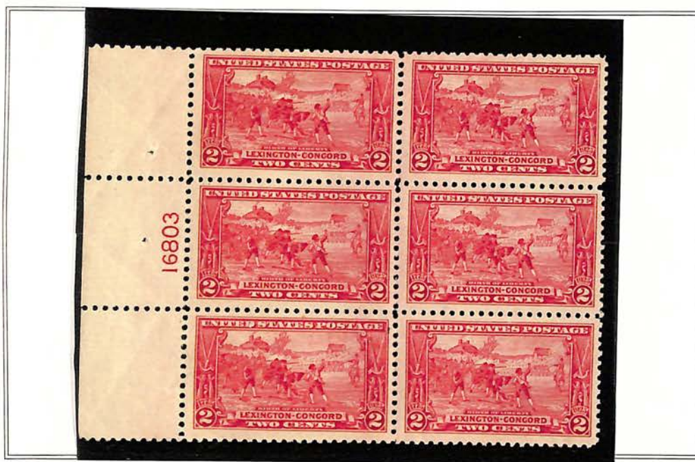
Battle of Lexington

First placed on sale April 4, 1925, The Lexington-Concord Issue commemorated the 150th anniversary of the first armed conflicts of the American Revolution on April 19, 1775.