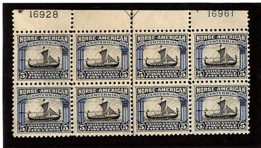
Viking Ship. Built in Norway, presented to Field Columbian Museum, Chicago

First placed on sale May 18, 1925, The Norse-American Issue commemorated the 100th anniversary of the first Norwegian immigrants' arrival on the sloop Restaurationen on October 9, 1825.