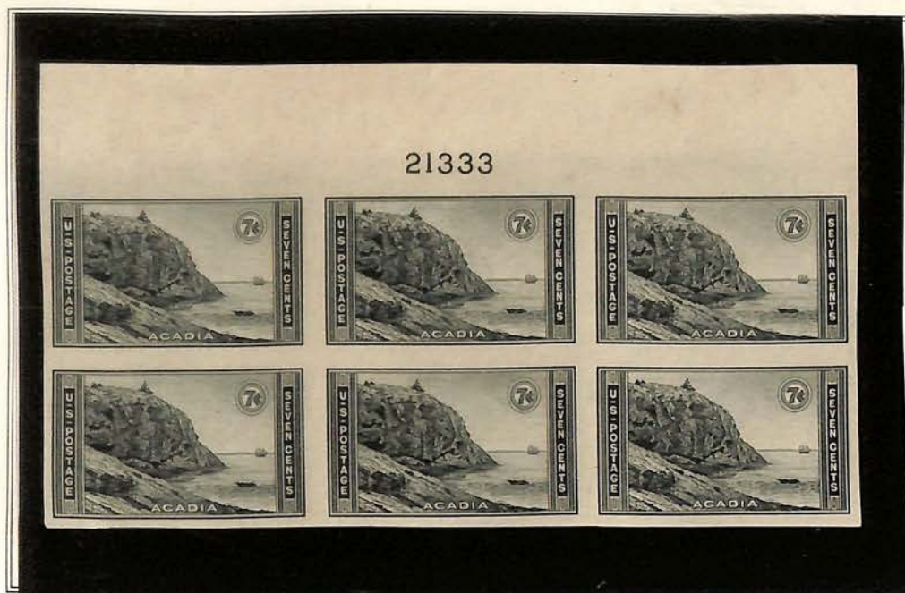
Great Head, Acadia (Maine)