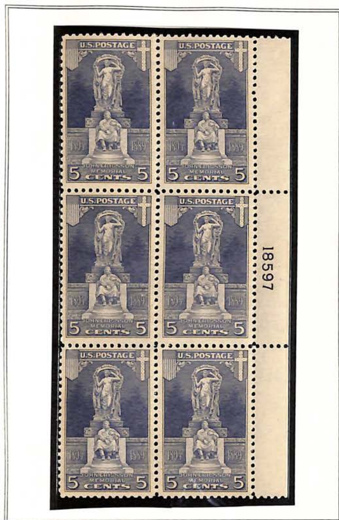
Statue of John Ericsson

Issued in connection with the unveiling of a statue erected at Washington, D. C., in honor of John Ericsson, Swedish born engineer, builder of the Monitor , which engaged the Confederate vessel Merrimac during the Civil War.