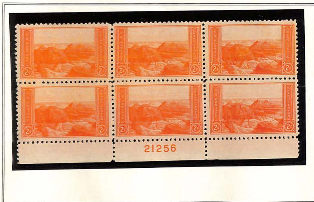
Grand Canyon (Arizona)

Special issue picturing views of our National Parks in compliment to observance of 1934 as "National Parks Year." First placed on sale at various dates in 1934 at the post office in the park pictured and simultaneously at Washington, D. C.