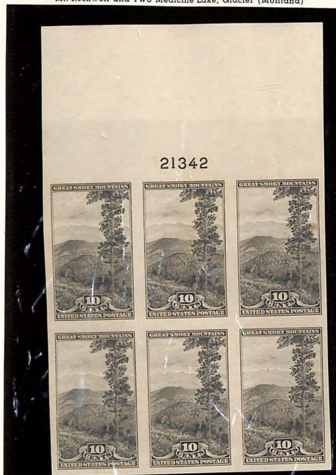
Great Smoky Mountains (North Carolina)