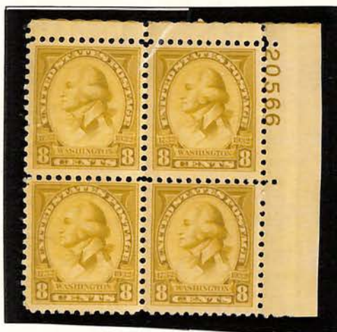
Washington at the age of 66