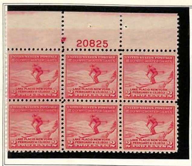
A Ski Jumper

Issued in honor of the Third International Winter Olympic Games, held at Lake Placid, N. Y., in February, 1932. First placed on sale January 25, 1932 at Lake Placid, N. Y.