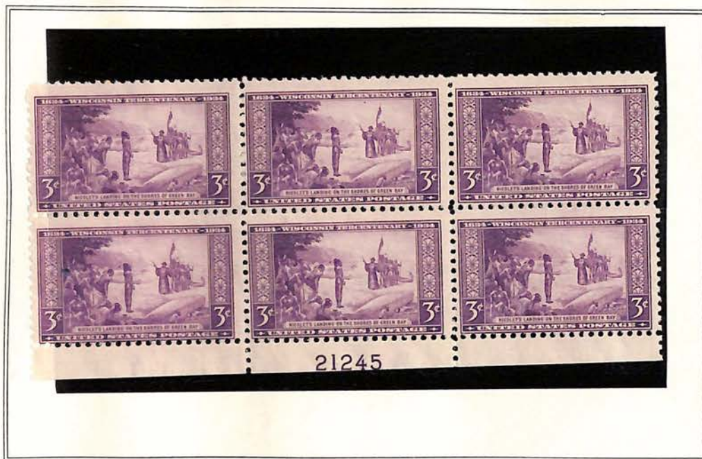
Nicolet's Landing on Shores of Green Bay

To commemorate the 300th anniversary of the arrival of Jean Nicolet on the shores of Green Bay. First placed on sale July 7, 1934 at Green Bay, Wis.