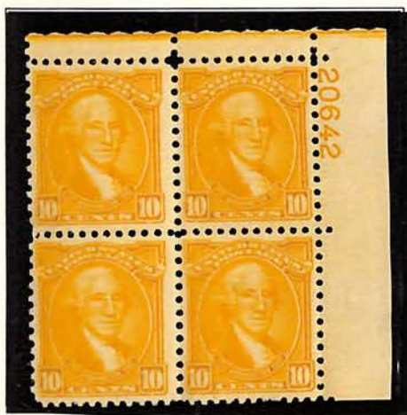
Washington at the age of 63