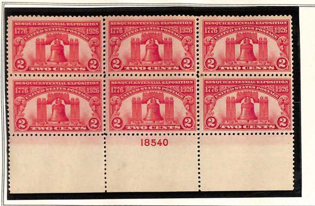
The Liberty Bell

Issued in connection with the Sesqui-centennial Exposition held at Philadelphia, in 1926, to commemorate the 150th anniversary of American Independence. First placed on sale May 10, 1926.