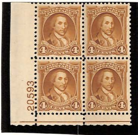
Washington at the age of 49