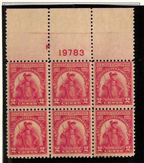
Major General Sullivan

To commemorate the 150th anniversary of the Sullivan expedition in New York State during the Revolutionary War. This campaign defeated the Iroquois Indians and improved conditions for the white settlers.