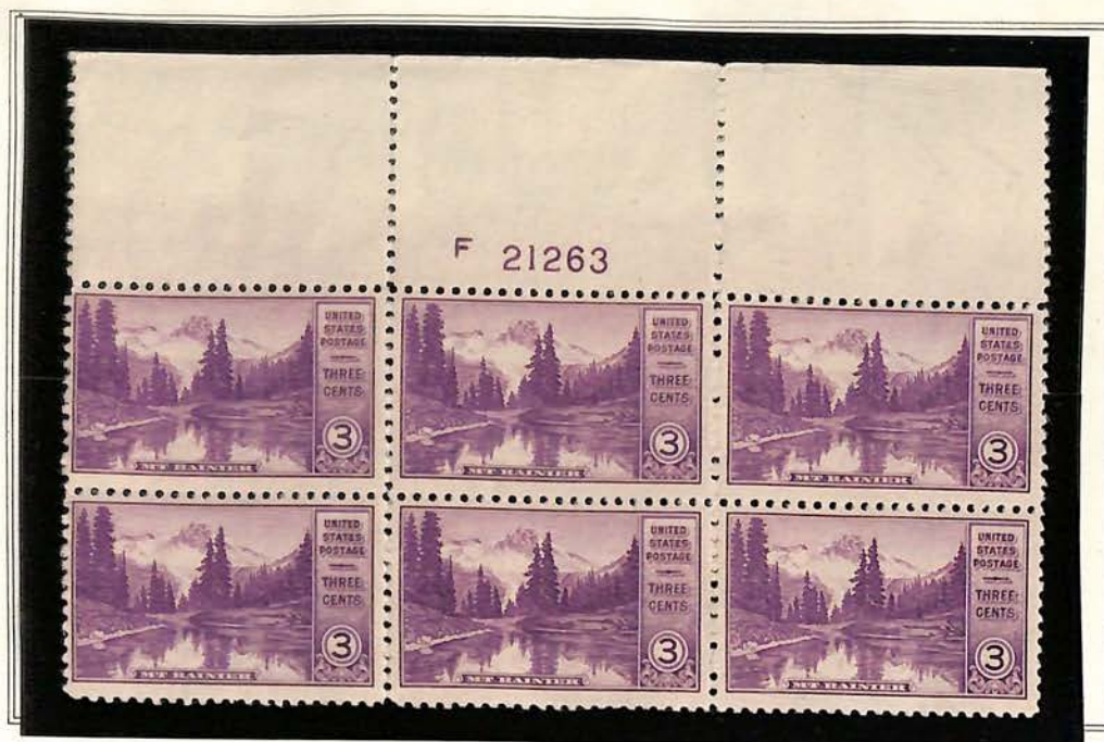
Mt. Rainier and Mirror Lake (Washington)