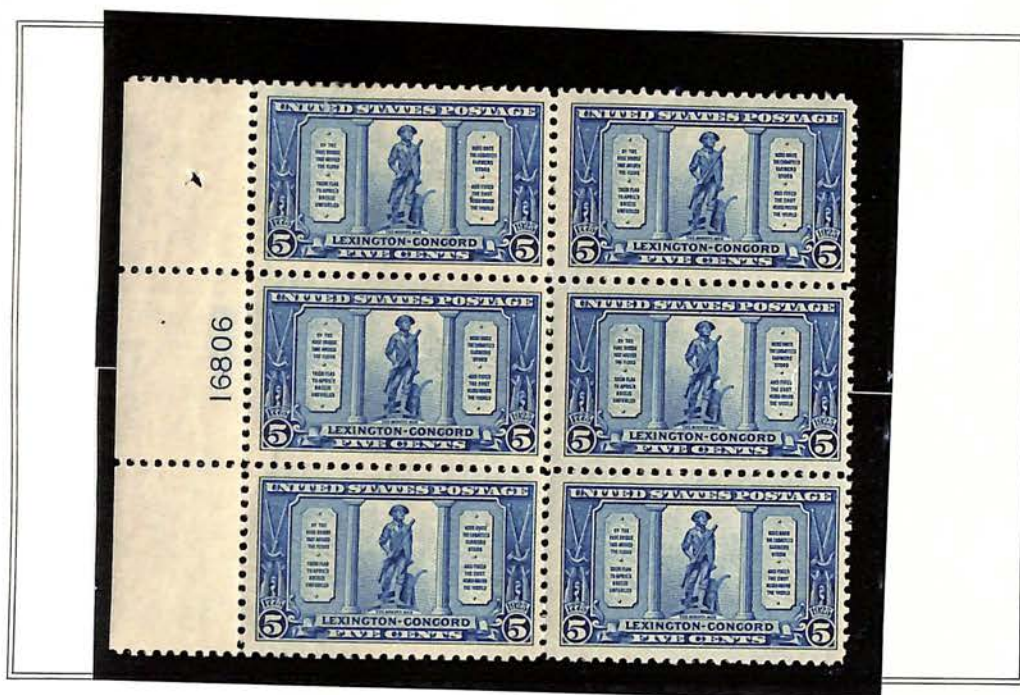
The Minute Man