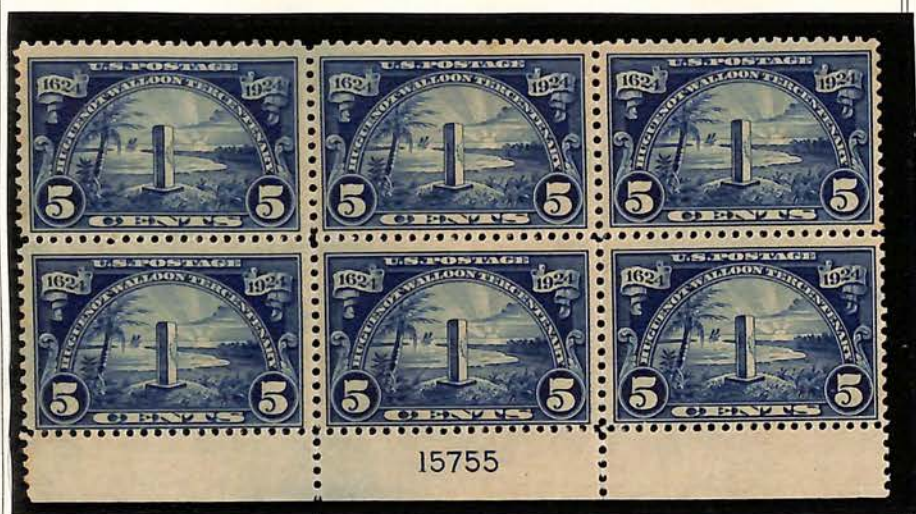
Monument to Huguenots at Mayport, Florida