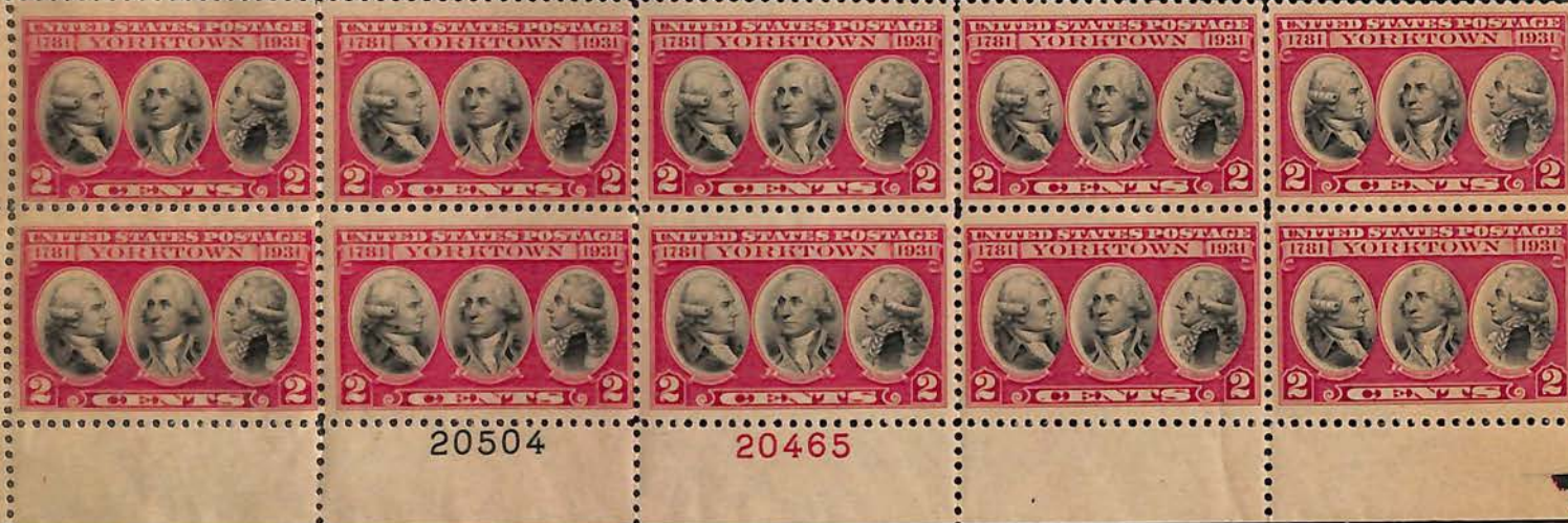
Rochambeau, Washington, De Grasse

Issued to commemorate the 150th anniversary of the Battle of Yorktown and the surrender of Cornwallis, this marked the end of the Revolutionary War.