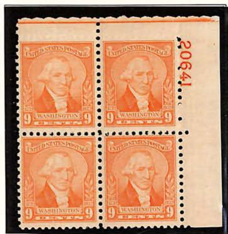
Washington at the age of 62