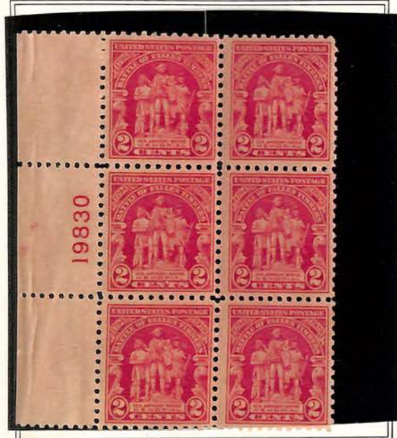
General Wayne Memorial

Issued in memory of Gen. Anthony Wayne and to commemorate the 135th anniversary of the Battle of Fallen Timbers. First placed on sale Sept. 14, 1929.