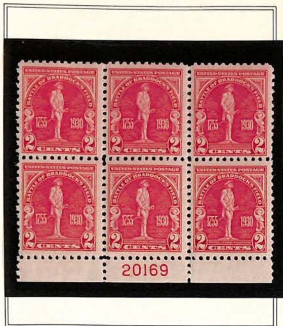
Statue of Colonel George Washington

To commemorate the 200th anniversary of the birth of General Von Steuben for his help to the Continental Army. A Prussian officer, he helped train the American soldiers.