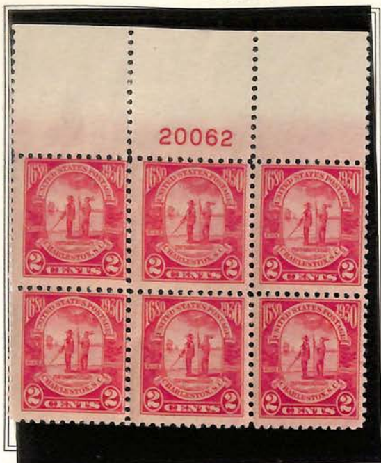
Colonial Governor and Indian

To commemorate the 260th anniversary of the founding of the Province of Carolina and the 250th anniversary of the establishment of the original settlement near the site of the present city of Charleston. First placed on sale April 10, 1930.