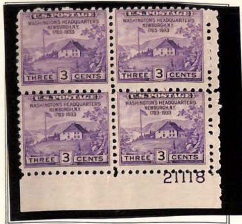
Washington's Headquarters at Newburg, N. Y.