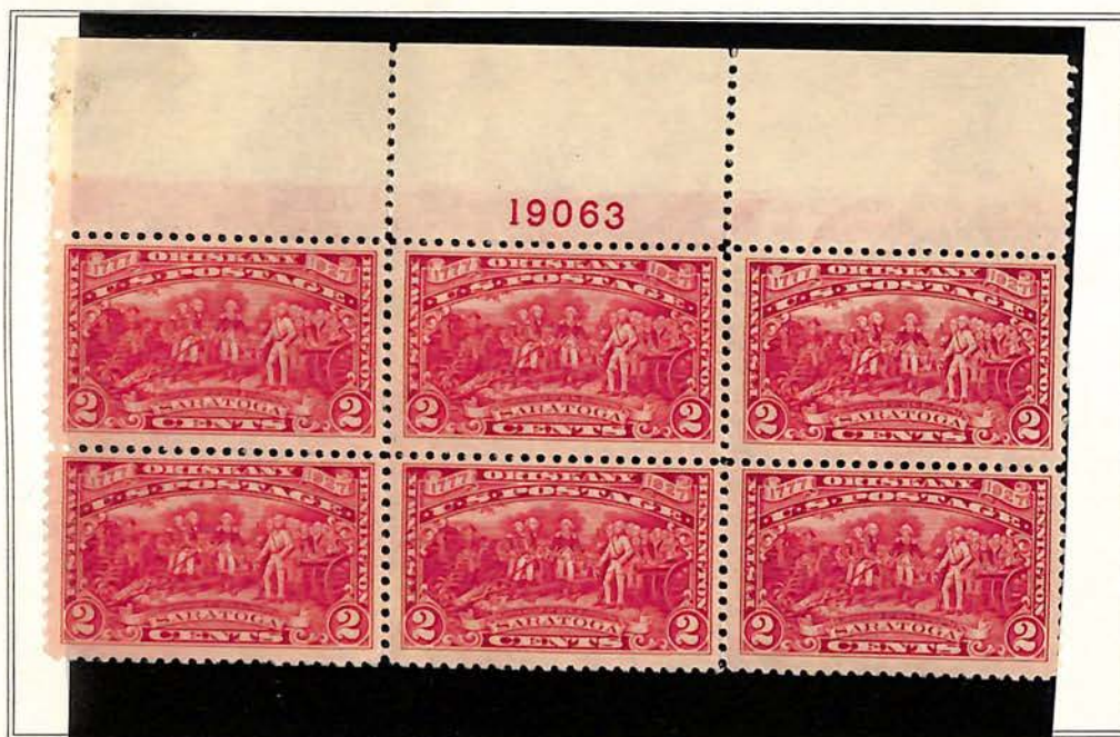
Surrender of Burgoyne

Commemorates the Battles of Fort Stanwix, Oriskany, Bennington and Saratoga. First placed on sale August 3, 1927.