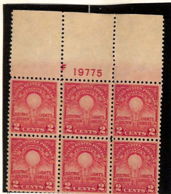
CM85-86, Edison's First Lamp