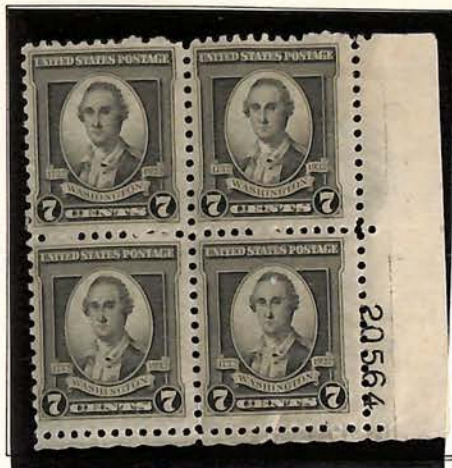
Washington at the age of 48