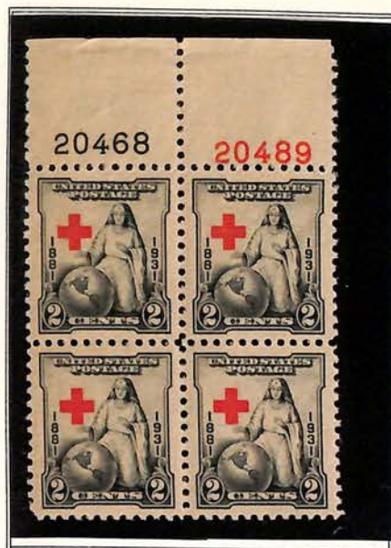
"The Greatest Mother"

To commemorate the 50th anniversary of the founding of the American Red Cross by Clara Barton who nursed the wounded during the Civil War.