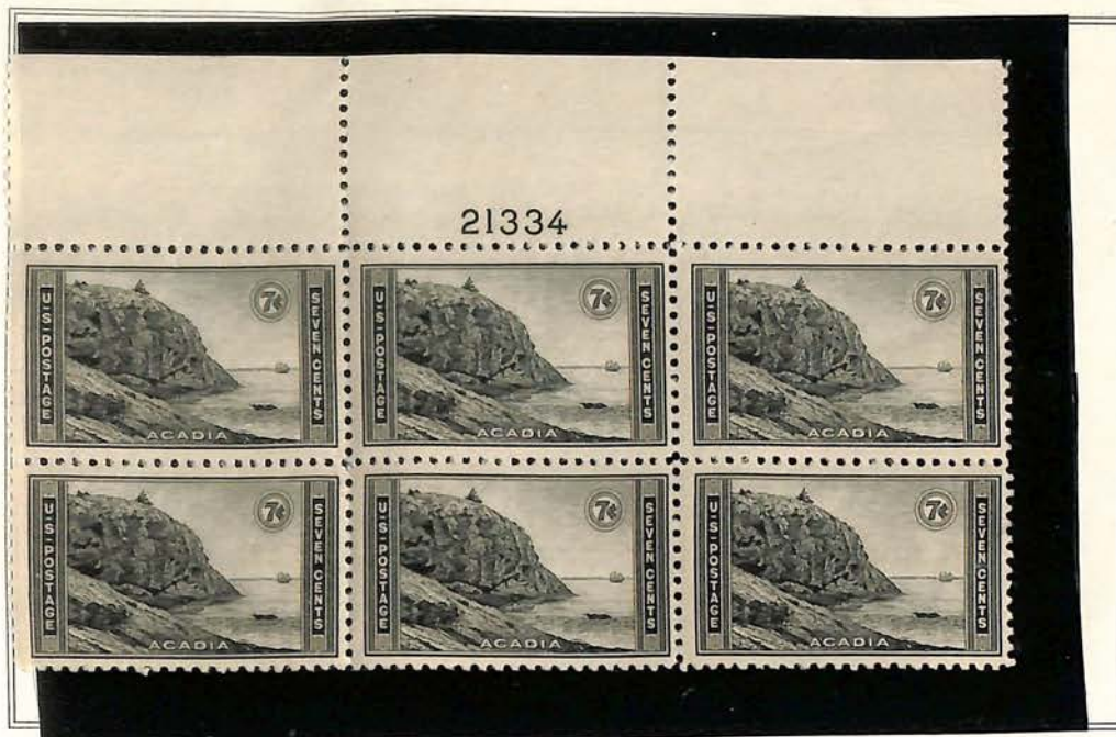
Great Head, Acadia (Maine)