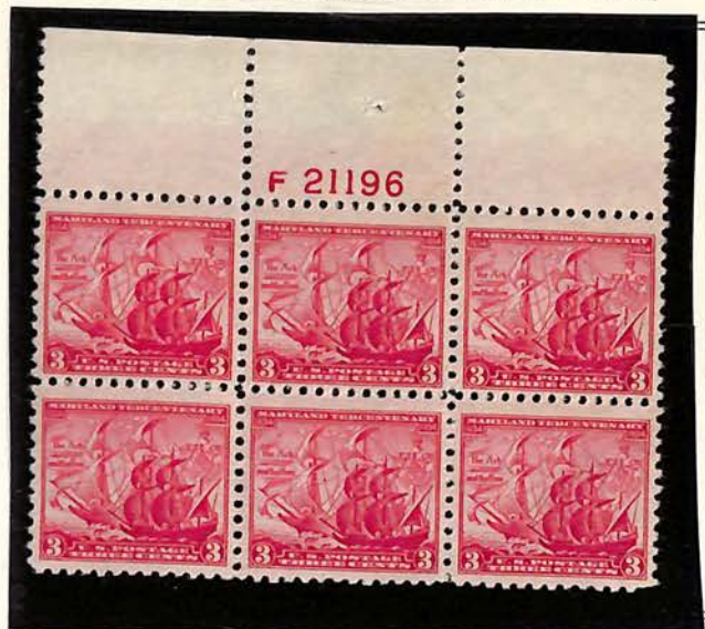
The "Ark" and the "Dove"

To commemorate the 300th anniversary of the settlement of Maryland by about 200 colonists under a charter held by Cecilus Calvert, second Lord Baltimore. He made the colony a haven of religious tolerance. The Ark and the Dove were sailing vessels used in the voyage to America.