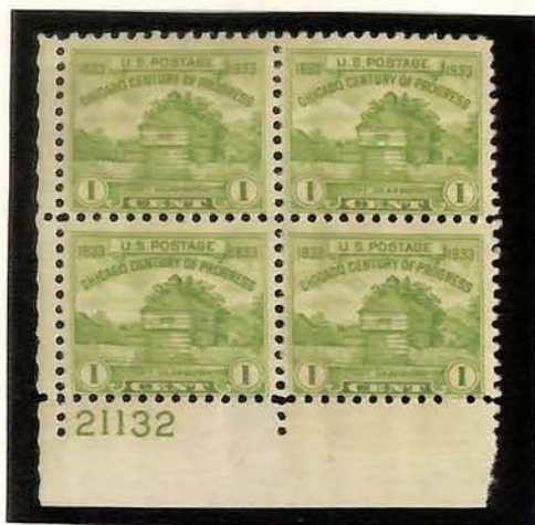
Reproduction of Fort Dearborn