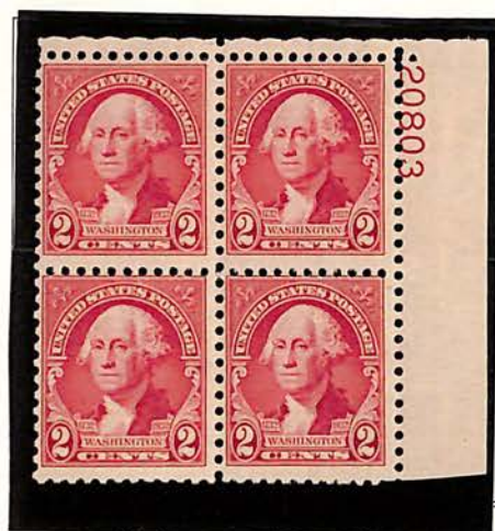
Washington at the age of 64

To commemorate the 200th anniversary of the birth of George Washington and issued in connection with the national celebration of this event. The designs are all portraits of Washington taken from famous paintings or drawings and show him at various periods of his life. First placed on sale January 1, 1932 at the post office in Washington, D. C.