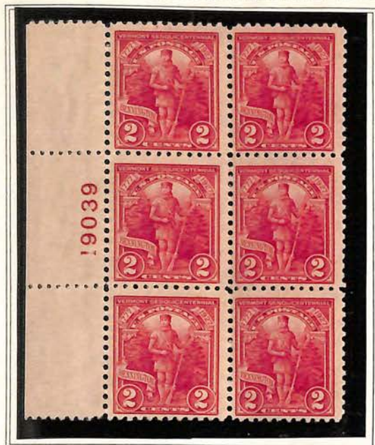
Green Mountain Boy

To commemorate the 150th anniversary of the independence of Vermont and the Battle of Bennington. First placed on sale August 3, 1927.