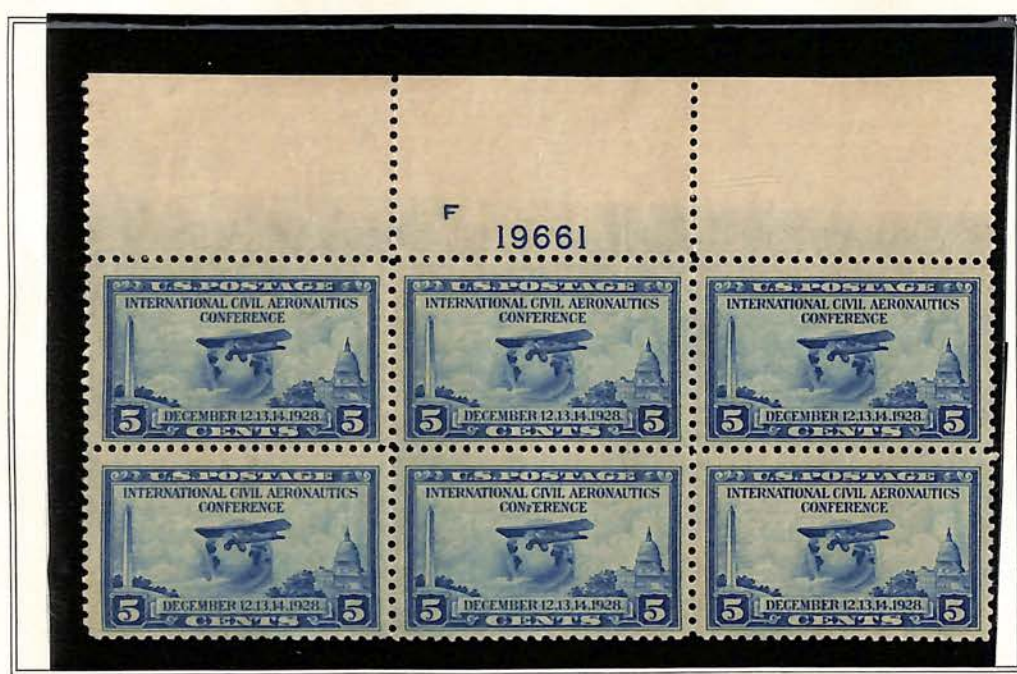
Monoplane and Globe

The Aeronautics Conference Issue, in connection with the International Civil Aeronautics Conference held December 12-14 in Washington, D. C., commemorated the 25th anniversary of the first airplane flight (December 17, 1903) by the Wright brothers at Kitty Hawk, N. C.