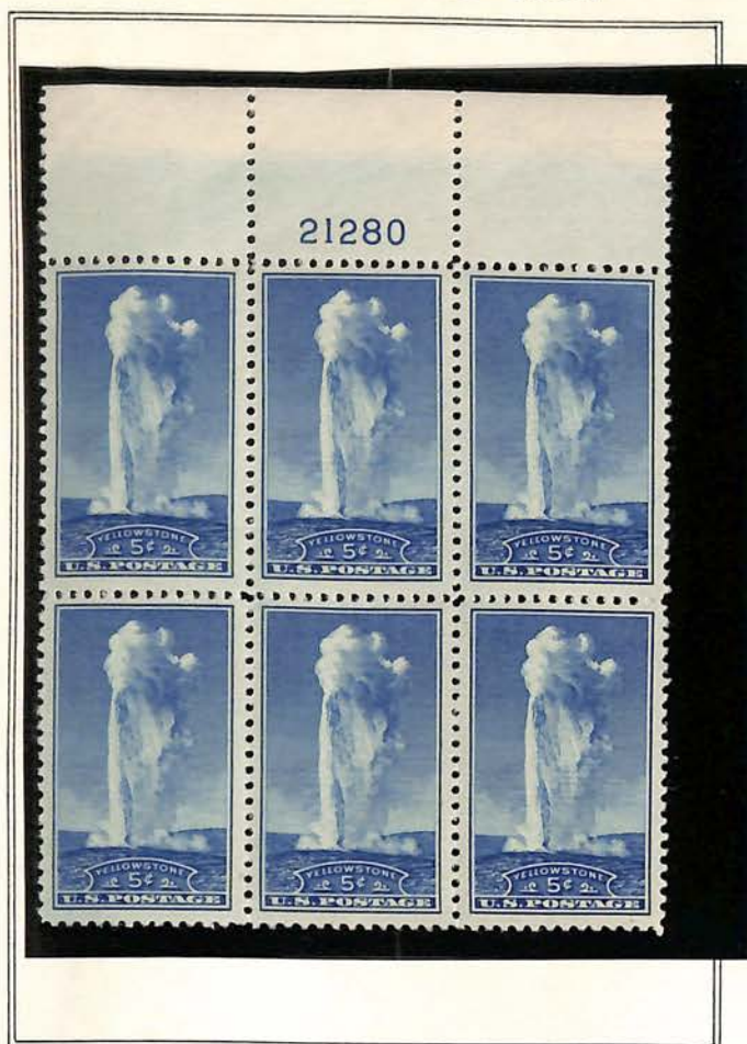
Old Faithful, Yellowstone (Wyoming)