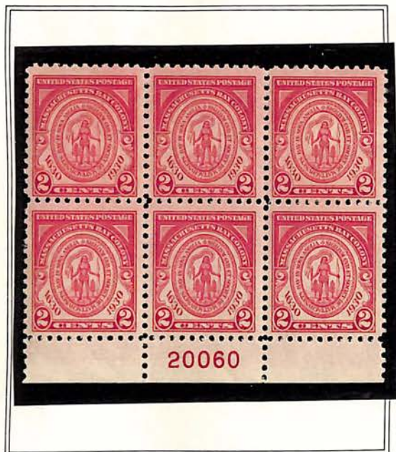
Seal of the Colony

To commemorate the 300th anniversary of the founding of the Massachusetts Bay Colony by the Puritans who came to the New World to escape religious and political persecution.