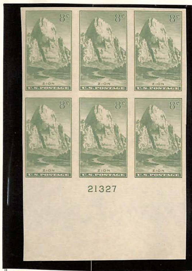
Great White Throne, Zion (Utah)