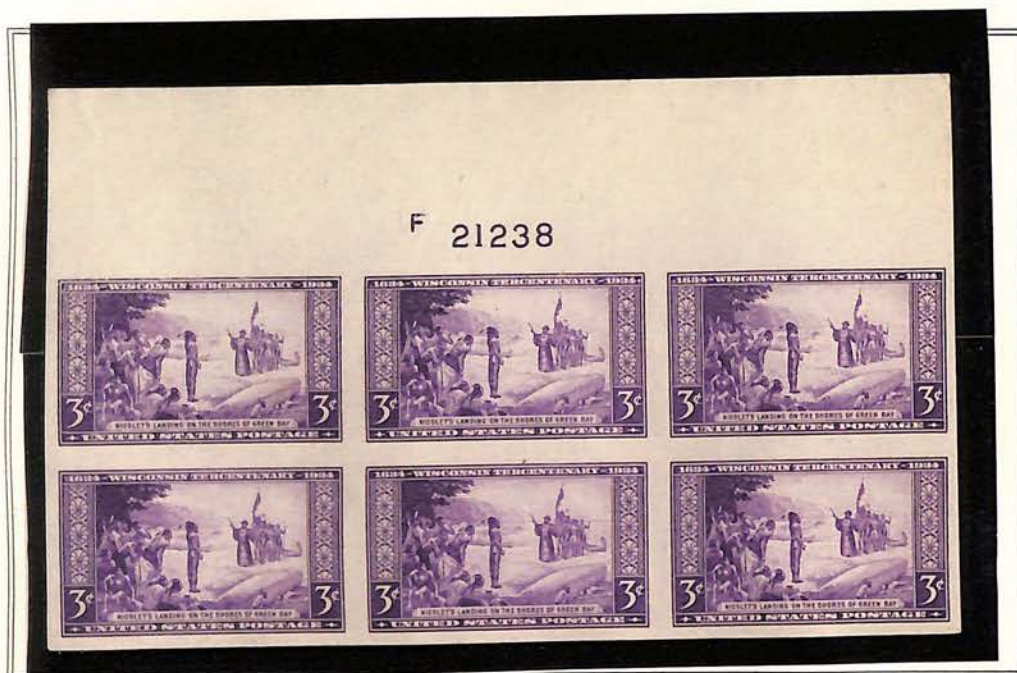
Nicolet's Landing on Shores of Green Bay