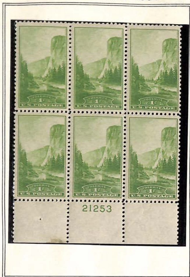
El Capitan, Yosemite (California)