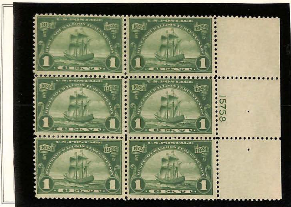
The New Netherlands