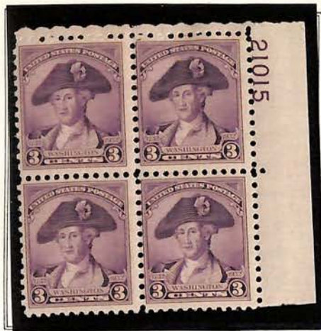
Washington at the age of 46