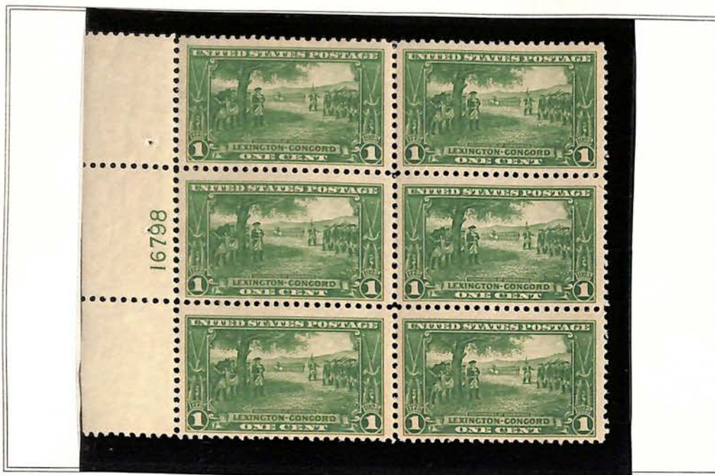
Washington at Cambridge