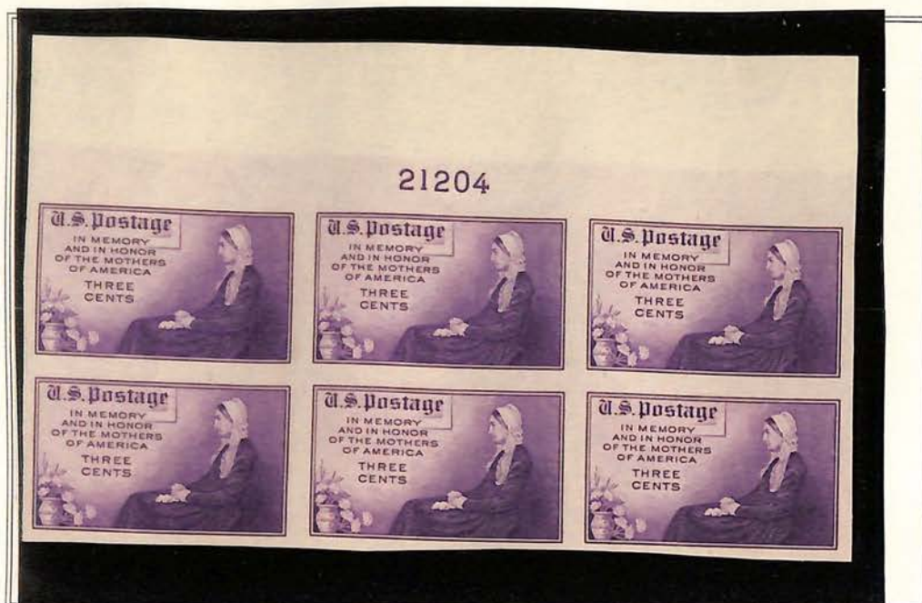
From Whistler's "Portrait of My Mother"