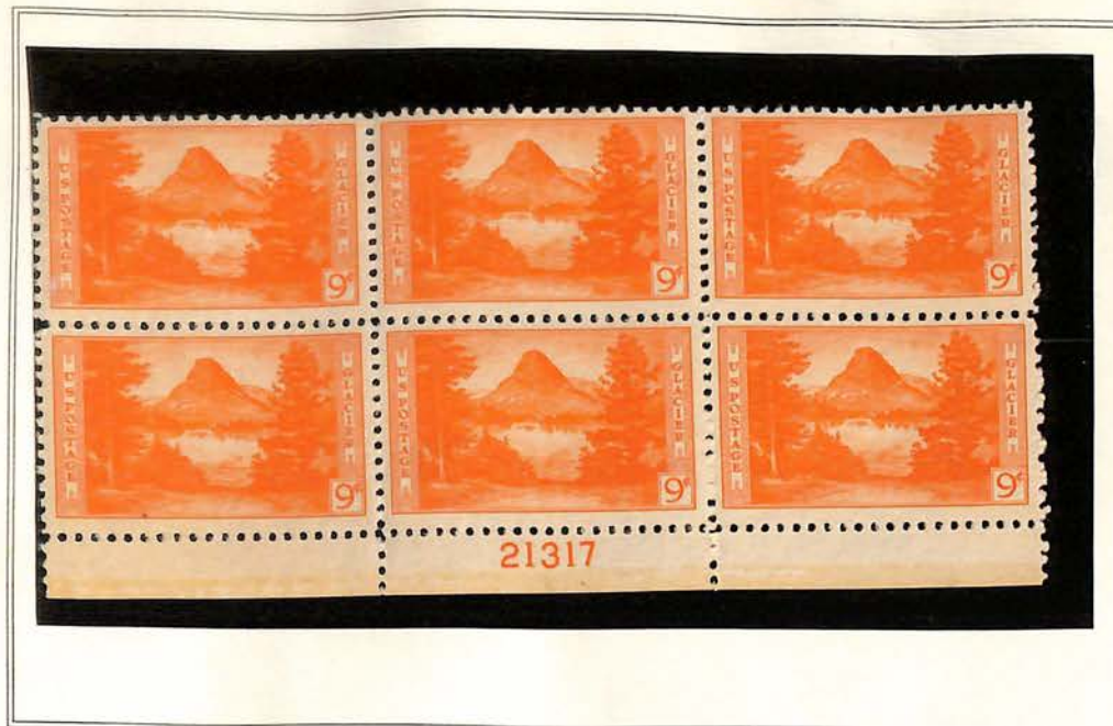
Mt. Rockwell and Two Medicine Lake, Glacier (Montana)