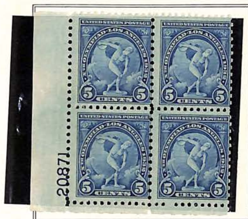
The Statue of "Discobolos"

Issued in recognition of the tenth Olympiad, held at Los Angeles, Calif., from July 30 to August 14, 1932. First placed on sale June 15, 1932 at Los Angeles, Calif.