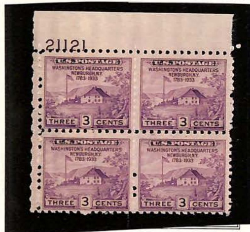
Washington's Headquarters at Newburgh, N. Y.

To commemorate the 150th anniversary of the issuance, by General Washington, of the official order proclaiming peace, which marked the end of the war for independence. First placed on sale April 19, 1933 at Newburgh, N. Y.