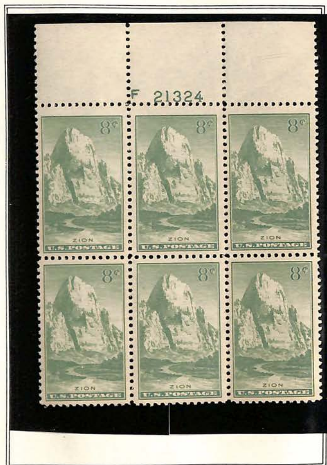
Great White Throne, Zion (Utah)