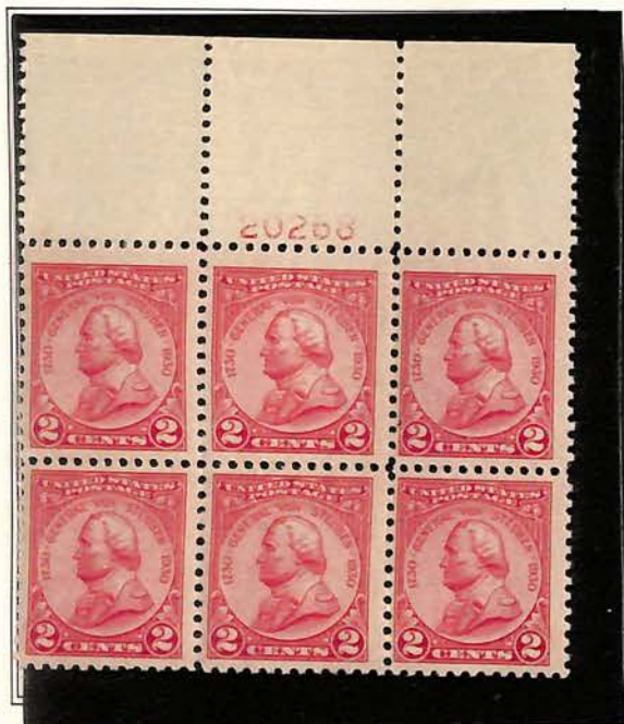
Bust of General Von Steuben

To commemorate the 260th anniversary of the founding of the Province of Carolina and the 250th anniversary of the establishment of the original settlement near the site of the present city of Charleston. First placed on sale April 10, 1930.