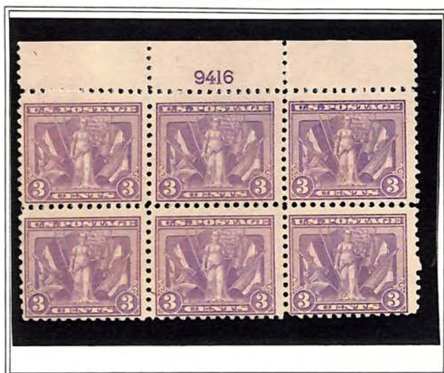
"Victory" and Flags of the Allies

Issued on March 3, 1919 to commemorate the successful conclusion of World War I. The design shows "Victory" and the United States flag flanked by the flags of Great Britain, Belgium, Italy and France.