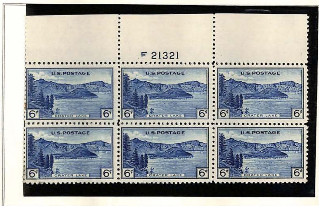
Crater Lake (Oregon)