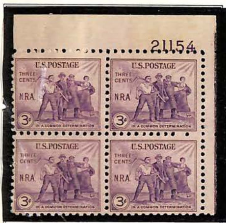
Workers Marching Forward

Issued in connection with the national emergency and to arouse support for the National Recovery Act. First placed on sale August 15, 1933 at Washington, D. C.