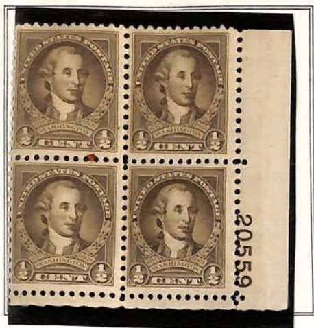
Washington at the age of 45