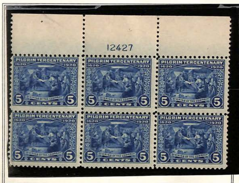
Signing the Compact

The Pilgrim Tercentenary Issue commemorated the 300th anniversary of the landing of the Pilgrims at Plymouth, Massachusetts, in December 1620. Of the Mayflower's 102 passengers, 41 Pilgrim "Fathers" signed en route a compact, in which they pledged themselves to adhere to the principles of self-government in the Colony.