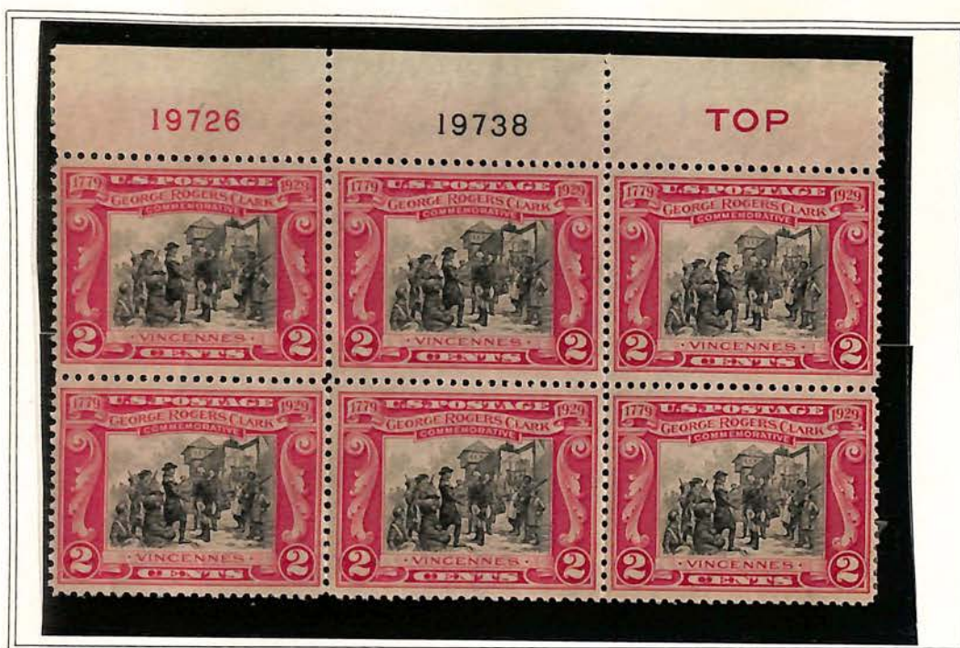
Surrender at Fort Sackville

Issued to commemorate the 150th anniversary of the surrender of Fort Sackville near the present site of Vincennes, Ind. This stamp honors the great explorer who helped win the Northwest Territory to the American side.