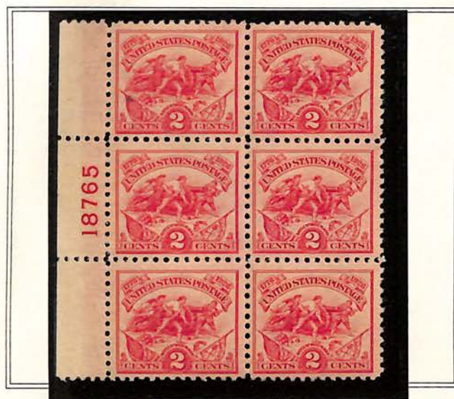
Alexander Hamilton's Battery

Issued in connection with the Sesqui-centennial Exposition held at Philadelphia, in 1926, to commemorate the 150th anniversary of American Independence. First placed on sale May 10, 1926.