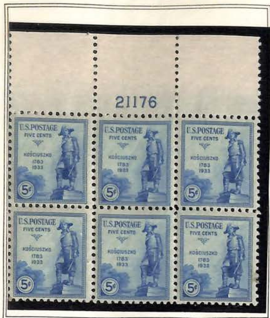
Statue of Gen. Thaddeus Kosciuszko

In honor of General Thaddeus Kosciuszko and to commemorate the 150th anniversary of his naturalization as an American citizen. He fought throughout the Revolutionary War and helped plan the fortification of West Point.