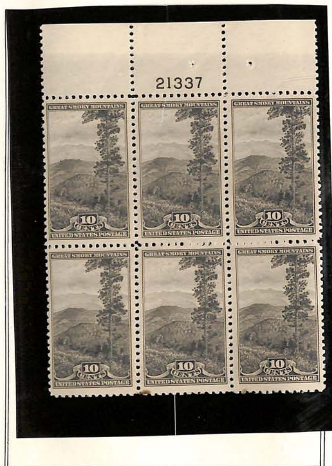
Great Smoky Mountains (North Carolina)