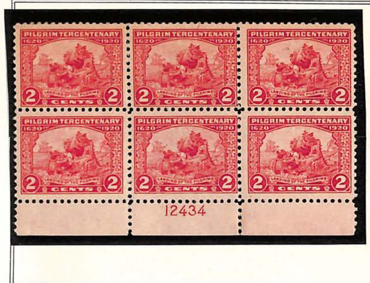
Landing of the Pilgrims