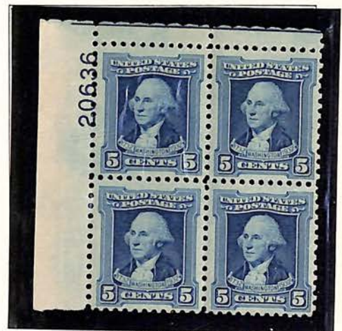
Washington at the age of 53