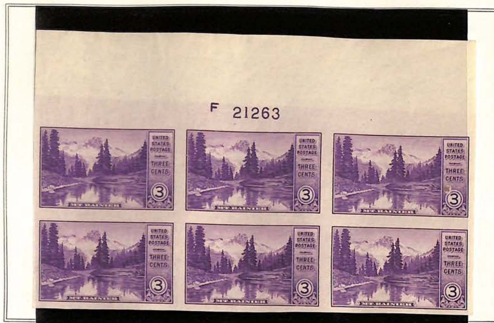
Mt. Rainier and Mirror Lake (Washington)