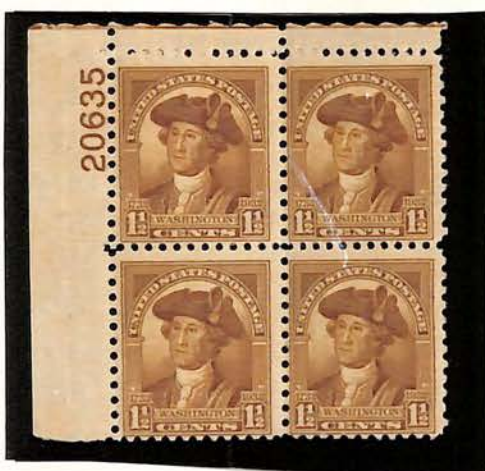
Washington as Colonel of the Virginia Militia at the age of 40