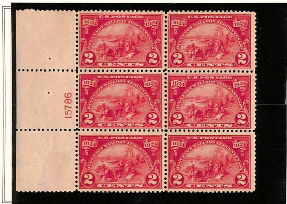
Landing of Walloons at Fort Orange.

Issued to commemorate the 300th anniversary of the settling of the Walloons in New Netherlands, now the State of New York, and the restoration of a monument to earlier Huguenot settlements in the South. First placed on sale on May 1, 1924.