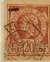
Fournier Sc #6