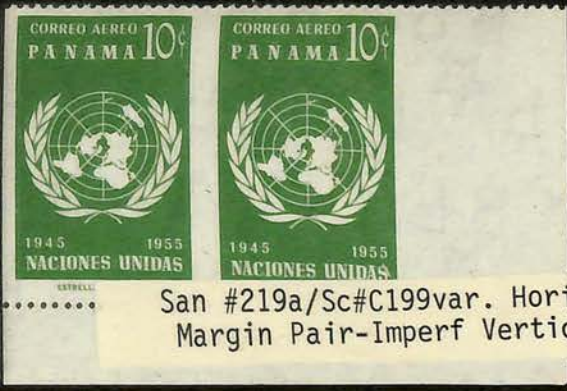
San #219a/Sc#C199var. Horizontal Margin Pair-Imperf Vertically