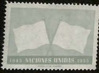
Scott #C202var. Sanabria #222 unlisted Perforated-Red and Blue colors completely omitted