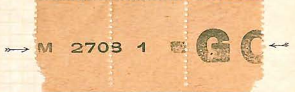
Plate No. & imprint; "G.C." Grande Consommation paper.