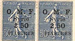
2.50 close together