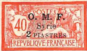
"Pi" raised, "5" broken