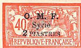
"Pi" and last "5" broken