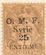
Broken 4c "Centiemes"