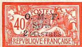
Closed "e" in Syrie