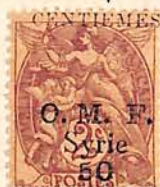
Misplaced surch. "Centiemes"