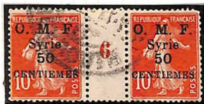
figure '50' displaced sharply to the right and the left, under 'S' and under 'r'

millesime pair (unusual in used condition)