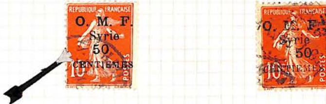
figure '1' displaced 1 mm to right of normal position

figure '50' displaced sharply to the right and the left, under 'S' and under 'r'