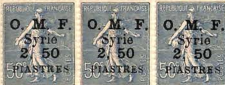
Middle stamp inverted "5"