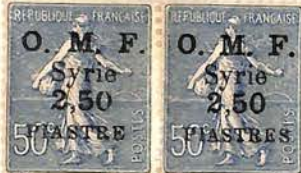
"Piastre" no "5"