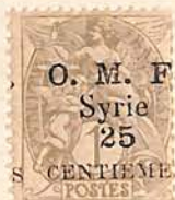
Misplaced surcharge "Centiemes"