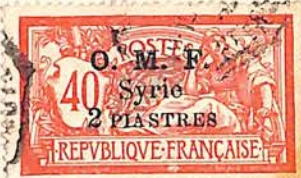
Violet & ultramarine