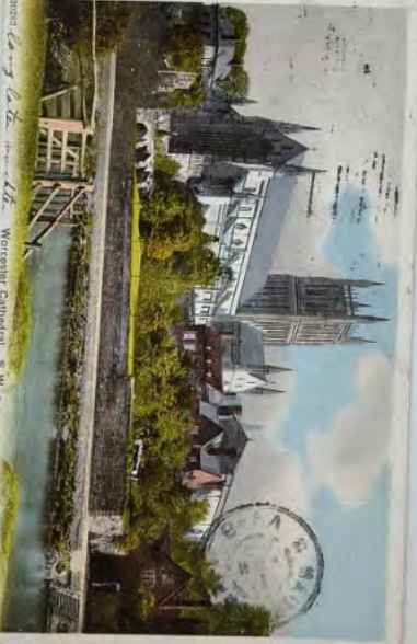
Worcester Cathedral, S. W. Mass. Copyright 1922