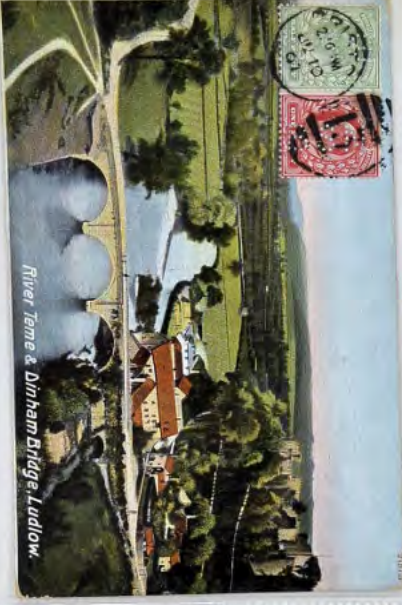
River Tame & Dinham Bridges, Ludlow.