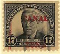
17c Wilson with similar work-up from top row of LL pane