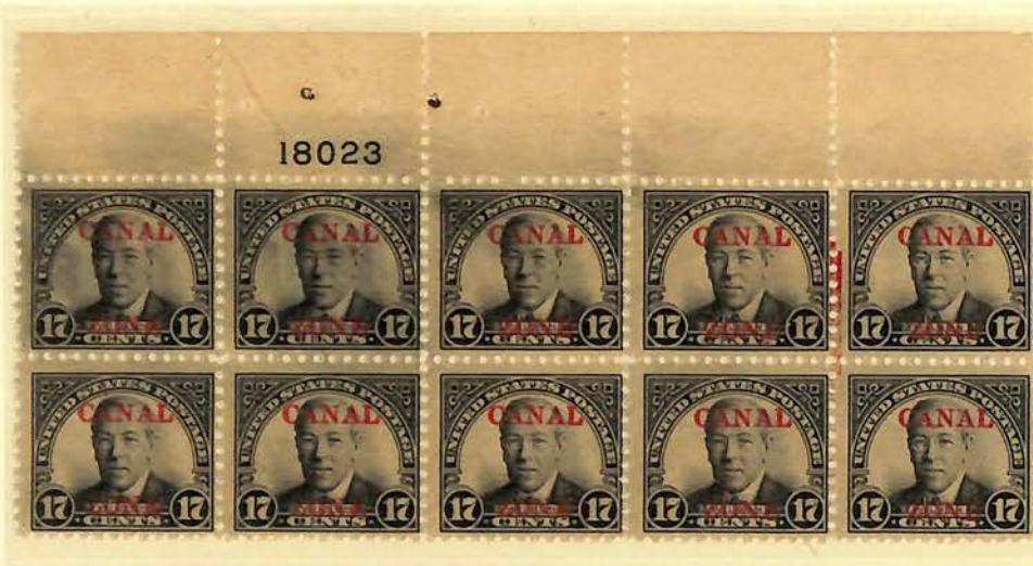
17c Wilson with vertical work-up on pos. UL 9 and 19