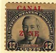
17c Wilson with horizontal work-up