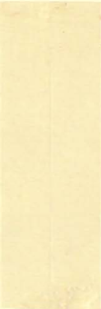
Pair, one without overprint, on 2c American Bank Note issue of 1909