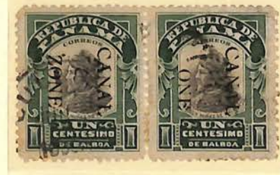
Example of overprint variety with missing Z in ZONE on the 1c Hamilton Bank Note issue