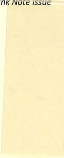
Pair, one without overprint, on 10c American Bank Note Issue of 1909