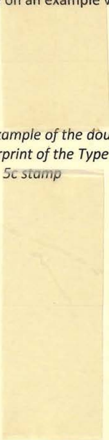
L/E example of the double overprint of the Type I 5c stamp