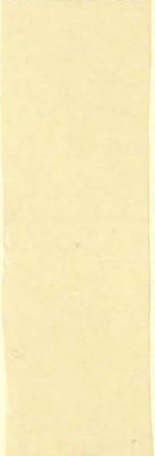
Pair one, without overprint, on the 8c type I stamp