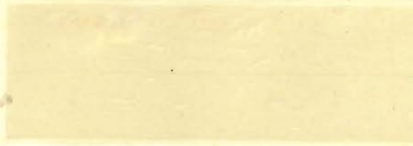
17c Wilson with CANAL in the CANAL ZONE overprint shifted significantly to the left

While misfeeding of paper into the press can shift the overprint on the entire pane of stamps to produce split overprints and CANAL only, ZONE only, and ZONE CANAL varieties, a shift of one of the slugs within the overprint form can produce changes in alignment of the CANAL and ZONE impressions. In an extreme case, a shift of one word of the overprint caused it to lie partially off the stamp. This is very unusual, and only one example shown below exists on U.S. stamps overprinted by the BEP. On this stamp the CANAL on position 4 LL is shifted between 7 1/4 and 8 mm to the left.