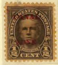
1/2c Hale stamp with horizontal work-up above CANAL