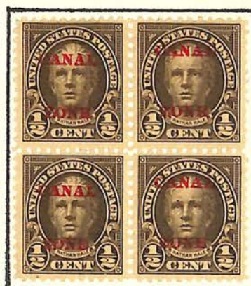
Left pair 7 3/4 spacing, right pair 9½MM