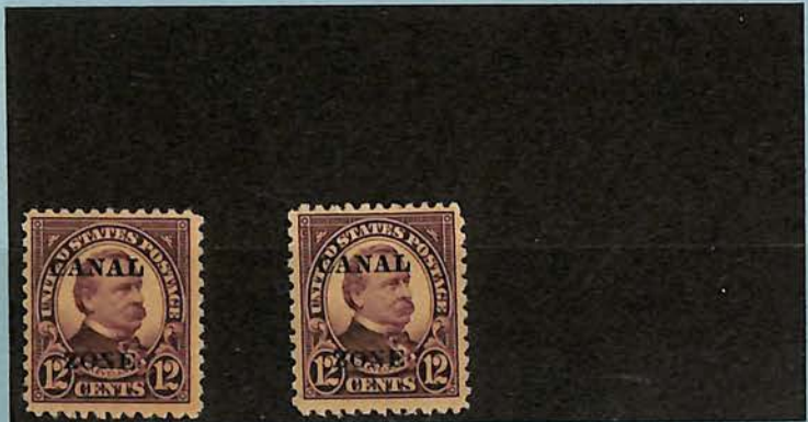
Style No. GK 102BK

in Cleveland - collar - hair (?) UNIT outer frame (?) CZ #76 CHOICE + FRESH MH Price 40-