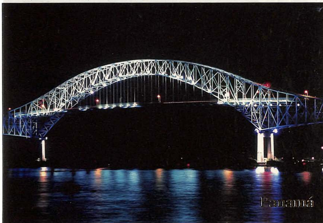
Thatcher Ferry Bridge as it appears today

This year celebrates the 100 th Anniversary of the opening of the Panama Canal in 1914. The final period of Canal Zone stamps includes both the 25 th and 50 th Anniversary series, as well as the 4c Thatcher Bridge stamp issued in 1962; an example of the missing bridge error on this stamp is included in the exhibit.