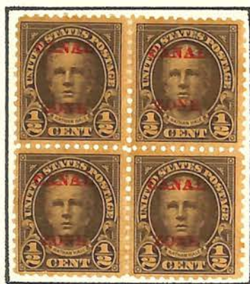
Normal 9½MM spacing between "Canal" & "Zone"