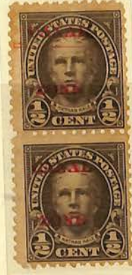
1/2c Hale stamp with horizontal work-up below CANAL on top stamp