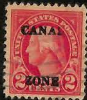
Plate # single on stamp