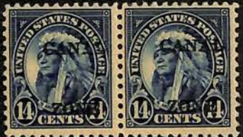
Style No. GK 102BK

89 VAR MINT FVF NH FAIR ONE WITH "BROKEN AL" 60.00