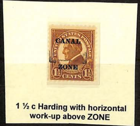
1 1/2 c Harding with horizontal work-up above ZONE