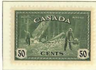
Lumbering in B. C.