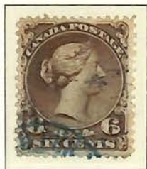
brown (shades) 27