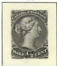
black 21 a