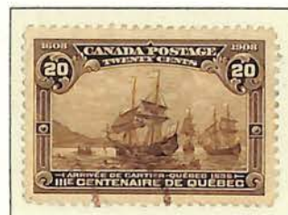
Cartier's Arrival before Quebec in 1535