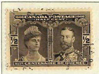
Prince and Princess of Wales (later George V. and Queen Mary)