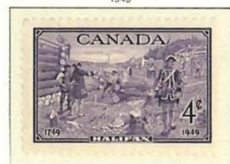
Halifax founded in 1749