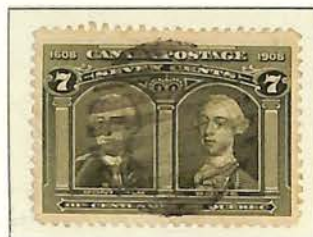
Opposing Commanders in 1759 Quebec Battle L. J. de Montcalm (French) & J. Wolfe (Engl.)