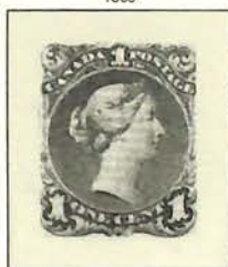
yellow orange 23