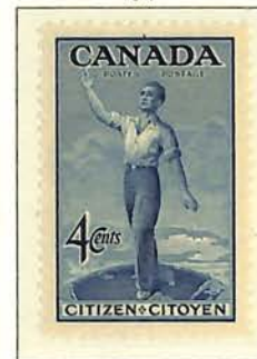
Advent of Canadian Citizenship