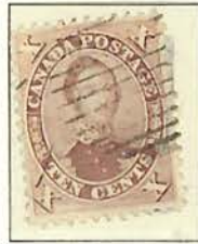
black brown 17a