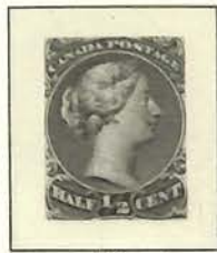
black 21 vic

OTTAWA Printings — Perf. 12 and 11½ × 12 Dent. — Impressions OTTAWA