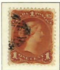
brown red 22 i