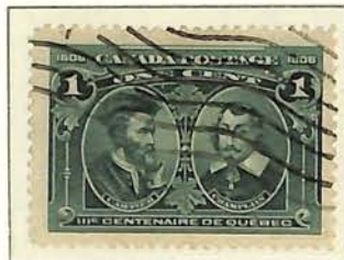
Cartier (1491/1557) & Champlain (1570/1635), founder of Quebec in 1608