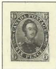
reddish purple (very thick soft paper) 10