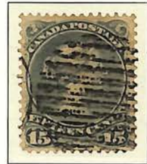
gray violet 29 c

Unwatermarked Perf. 12 Dent. 1875 (Montreal)