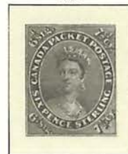
$100 green 9