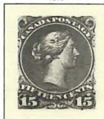
greenish gray (slate) 30 a