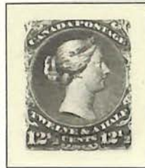
blue 28 b