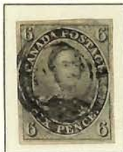
slate gray $550 10/114 5