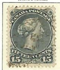
gray (shades) 30 D