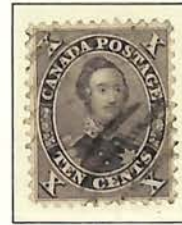
red lilac 17c