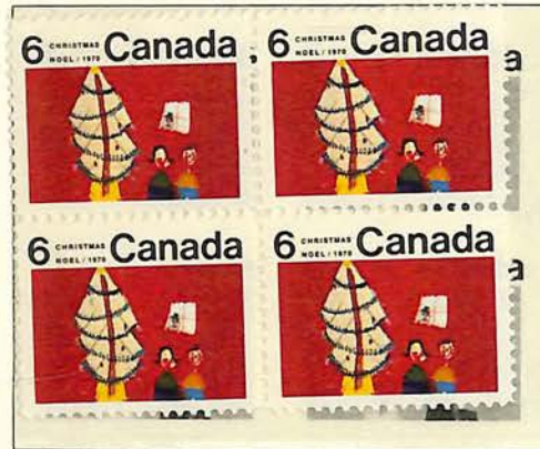
Sc. 525/SG 669 — Center Block of 4