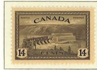
St. Maurice River Power Station