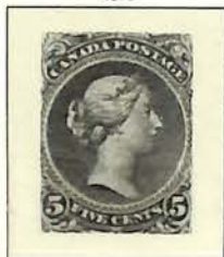
olive green 26