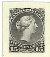
gray violet 29