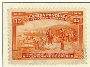
Champlain's Departure for the West (1609)