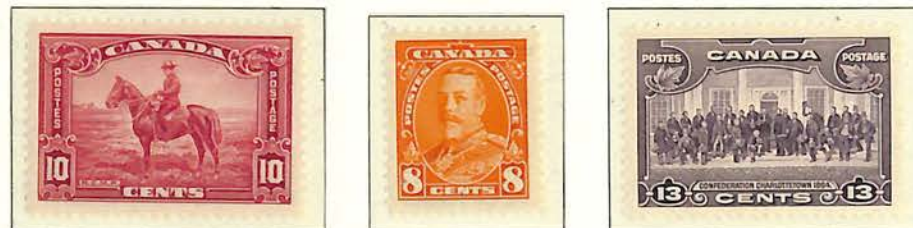
Royal Canadian Mounted Police