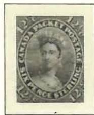
yellow green 18