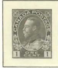
165 green 123