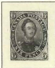
slate violet 2