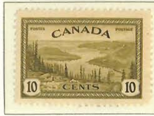
Great Bear Lake