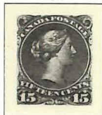
gray purple (shades) 29 a