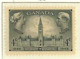
100 years Responsible Government