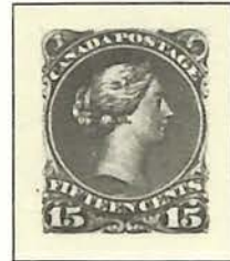
Sc. 30d/CNS 26o/SG 72a 30 d

"PIRIE" Script Wmk. Perf. 11½ × 12 Dent. 1876 (Montreal)