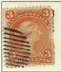
red 25 b