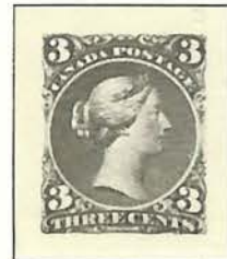
bright red 33