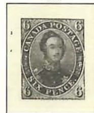
brown violet 12