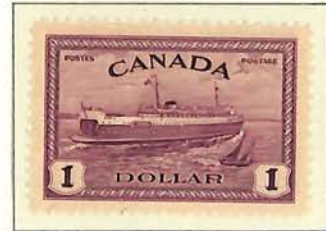
Ferry between N. B. and P. E. I.