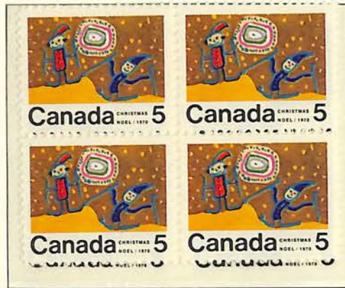
Sc. 522/SG 664 — Center Block of 4