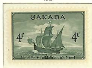
1949 N. F. enters Confederation