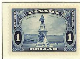
Champlain Monument, Quebec

This is the first set with year of issue hidden in the stamp's design