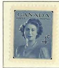
Marriage in 1947 to Lt. Philip Mountbatten