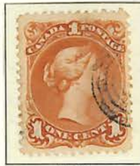
brown red 22 b