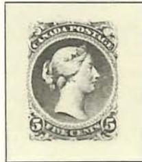
Sc. 26u/CNS 23b/SG 70a 26 i

Unwatermarked Perf. 12 Dent. 1875 (Montreal)