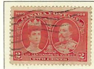
King Edward VII and Queen Alexandra