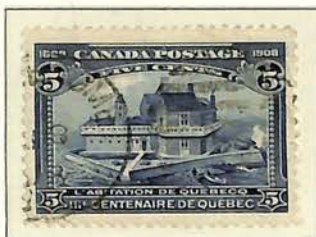
Champlain's Home in Quebec abt. 1608