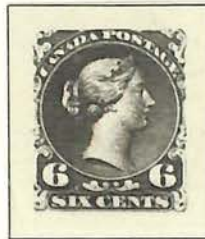
brown 27 c