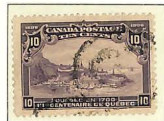
Quebec City in 1700