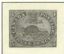
$50 orange red 1