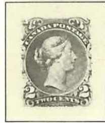
green 24 b