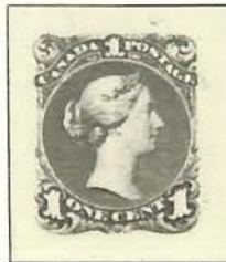
brown red 31

Unwatermarked, horizontal laid paper — Papier vergé horizontal OTTAWA Printings — Perf. 12 Dent. — Impressions OTTAWA