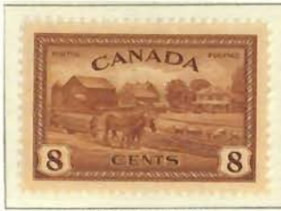
Ontario Farm Scene