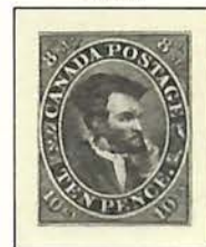
blue 7 C.C.T.