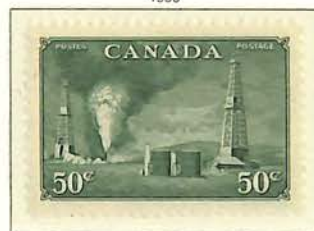
Alberta Oil Field