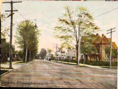
Chinatown, N.Y. viewed from looking east