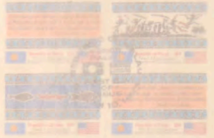
Souvenir Card from the Republic of Palau