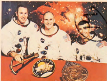
Jim Lovell Tom Mattingly Fred Haise

APRIL 11th, 1970 - As 2:13 PM America's third lunar expedition streaked away from earth on their voyage to the moon, Astronauts Lovell, Haise and Swigert, last minute replacement for Mattingly, reported all was going well as they coasted toward a point a quarter million miles away. APRIL 13th, 1970 - Apollo 13 was in serious trouble today when an explosion in the service module cut-off power to 2 of the 3 electricity-generating cells. The moon mission cancelled the Astronauts continued toward the moon. APRIL 14th, 1970 - The crisis came tonight as the Apollo crew rode the crippled commandably "Odyssey" around the backside of the moon. The engine of the lunar lander "Lunarion" was then fired, sending them on a correct course back to earth. Failure to fire the engine at the precise moment would have meant certain death to the Apollo 13 crew.