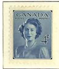
Marriage in 1947 to Lt. Philip Mountbatten