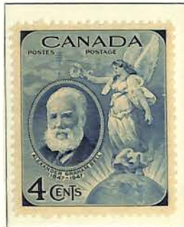
Inventor of Telephone