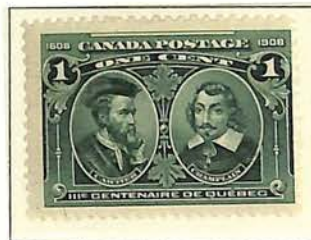
Cartier (1491/1557) & Champlain (1570/1635). founder of Quebec in 1608