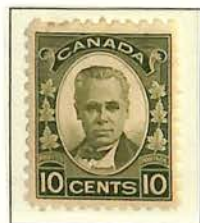
Georges Etienne Cartier