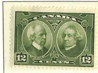
Laurier (1841/1919) & Macdonald (1815/91)