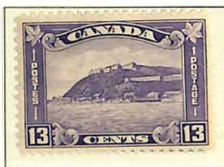
Sc. 201/CNS 157/SG 325/M. 168