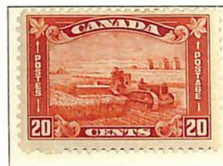
Harvesting with tractor