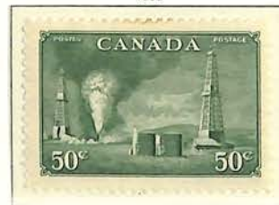
Alberta Oil Field