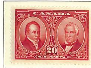
Formed first liberal administration