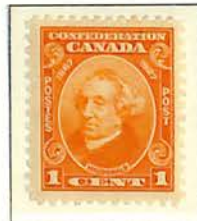
Prime Minister 1867/73 & 1878/95