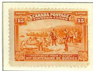
Champlain's Departure for the West (1609)