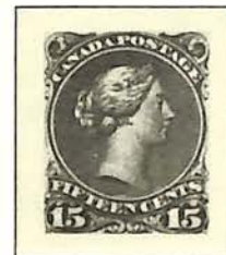
Sc. 30a/CNS 26a/SG 72a

"PIRIE" Script Wmk. Perf. 11½ × 12 Dent. 1876 (Montreal)