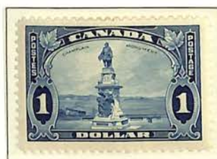
Champlain Monument, Quebec

Cette série marque le début des dates cachées