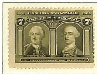
Opposing Commanders in 1759 Quebec Battle L. J. de Montcalm (French) & J. Wolfe (Engl.)