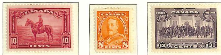
Royal Canadian Mounted Police