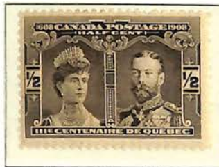
Prince and Princess of Wales (later George V. and Queen Mary)