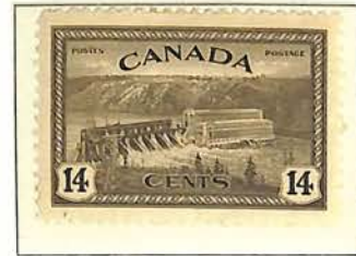
St. Maurice River Power Station