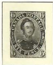
reddish purple (very thick soft paper)