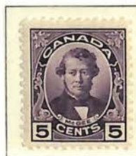
Minister of Agriculture 1864/68