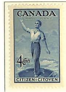
Advent of Canadian Citizenship