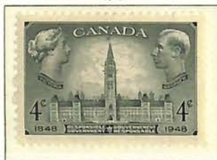
100 years Responsible Government