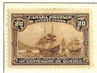
Cartier's Arrival before Quebec in 1535