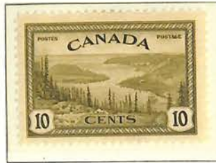
Great Bear Lake