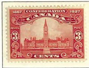
Parliament at Ottawa