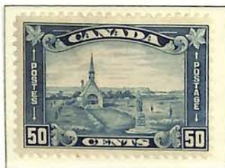
Acadian Church at Grand Pré, N. S.