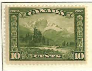
Mt. Hurd, B.C.