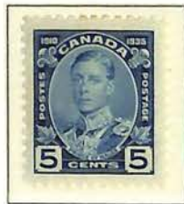
Prince of Wales (later Edward VIII)