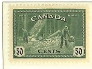
Lumbering in B. C.