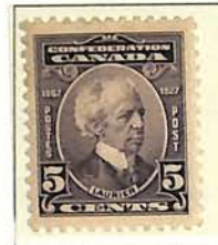
Prime Minister 1896/1911