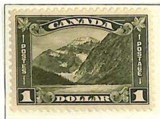
Mt. Edith Cavell, B. C.