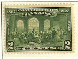
"Fathers of Confederation"