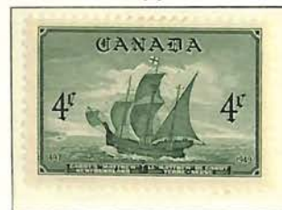
1949 N. F. enters Confederation