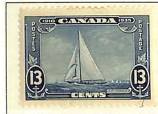
Royal Yacht "Britannia"