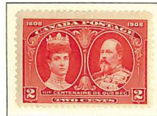
King Edward VII and Queen Alexandra