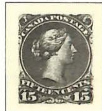
greenish gray (state)