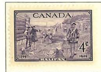
Halifax founded in 1749