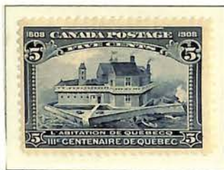
Champlain's Home in Quebec abt. 1608