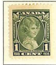
Princess Elizabeth (later QE II)