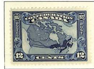
Map illustrating country's growth