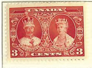
H. M. George V and Queen Mary

"Silver Jubilee" 25th Anniv. Reign of King George V