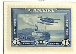
Seaplane over SS "Distributor III" on River Mackenzie

Upon the death of King George V in January 1936, his eldest son became King Edward VIII . Yet, still in that same year, he abdicated the throne and gave it to his brother who reigned as King George VI from 1936 to 1952