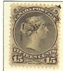
gray purple (shades)