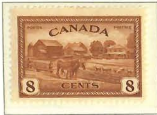
Ontario Farm Scene