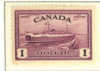
Ferry between N. B. and P. E. I.