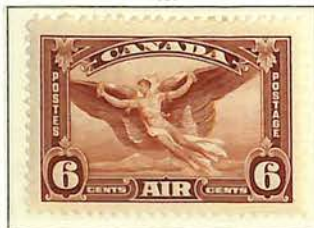
"Daedalus in Flight" (painting by A. E. Forsberg)