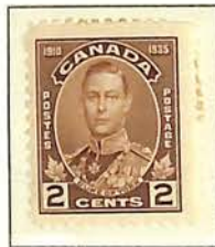
Duke of York (later George VI)