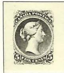
Sc. 26//CNS 23b/SG 70a

Unwatermarked Perf. 12 Dent. 1875 (Montreal)