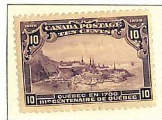
Quebec City in 1700