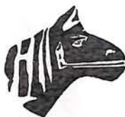
PA-H 13 1861-67 New York, New York