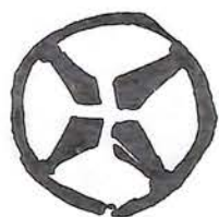
GE-C 111 1861 New York, New York