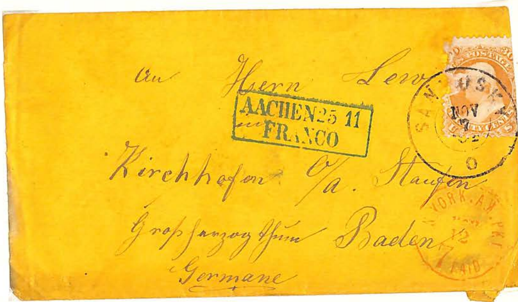
71 tied by SANDUSKY, OHIO town cancel to Germany with AACHEN receiving mark