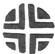
GE-E 87 1861-63 New York, New York red, black