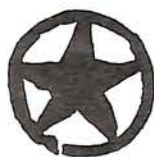
ST-S 22 1867