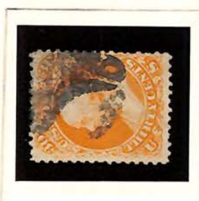
"horse" or "zebra"