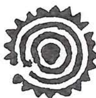
GE-P 57 1861 New York, New York