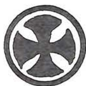
CR-M 10 1861 Lodi, New York blue, black