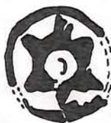
ST-6P 30 1861 New York, New York