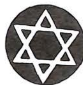
ST-6P 11 1861 Hebron, Connecticut