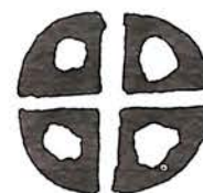
CR-X 10 1869 New York, New York