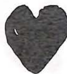
PH-H 11 1869