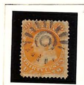
Type 1 9 mm