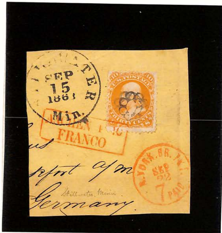
NO. 71 STILLWATER, MINN. RARE RED PACKET BOAT MARKING