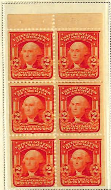
TYPE 1 SCARLET NH 275-