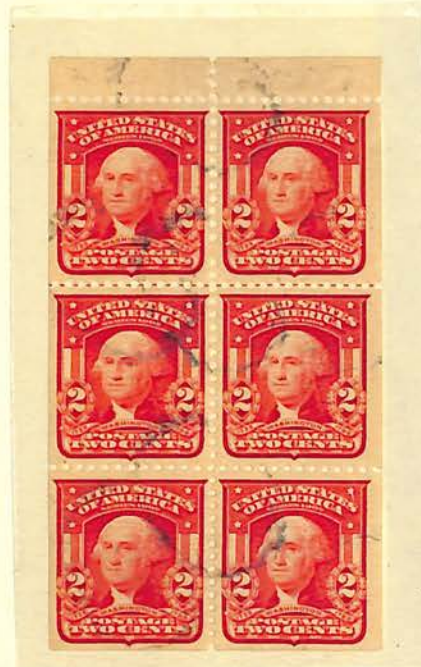
3763 319g. CARMINE TYPE 1 w/pt. #450 TYPE 1