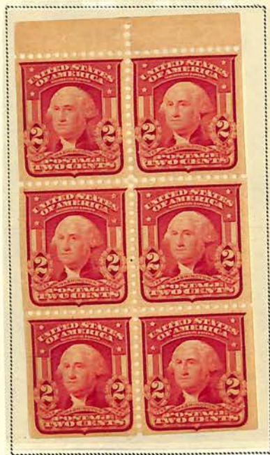
319 Fq. (H) 300- TYPE II LAKE