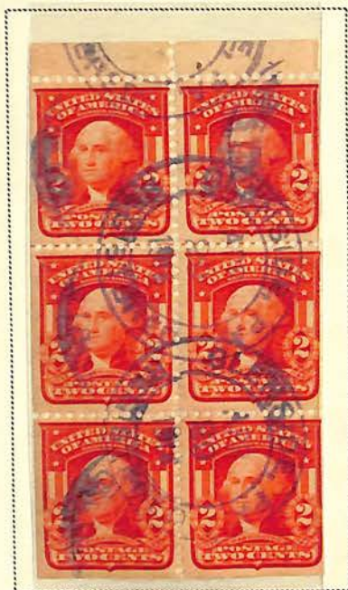
319 Fh Type II used CARMINE BLUE REGISTERED HANDSTAMP → VALUE