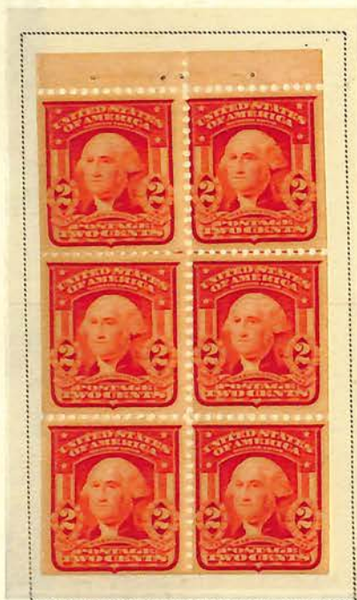
TYPE 1 CARMINE ROSE / w/H 319a 5000 CARMINE