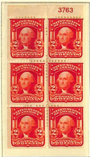
3763 319g. w/pt. number CARMINE w/H HORIZONTAL WMK / REVERSED TYPE 1 23,000