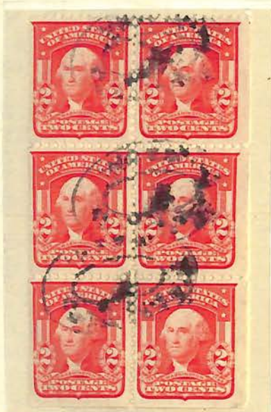
MISSING TOP SELVAGE ROSE CARMINE