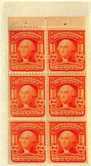
SCARLET $140 H/H TYPE 1