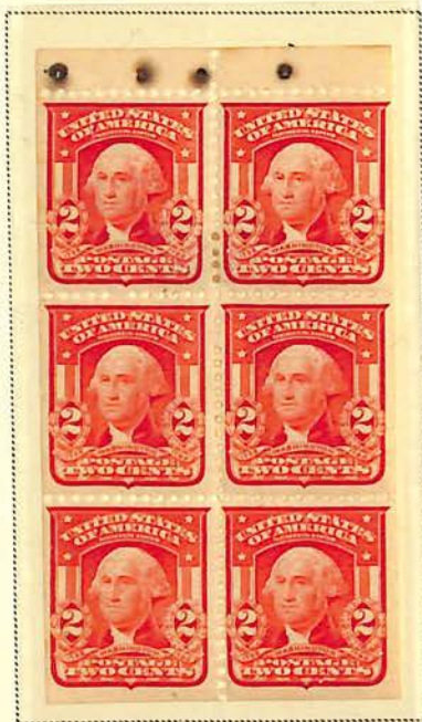
CARMINE ROSE / NG 275 TYPE 1 319 n STAPLE HOLDS / STAINED