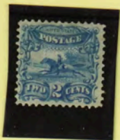
Style No. GK 102a

Figlio Design # it us at IP.COM 203 figliodesi om 11060 Boston P. O. BOX 21 rd CT. 06437 Phone# 203-203-506-1121 KIPID STEWART LOT 203