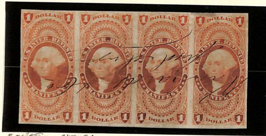
ECV 480 Strip of 4 EV 500 SUPERB MARGINS