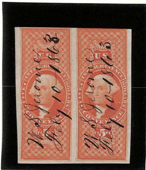
R89a pair $140 40 200