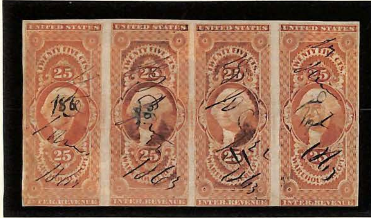
R50a STRIP OF 4 500 +