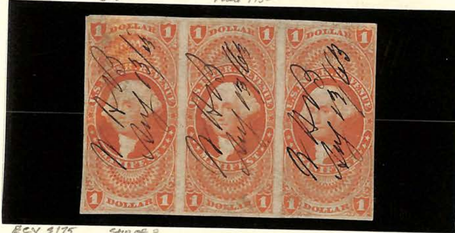
ECV 9175 Strip of 3