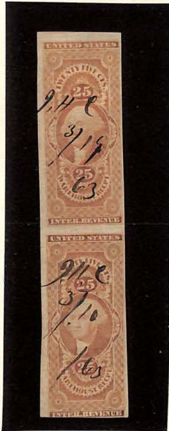
R50a pair 250