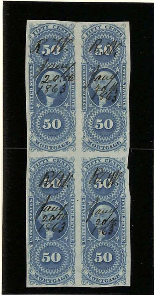
R59a BLOCK OF 4 500- 119