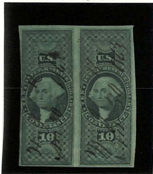
R97a pair 300 350