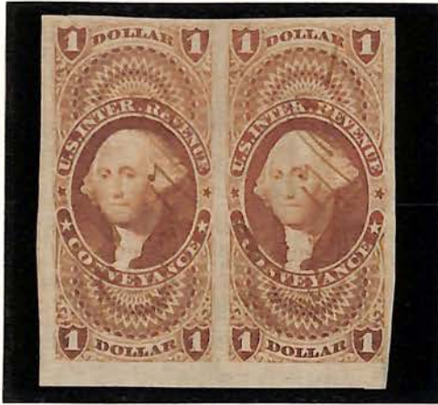
R66a pair 95 90 150 90- SUPERB MARGINS