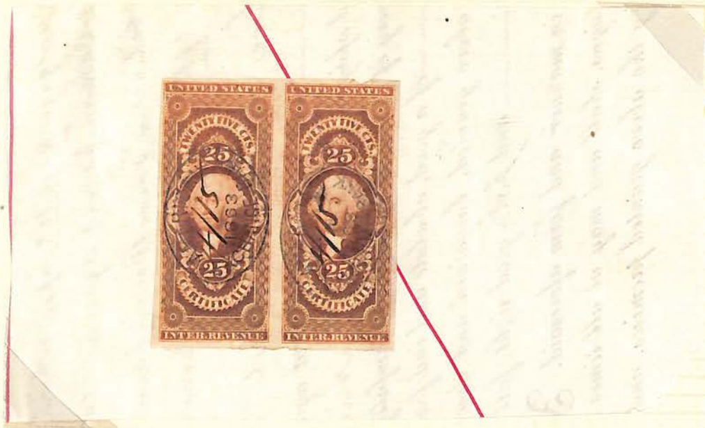
R44a on piece EV #60-