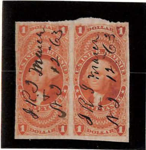
R15 B. HER MANUSCRIPT EV 200 90-