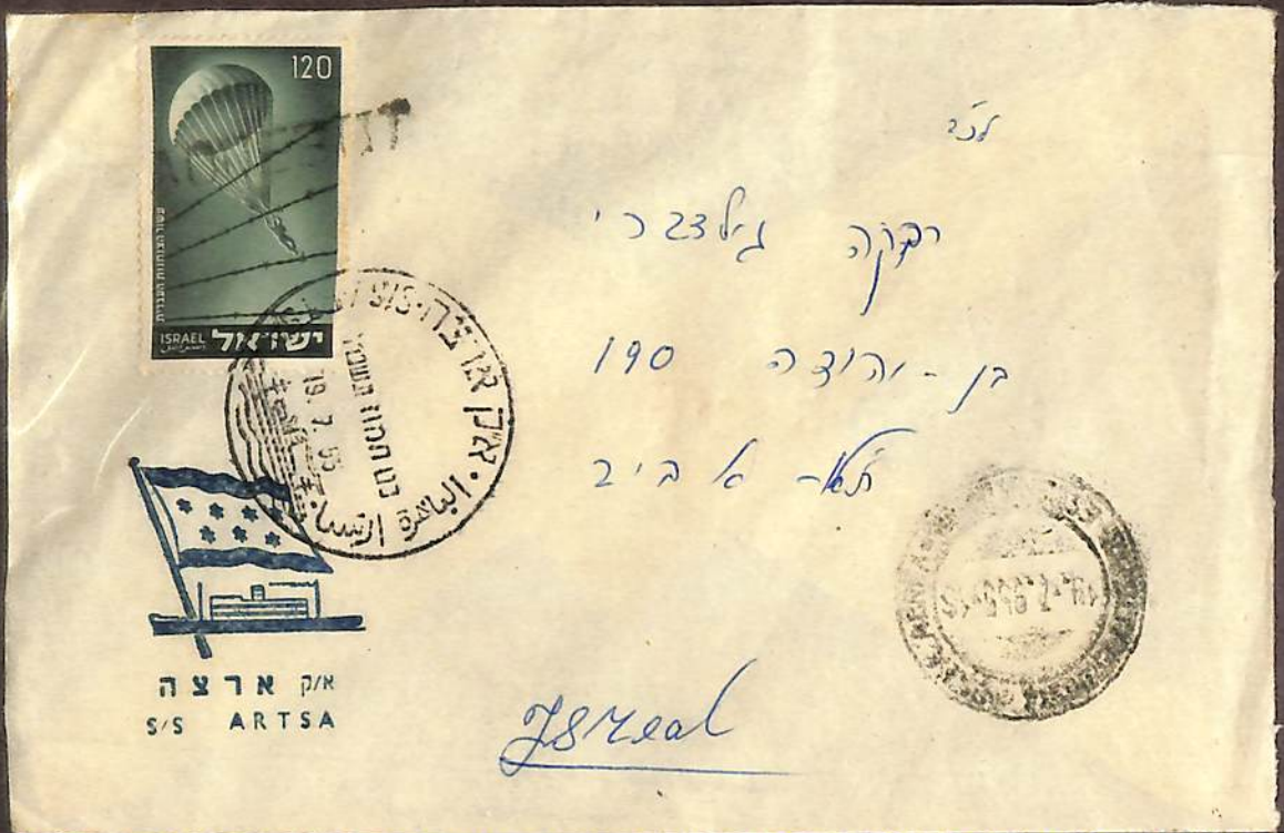
d)7/1955, as single franking on an official ZIM stationery cover of S/S ARTSA. Mailed on board ship, as stamp tied by linear "PAQUEBOT" hstamp & by S/S Artsa cds. Actually posted to TLV, Israel; has rather faint Italian transit cds a lower right... uncommon! $20