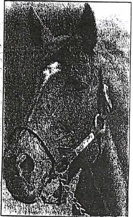
Secretariat, who won the 1973 Triple Crown in record-setting times, may have been the greatest race horse in history.