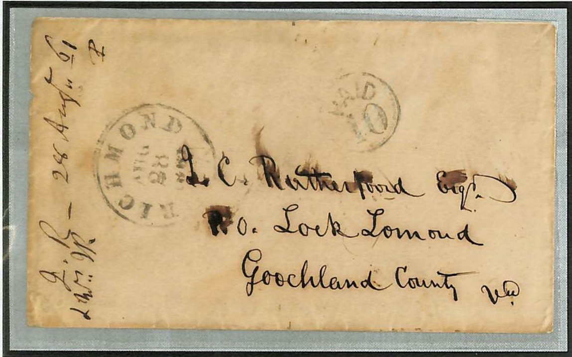
Paid 10 August 28th 1861 Richmond, VA.