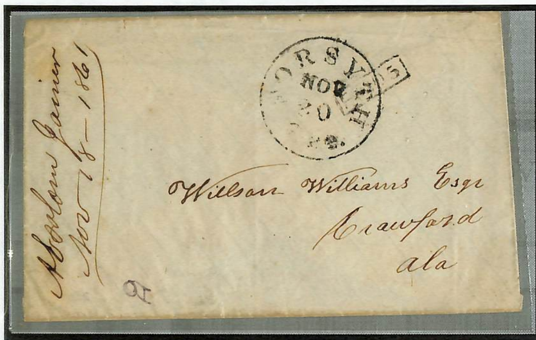
Paid 5 (in box) November 20th 1861 Forsyth, GA.