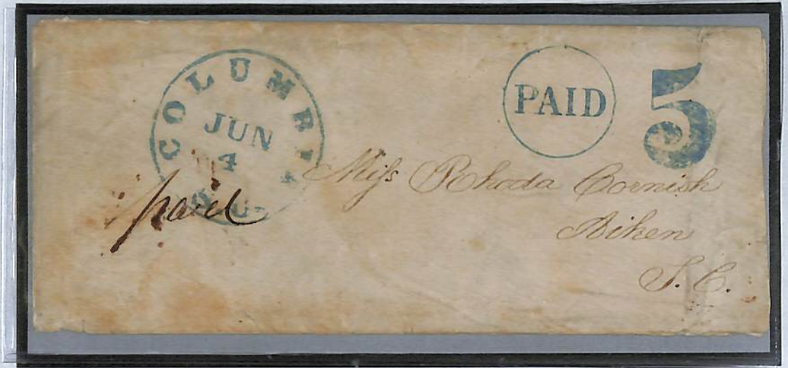
#18xu14 Columbia, SC June 4 1861 (w/letter)

Issued between June 1st 1861 & October 16th 1861