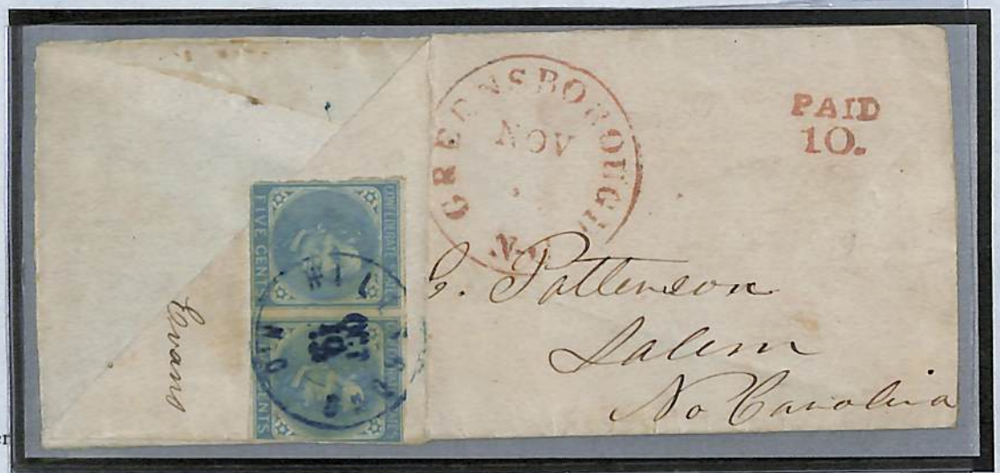
#31xu2 Greensborough, NC May 14 1861 (red turned cover)