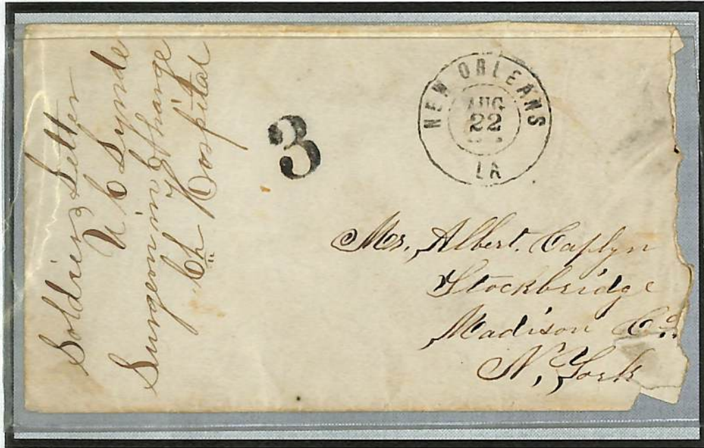
"3" August 22nd New Orleans, LA.