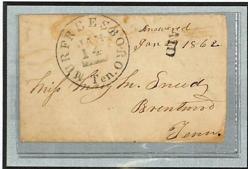
Paid January 14th 1862 Murfreesboro, TN.