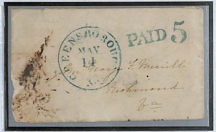
#31xu1 Greensborough, NC May 14 1861 (blue)