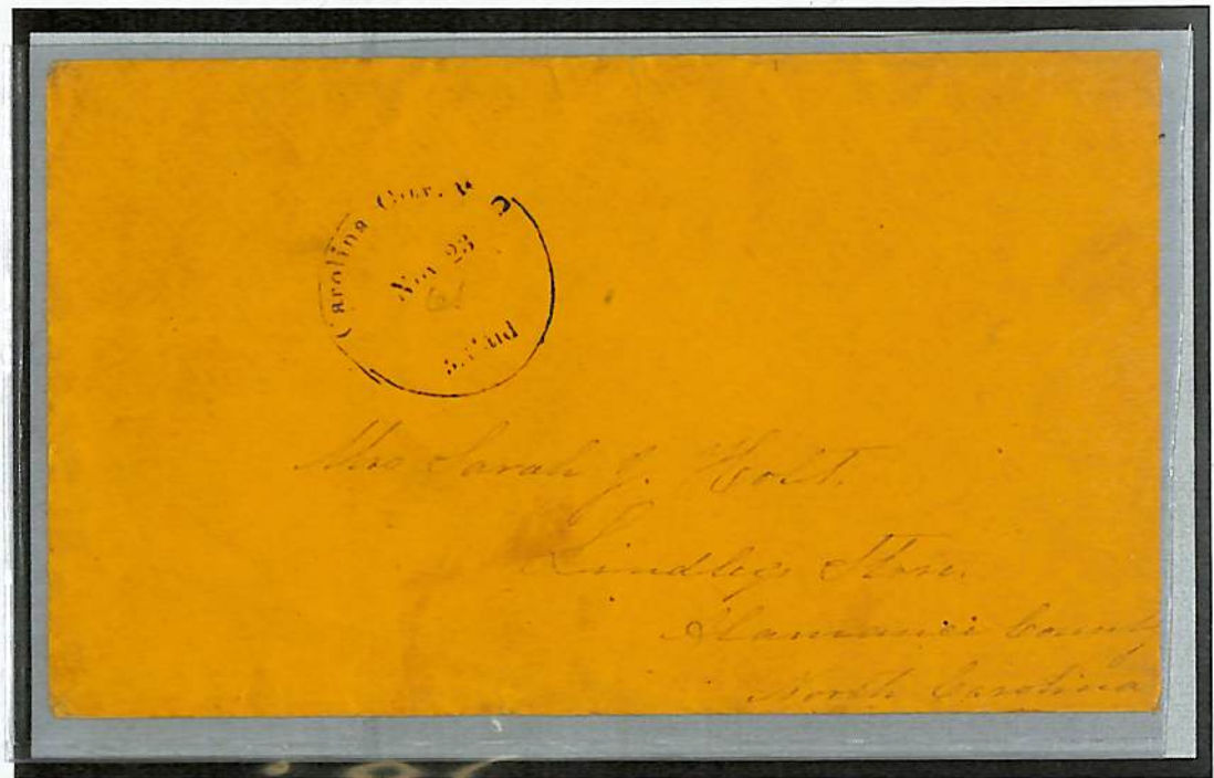
#118xu? Carolina city, NC November 23rd 1861 (unlisted example of circular cancel. only straight line cancel known)