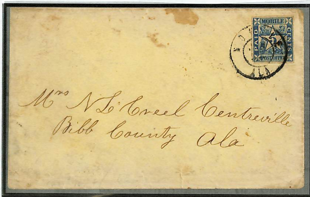
#58x2 Mobile Alabama