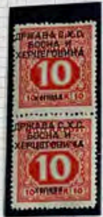
83. 10/10/1918 10/10/1918