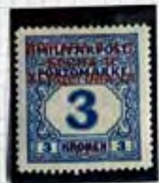
85. 3/3/1918 3/3/1918