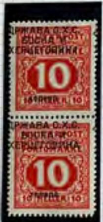
84. 10/10/1918 10/10/1918