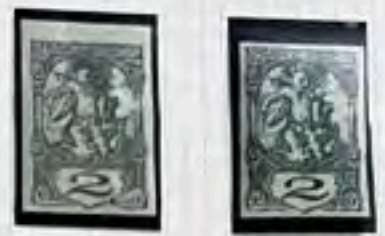
Small Type - 2's