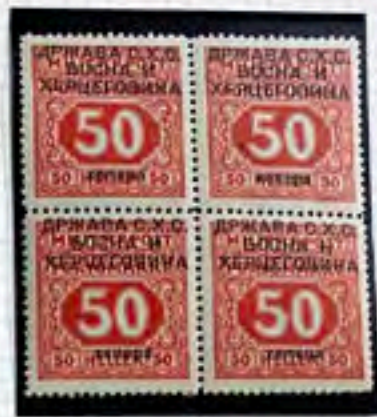
82. 50/50/1918 50/50/1918