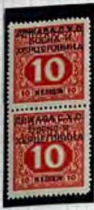
81. 10/10/1918 10/10/1918