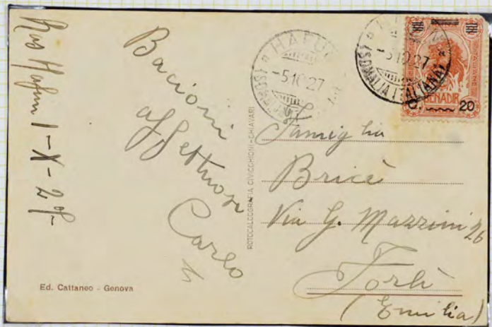
October 1927 postcard to Emilia, franked 20 centesimi, representing the international postcard rate

A coastal settlement, on a headland in the far north-east of the country