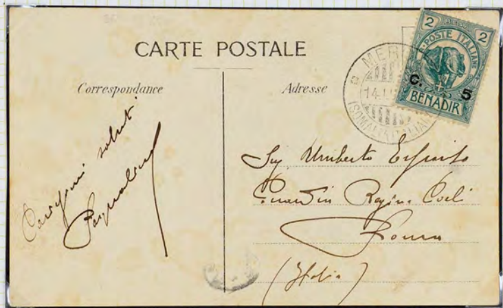
July 1909 picture postcard to Rome, featuring a Merca village scene and franked at the 5 centesimi rate for greetings cards with no substantive message

A fishing village on the coast south of Mogadishu