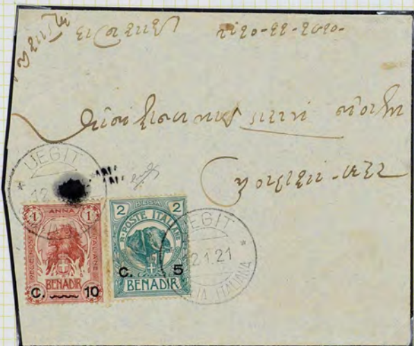
January 1921 merchant's cover in local script addressed to Mogadiscio, and franked at the 15c rate. Ink smudge affects one stamp but extremely rare. Biondi certificate

A settlement near the Ethiopian border north west of Mogadishu