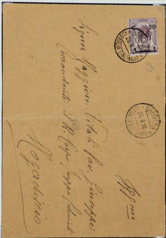
August 1916 cover to Mogadiscio, franked at the new internal rate of 20c using one of the interim surcharge values to pay the postage, Signed Biondi

An agricultural settlement on the Juba (Giuba) River, north of Kismayu and approximately on a level with Mogadishu