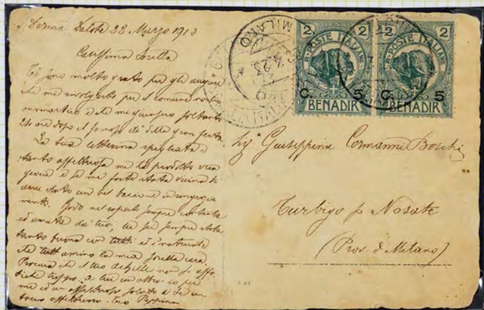
March 1913 picture postcard to Milan, with substantive message, franked at the 10 centesimi normal postcard rate

An inland settlement on the Juba (Giuba) River, representing a border post on what was then the frontier with British East Africa