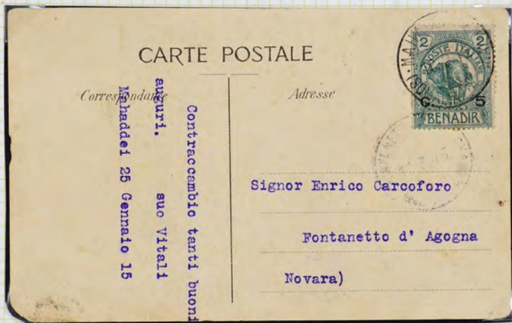
January 1915 picture postcard to Novara, franked at the 5 centesimi rate for greetings cards with no substantive message

A settlement on the Webi Shebbelle river directly north of Mogadishu