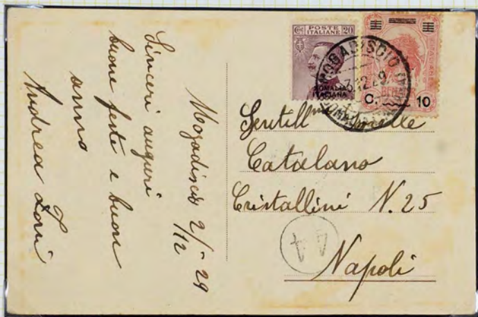
December 1929 card to Naples franked at the prevailing 30c international postcard rate, using a mixture of the 'floreale' and older Benadir series

The capital of Somalia, and centre of administration during the Italian period.