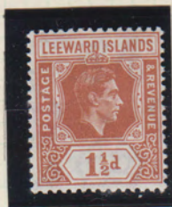
SGNL CW NL