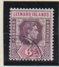
SAME (TONED PAPER)