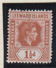
CHESTNUT-BROWN (CW PALE BROWN)