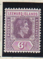
SG NL CW NL