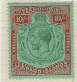
SG 796 BROKEN CROWN £300 + SCROLL