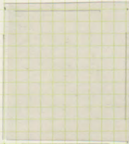
SG 80a BREAK IN SCROLL