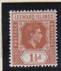
SGNL CW 4a