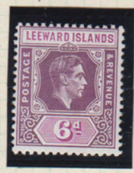
SG 109b CW 8c