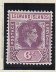
SG NL CW NL