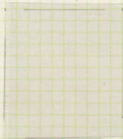
SG 80b BROKEN CROWN + SCROLL