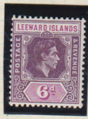
SG 109a CW 8a