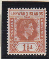
SGNL CW 4b