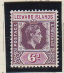
SG 109 CW 8