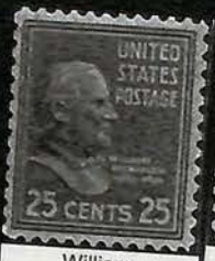
William McKinley — A301