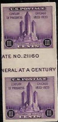
PLATE NO. 21160 AUTHORITY OF JAMES A. FARLEY, POSTMASTER GENERAL