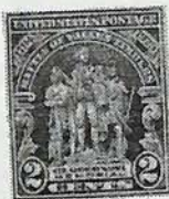
General Wayne Memorial — A199

Memorial to Gen. Anthony Wayne and for 135th anniv. of the Battle of Fallen Timbers, Ohio.