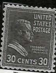
Theodore Roosevelt — A302