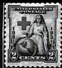
"The Greatest Mother" — A208