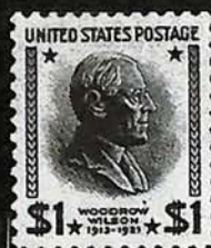
Woodrow Wilson — A304