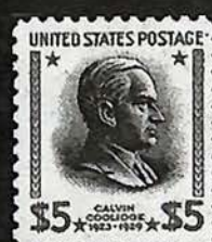
Calvin Coolidge — A306