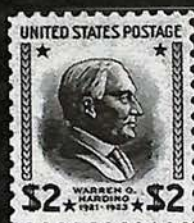
Warren G. Harding — A305