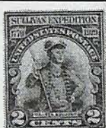
Major General John Sullivan — A198