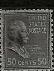
William Howard Taft — A303