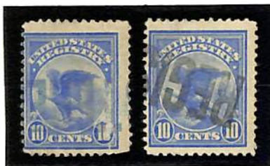
Registered Hand Stamp