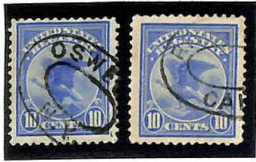
Oval With Town Name