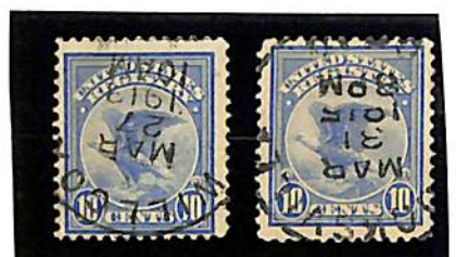
Circular Town and Date