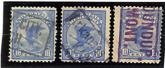
Box Cancels, Town Name