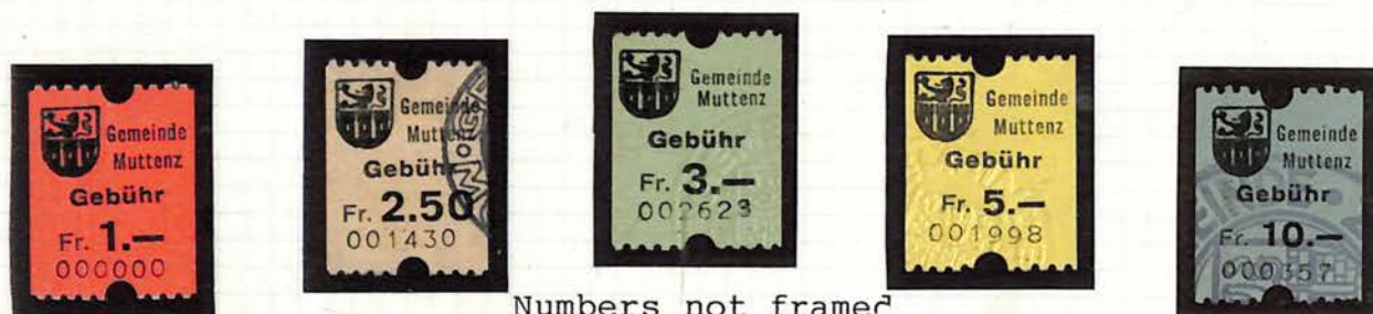
Numbers not framed