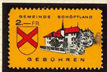
Community of Schoftland 19?? perf.11