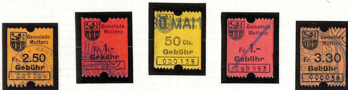
Numbers framed-big emblem

Community of MuttENZ 1948 perf. 10 \frac{1}{4} or 14