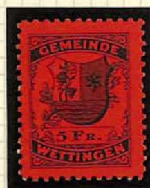
Community of Wettingen 1929 perf. 10