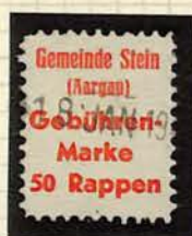
Community of Stein 19?? perf. 11½