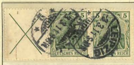
Five pfennig, Michel #85, germania in horizontal combination with Andreas cross. Issued November 11, 1910