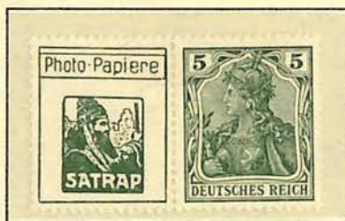
Five pfennig, Michel #85, germania in horizontal combination with label R13. Label advertises Satrap Photo Paper