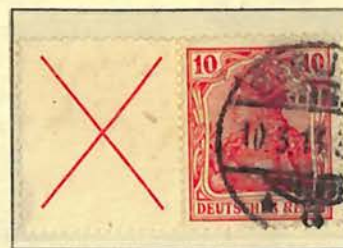
Ten pfennig, Michel #86, germania in horizontal combination with Andreas cross. Issued July 1912