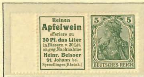
Five pfennig, Michel #85, germania in horizontal combination with label R1. Label advertises Apfelwein.