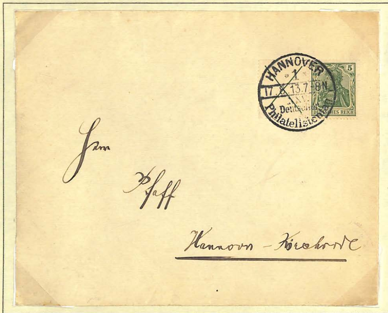
Five pfennig, Michel #85, germania in vertical combination with Andreas cross on cover. The cover is cancelled with commemorative cancel for the Hannover Philatelic Day on August 17, 1913.