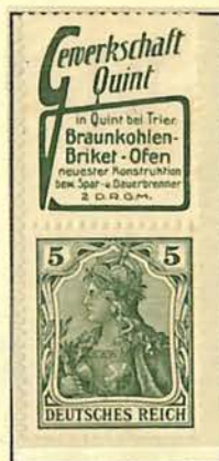
Five pfennig, Michel #85, germania in vertical combination with label R5. Label advertises Gerwerkschaft Quint.