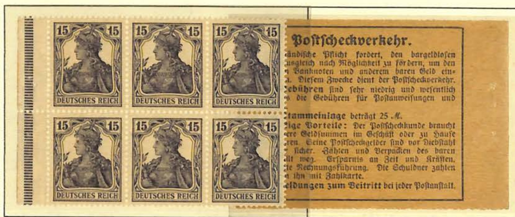
This booklet pane, H-Blatt 15 contains six 15 pfennig Michel #101 stamps.