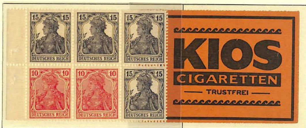
This booklet pane, H-Blatt 21 contains four 15 pfennig Michel #101 and two 10 pfennig Michel #86II stamps.