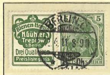
Five pfennig, Michel #85, germania in horizontal combination with label R2. Label advertises Bienen Honig (honey).