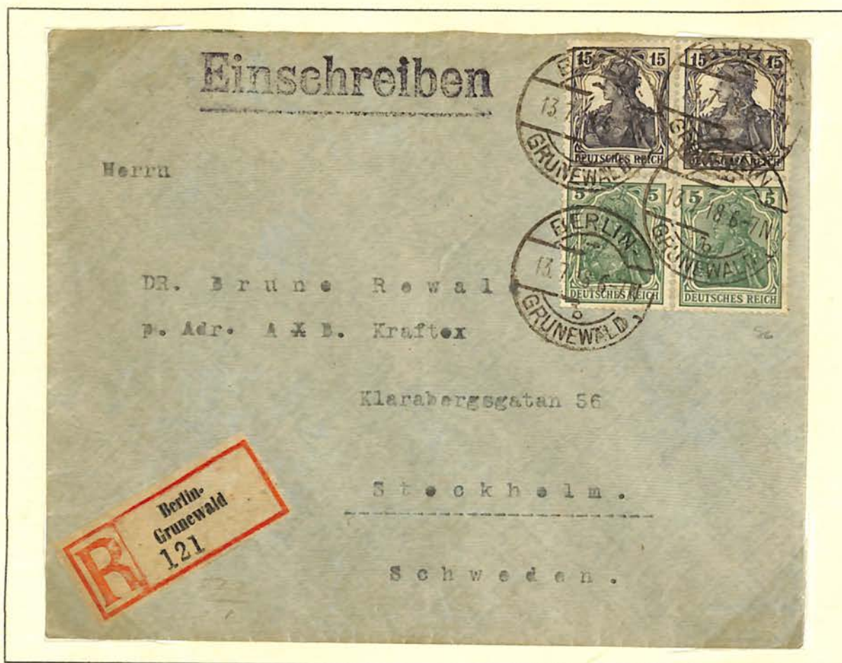
This cover is franked with a pair of Michel S6 issued in September of 1917. This is the 15 pfennig and five pfennig stamp combination from booklet MH9. This registered letter is cancelled Berlin Grunewald on July 13, 1918 and mailed to Stockholm, Sweden.