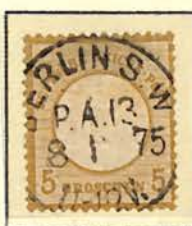
5 Gr as 50 Pf