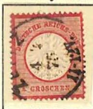
1 Gr as 10 Pf