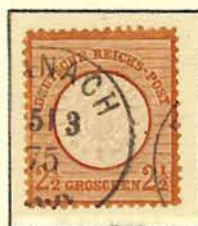
2\frac{1}{2} Gr as 25 Pf