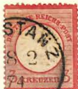
Plate Fault XIa accent over RE of REICH