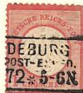
Plate Fault XXIII dot over C in REICH