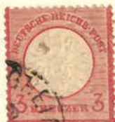
Plate Fault VII white line in bottom border