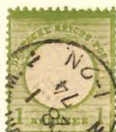
Smeared ink in upper border