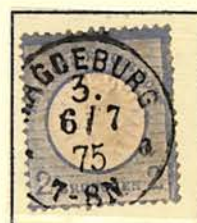
2 Gr as 20 Pf