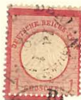
Upper border stamp shifted up