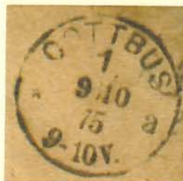
Cottbus receiving mark October 9, 1875

Addressee was not in Cottbus so the letter was returned as indicated by the markings on the back.