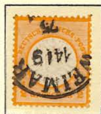
\frac{1}{2} Gr as 5 Pf