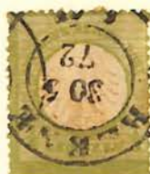
Large 16+ Perforation Holes