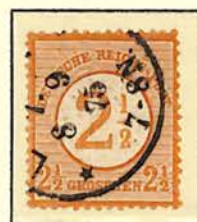
2\frac{1}{2} on 2\frac{1}{2} Gr as 25 Pf

In 1875 the German government unified the Groschen currency of northern Germany and the Kreuzer currency of southern Germany. The new currency was Phennige and Marks. Most of the embossed shield stamps in use since 1872 were not valid for postage after December 31, 1874. The \frac{1}{2} , 1, 2, 2\frac{1}{2} , and 5 Groschen stamps continued to be used as Phennige stamps until December 31, 1875. Stamps used in this manner during the second half of the year are extremely scarce.