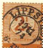
Plate Fault I 1 in 1/2 shifted left