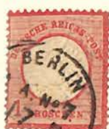
Pre-printing paper wrinkle