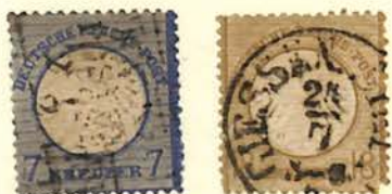
Small 15 Perforation Holes