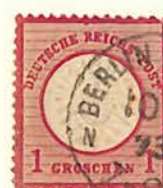
Plate Fault? dot over R in Reich