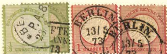
Very Small 14 Perforation Holes