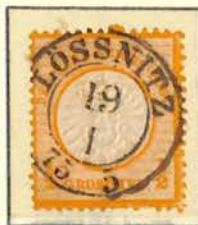
\frac{1}{2} Gr as 5 Pf