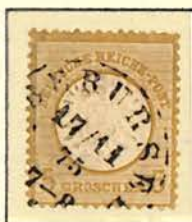
5 Gr as 50 Pf