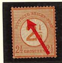
Plate Fault II Broken H