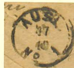
Returned to Goerlitz October 17, 1875