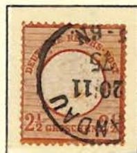
2\frac{1}{2} Gr as 25 Pf