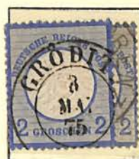
2 Gr as 20 Pf