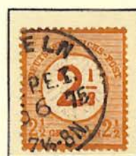
2\frac{1}{2} on 2\frac{1}{2} Gr as 25 Pf