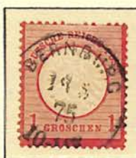
1 Gr as 10 Pf