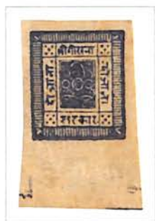
Frame Line 12mm at Bottom