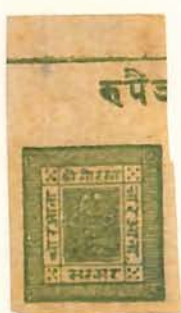
setting 8 pos 6