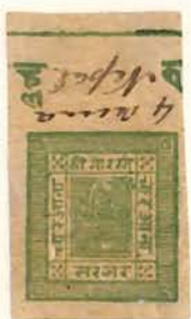
setting 5 pos 3.