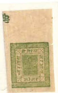
setting 3 pos 2.