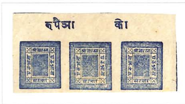
Positions 6, 7, and 8 With Part Marginal Inscription