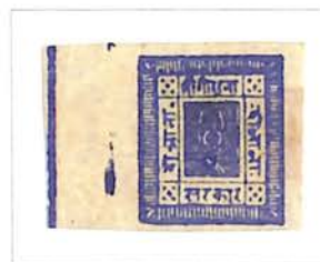
Frame Line 10mm at Left