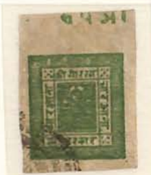
setting 4 pos 7