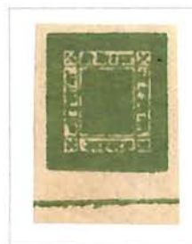
Frame Line 4mm from Stamp at Bottom