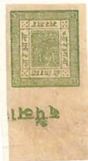
setting 4 pos 7