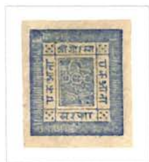
Early Printing Thin, Good Quality Paper