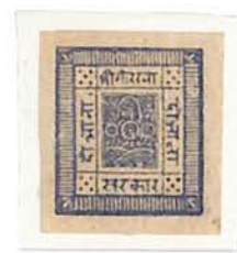
Very Clear Impression on Thin Paper