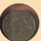
1828 F 12 12 STARS