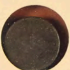
1809 VG 8 2 below 1 0 below 6+9 Leaf midway 5-6 u near ribbon