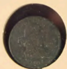
1805 VG Stemless