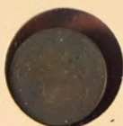
1805 Fine NO STEMS