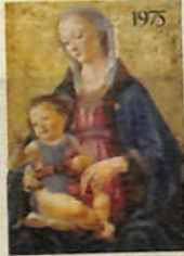
Ghirlandaio: National Gallery Christmas US postage

Errors 24 # 1579a Imperforate pair XF O.G. NH. SCV 75.