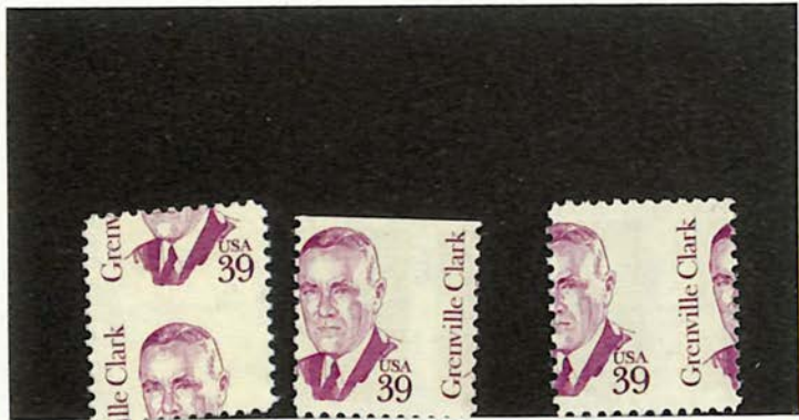
Style No. GK 102-BK2