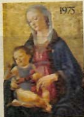
Ghirlandaio: National Gallery Christmas US postage