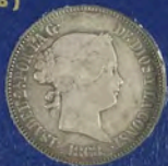
50 Centavos de Peso 1865-1868