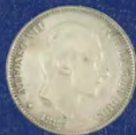
50 Centavos de Peso 1880-1885