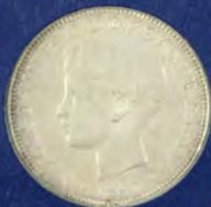
One Peso 1897